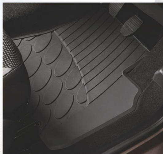
✘ Rubber carpet mat set

Manufactured from hard-wearing washable rubber. Front and rear sets are available and sold separately.