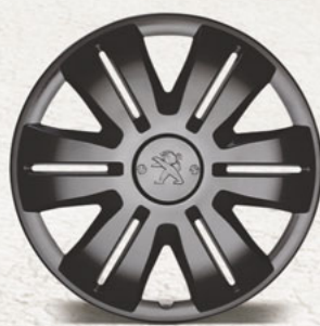
Hubcap secure Storm Grey