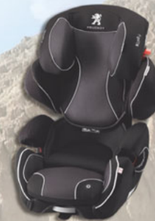
Kiddy Cruiserfix Pro Group: 2, 3