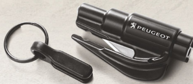
Seat belt cutter / glass breaker (key)

Facilitates the exit of the vehicle in an emergency.