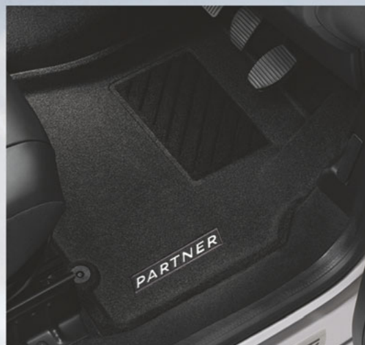
✘ Standard carpet mat set