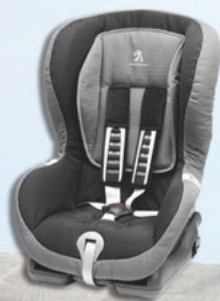
Romer Duo+ Isofix Group: 1