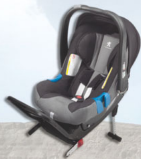
Romer Baby Safe+ Group: 0+

A complete range of seats suitable for carrying children aged from birth to 10 years. All seats offer optimum levels of comfort and are tested and approved by Peugeot. They also comply with the most stringent of safety standards including European approval regulations.