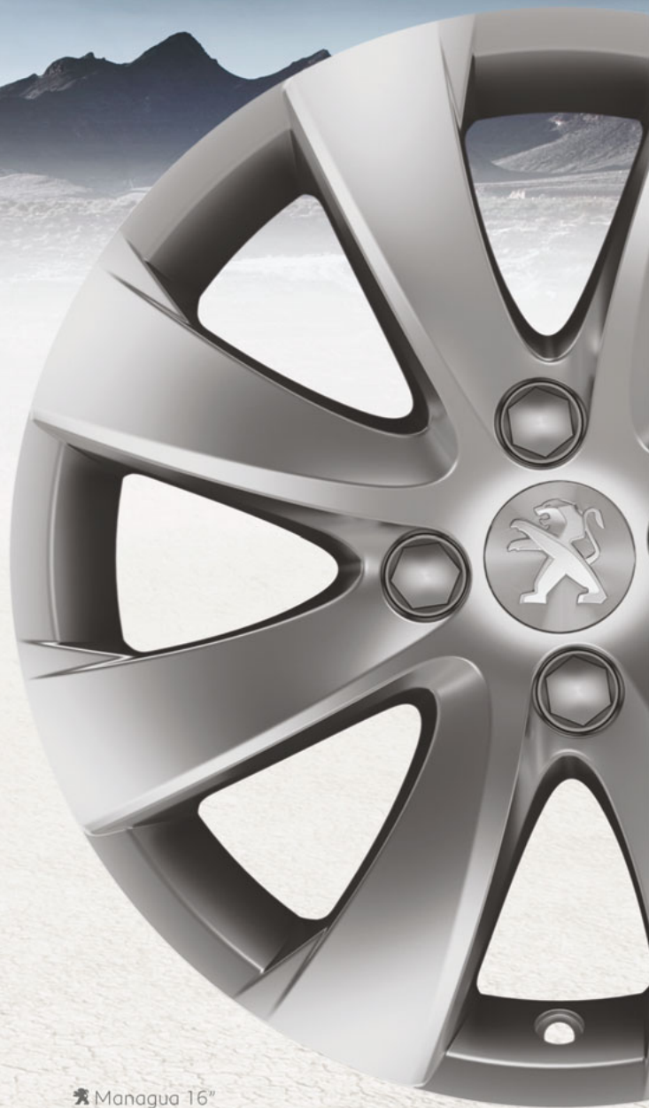
🦁 Managua 16"

* Wheels sold without screws or centre caps.