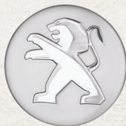
✦ Aluminium Grey Centre Cap (Supplied individually)