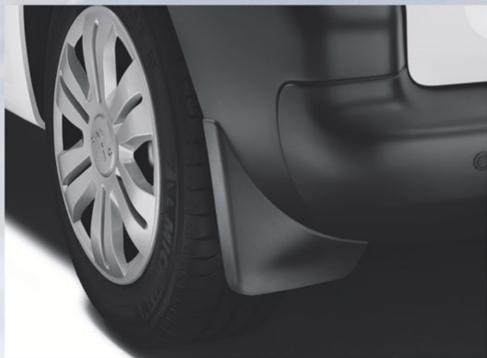
✂ Styled mudflaps - rear