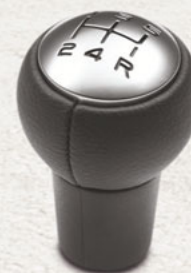
✦ Black leather gear knob with chrome insert