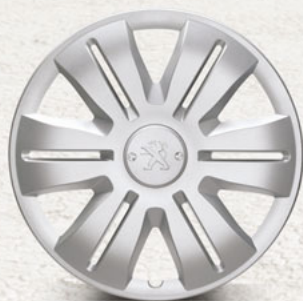
Hubcap secure Grey Spark