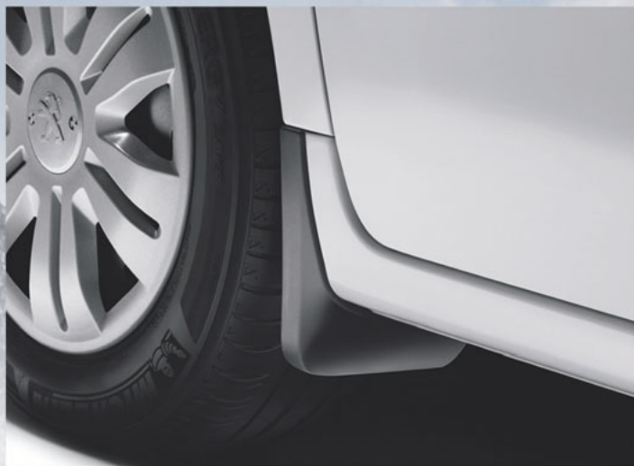
✂ Styled mudflaps - front

Designed to complement the lines of the vehicle whilst protecting the bodywork from damage that can be caused by road debris. Supplied in matt black plastic ready for fitting. They can be painted body colour for that extra special look.