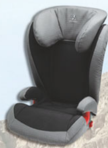
Romer Kidfix Group: 2, 3