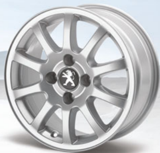
🦁 Twenty First 15"