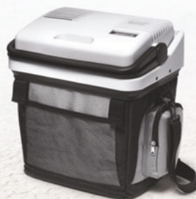
24 litre Isothermal compartment