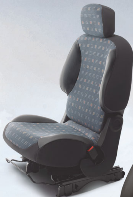
✘ Cloth seat covers

Discover a selection of seat covers and carpet mats to preserve your Peugeot Partner Tepee.