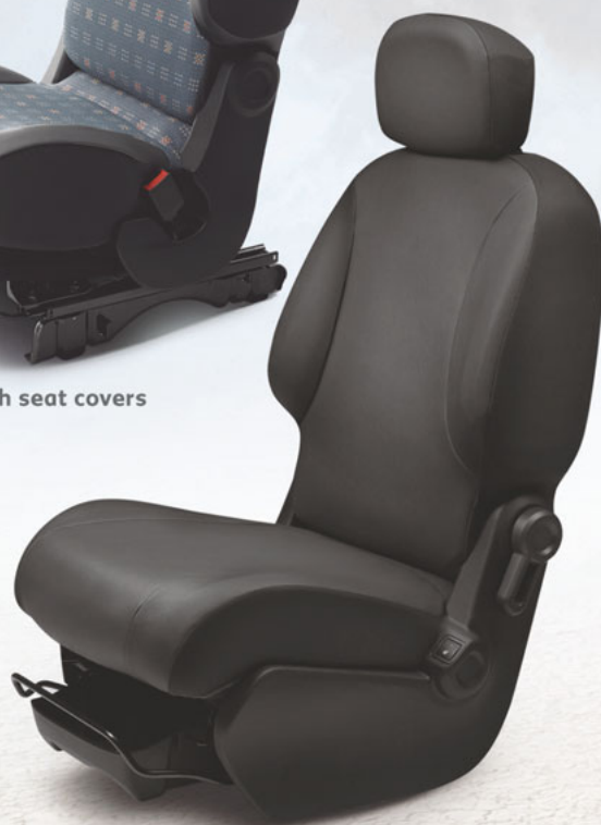
✘ Cloth seat covers