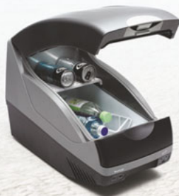
15 Litre Isothermal compartment

Available in a range of litre capacities, these thermal storage units will cool 15°C below ambient temperature. In heating mode contents are heated up to 55°C. It is held in place by either a lap or 3-point seat belt.