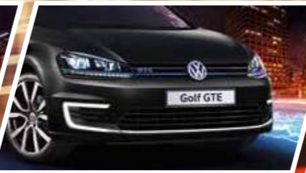
Deep Black 2T Pearl Effect*