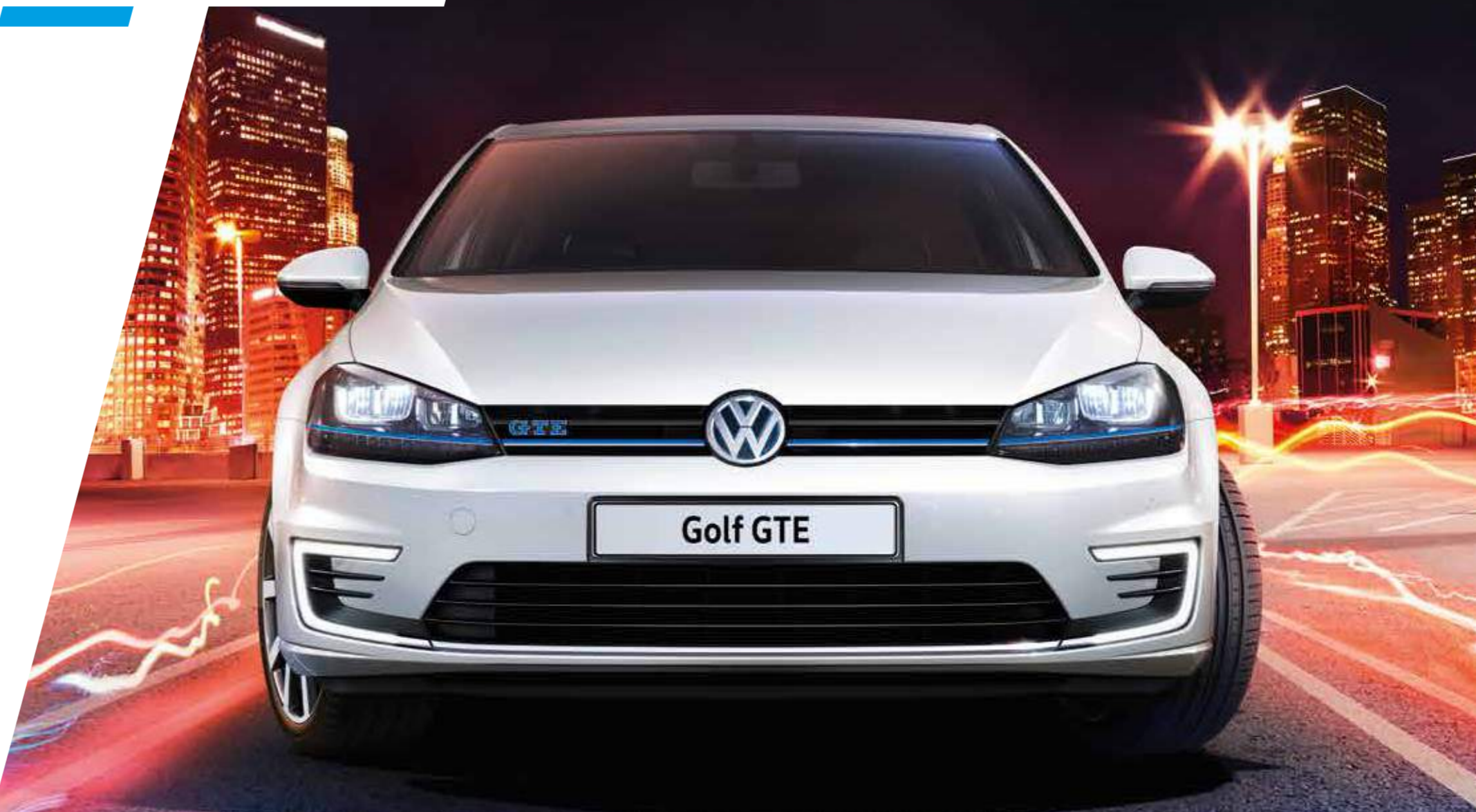
Model shown is Golf GTE with optional Oryx White premium signature paint.