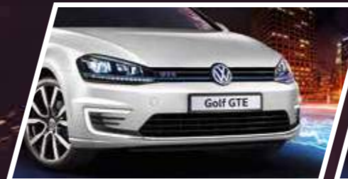
Pure White 0Q Non-Metallic*