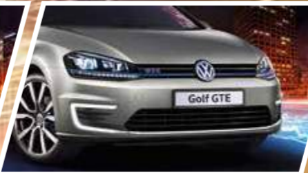
Tungsten Silver K5 Metallic*