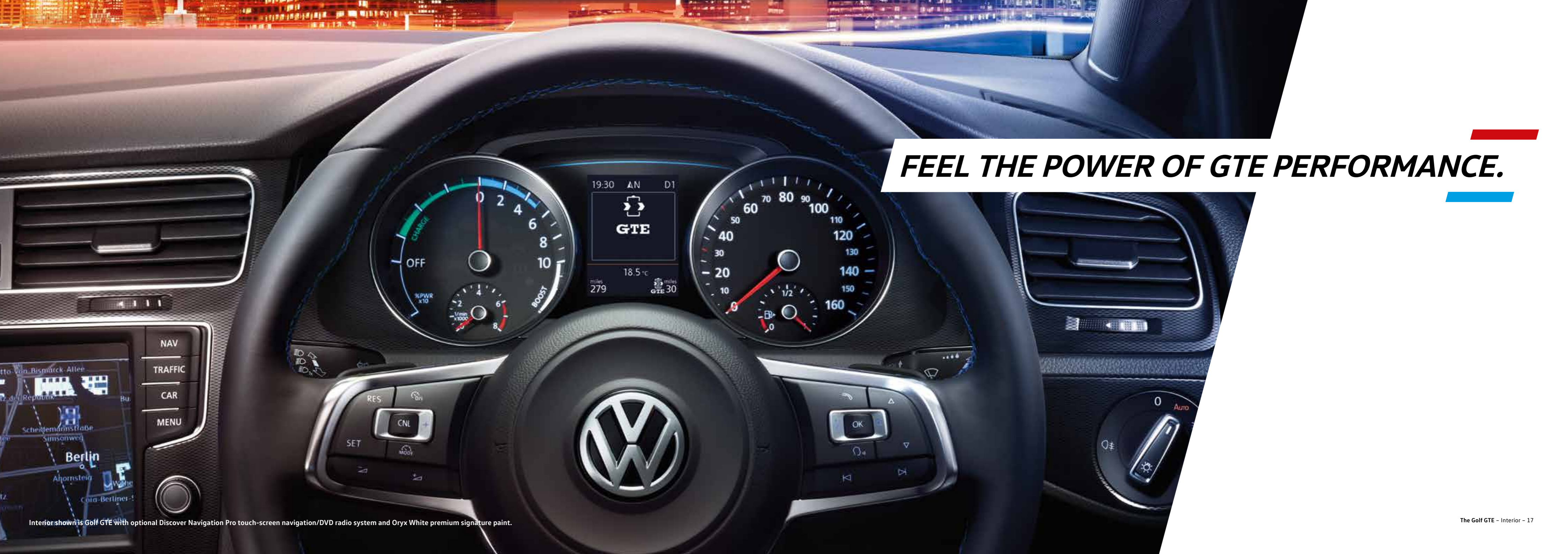
Interior shown is Golf GTE with optional Discover Navigation Pro touch-screen navigation/DVD radio system and Oryx White premium signature paint.