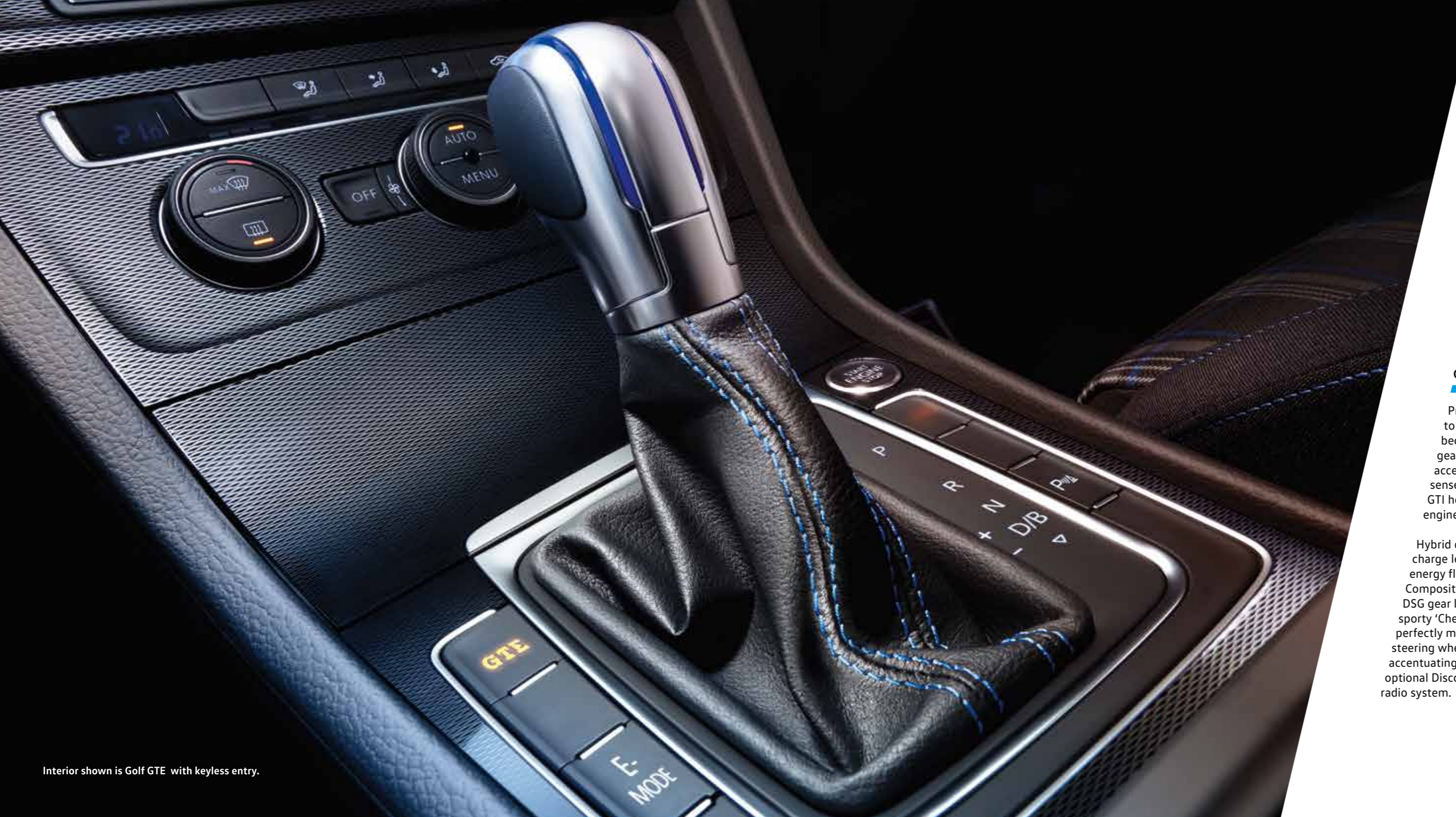
Interior shown is Golf GTE with keyless entry.