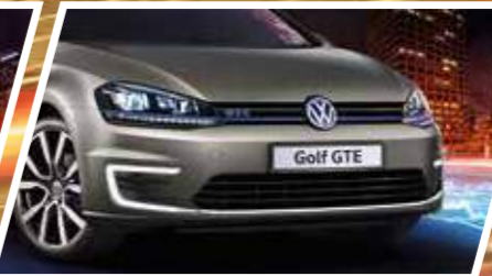
Limestone Grey Z1 Metallic*