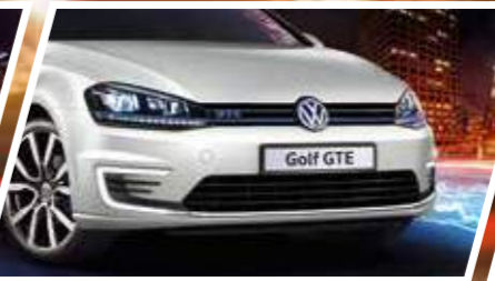
Oryx White 0R Premium Paint*