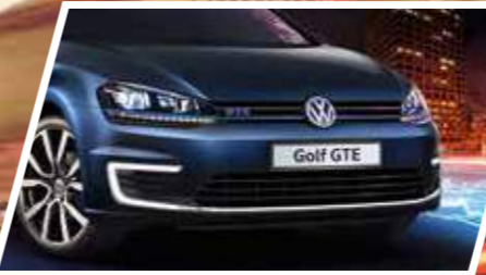
Night Blue Z2 Metallic*