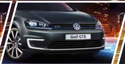
Carbon Grey 1K Metallic*