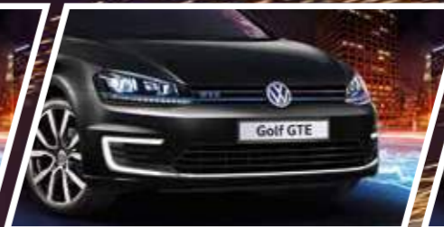
Black A1 Non-Metallic