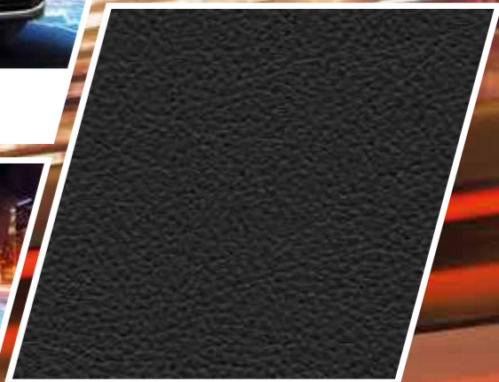
Optional 'Vienna' leather*† Black TW