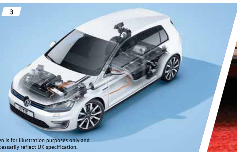
Image shown is for illustration purposes only and may not necessarily reflect UK specification.