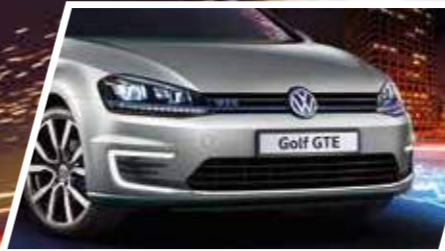
Reflex Silver 8E Metallic*