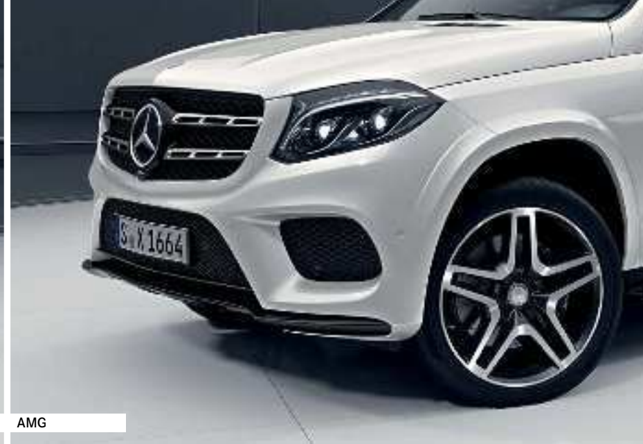
Cargo & Care AMG