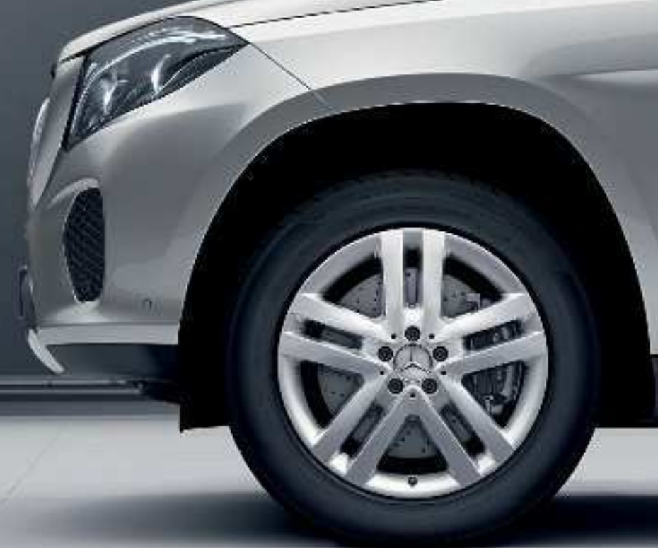
48.3 cm | 19" 01 48.3 cm | 19" 02