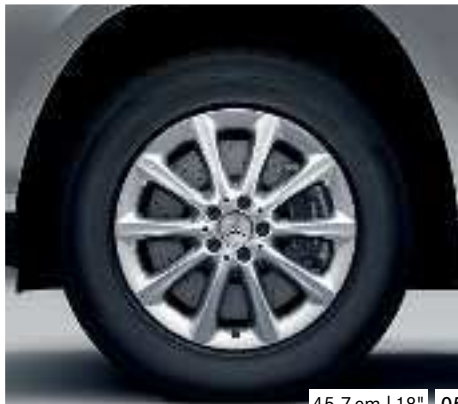
45.7 cm | 18" 05 06 45.7 cm | 18" 45.7 cm | 18" 07 08 45.7 cm | 18"