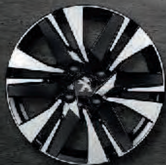
16" 'Aquila' Alloy Wheel