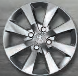
15" Steel Wheel with 'Iode' wheel trim