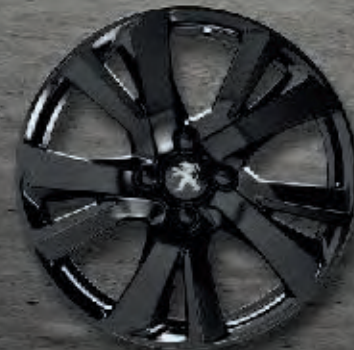
17" 'Eridan' Black Alloy Wheel