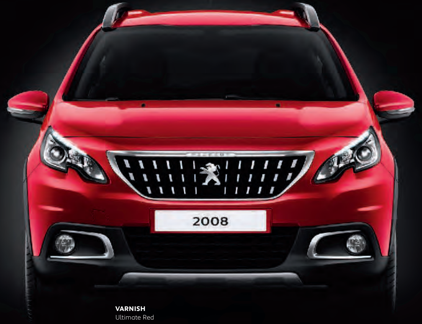
VARNISH Ultimate Red

*Colours available according to version.