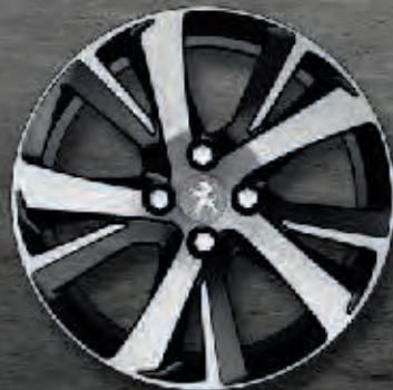
17" 'Eridan' Brilliant Black Alloy Wheel