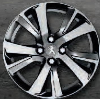
17" 'Eridan' Anthra Alloy Wheel