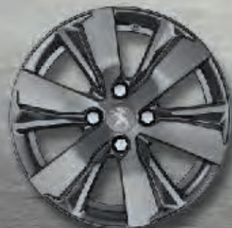
16" 'Hydre' Alloy Wheel