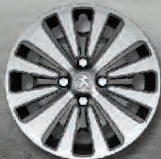
16" Steel Wheel with 'Stronium' wheel trim