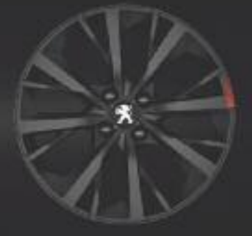
18" 'Lithium' Alloy Wheel**