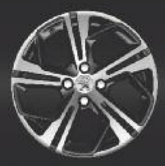
17" 'Carbone' Onyx Black Alloy Wheel*