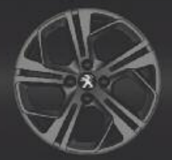
17" 'Carbone' Storm Grey Alloy Wheel*