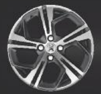
17" 'Carbone' Technical Grey Alloy Wheel*