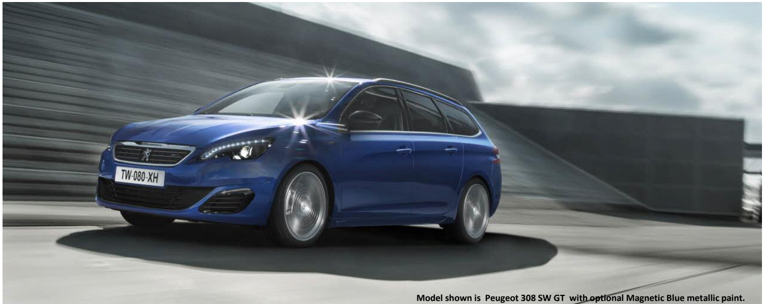
Model shown is Peugeot 308 SW GT with optional Magnetic Blue metallic paint.