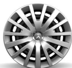
15" 'Ambre' Trim

1. Allure 1.6 BlueHDI 120 manual is fitted with 16" 'Diamond' alloy wheel