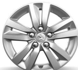
16" 'Quartz' Alloy