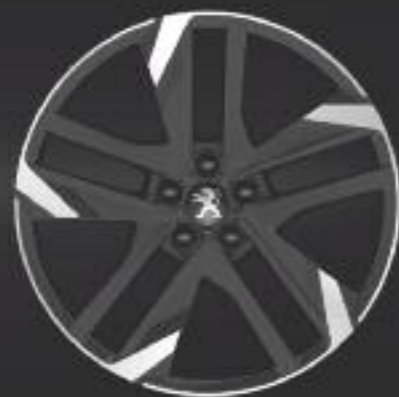
'CARBONE' 19" lightweight alloy wheels