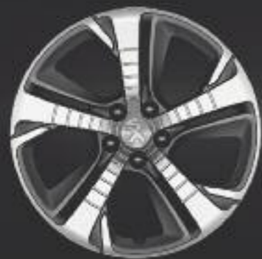
'DIAMANT'* 18" diamond-cut alloy wheels