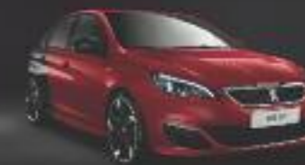
Ultimate Red / Nera Black