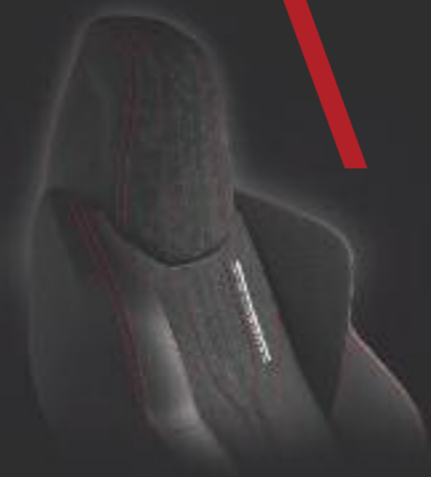
2. PEUGEOT SPORT bucket seats in Mistral black Alcantara, black cloth and leather effect material with red top-stitching.