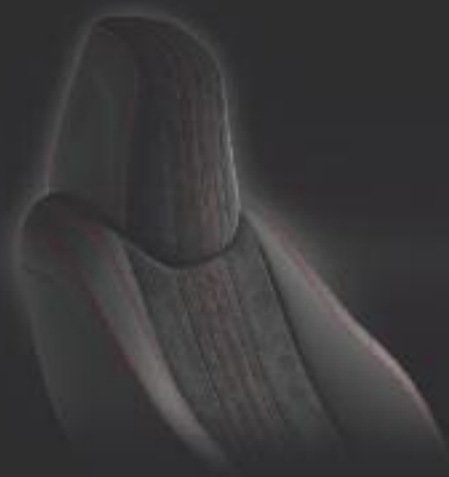
1. Sports seats in Mistral black Alcantara and leather effect material with red top-stitching.