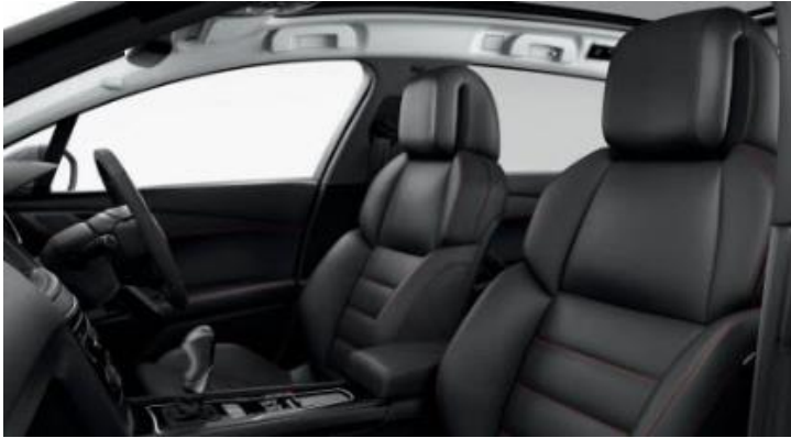
Quad Zone Climate Control

Quad Zone Climate Control: Allows for the independent temperature programming for four separate zones for optimised driver and passenger comfort. Also includes automatic function. Builds on the standard dual zone climate control on the Peugeot 508 range. Option also includes sun blinds for rear side windows on saloon and SW and a rear window sunblind for saloon models. (Optional on Allure models and above)