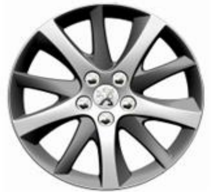
18" 'GT Line' Alloy