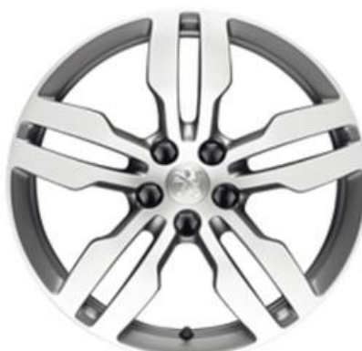
18" 'Cian' Alloy