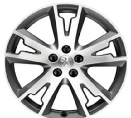
18" 'Attila' Alloy