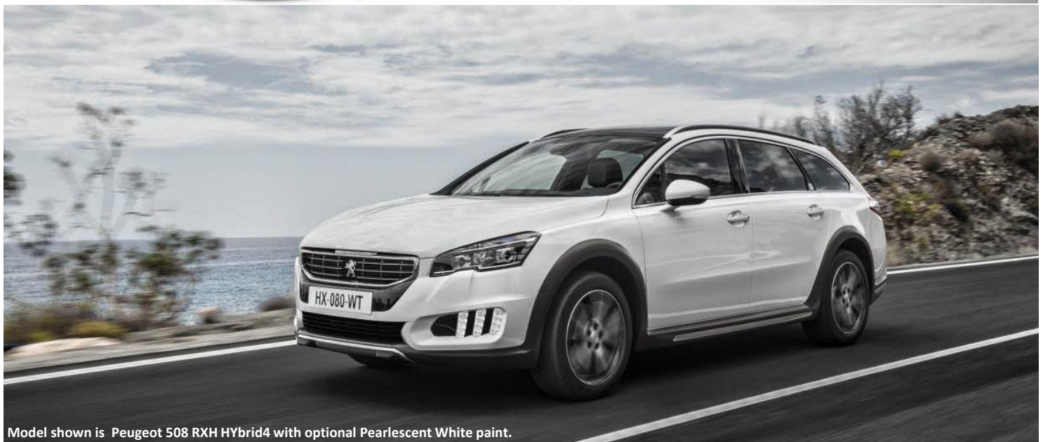
Model shown is Peugeot 508 RXH HYbrid4 with optional Pearlescent White paint.

In the Four-wheel drive setting the rear wheels are driven by the electric motor and the front wheels by the HDi diesel engine.