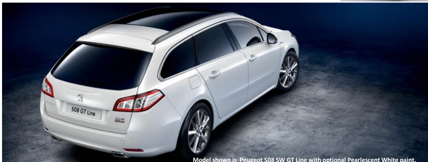
Model shown is Peugeot 508 SW GT Line with optional Pearlescent White paint.