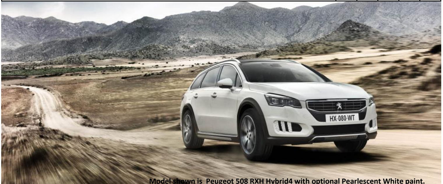
Model shown is Peugeot 508 RXH Hybrid4 with optional Pearlescent White paint.