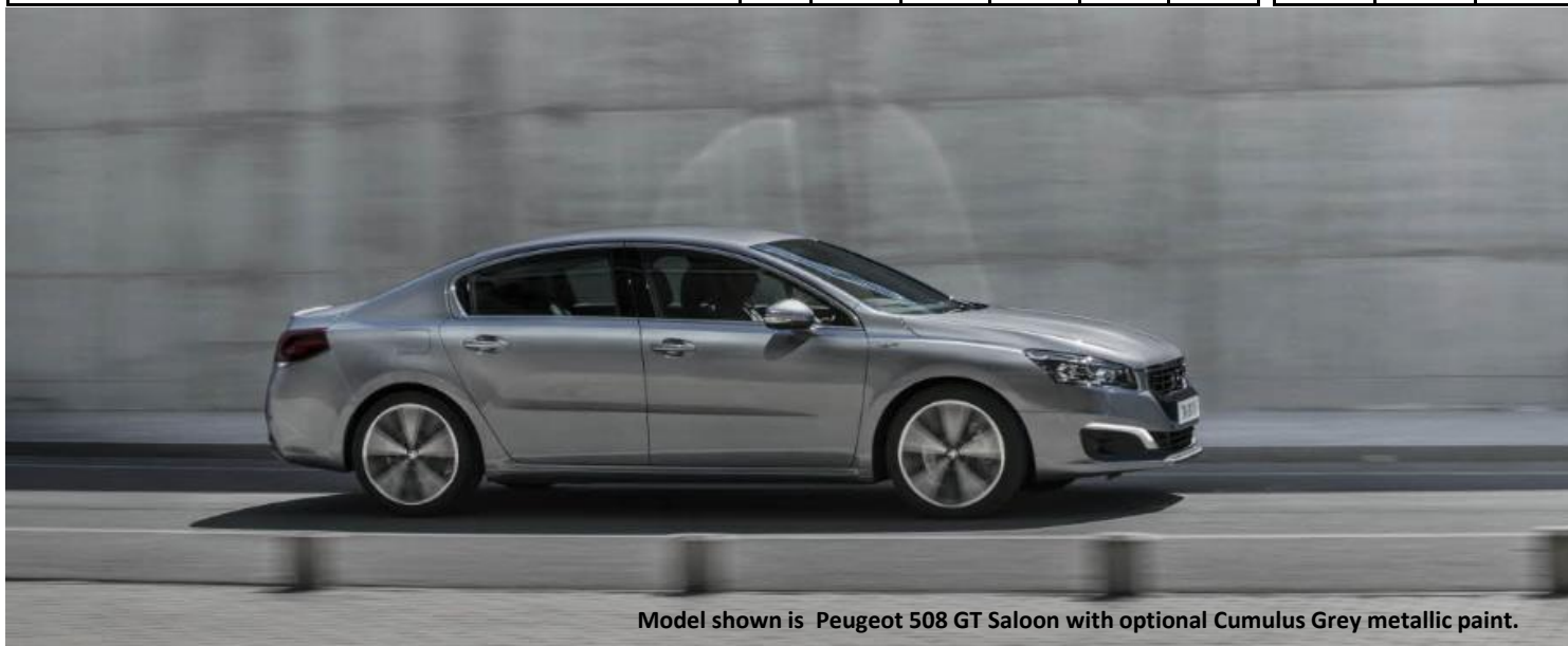
Model shown is Peugeot 508 GT Saloon with optional Cumulus Grey metallic paint.