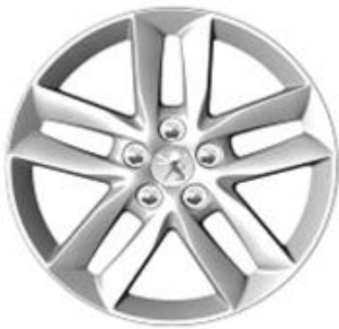
17" 'Rana' Alloy