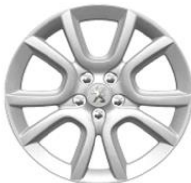
18" 'Naos' Alloy