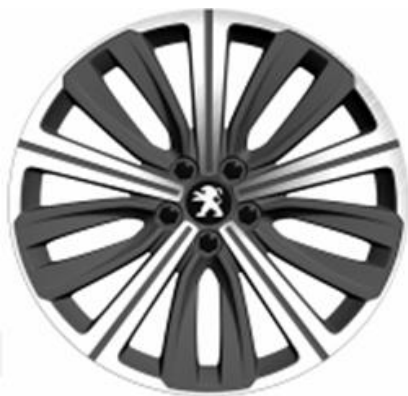
19" 'Capella' Alloy