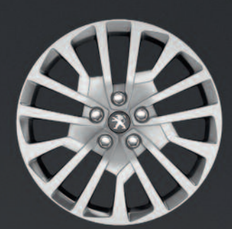
17 inch 'Miami' wheel trims