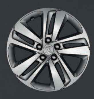
17 inch 'Phoenix' alloy wheels