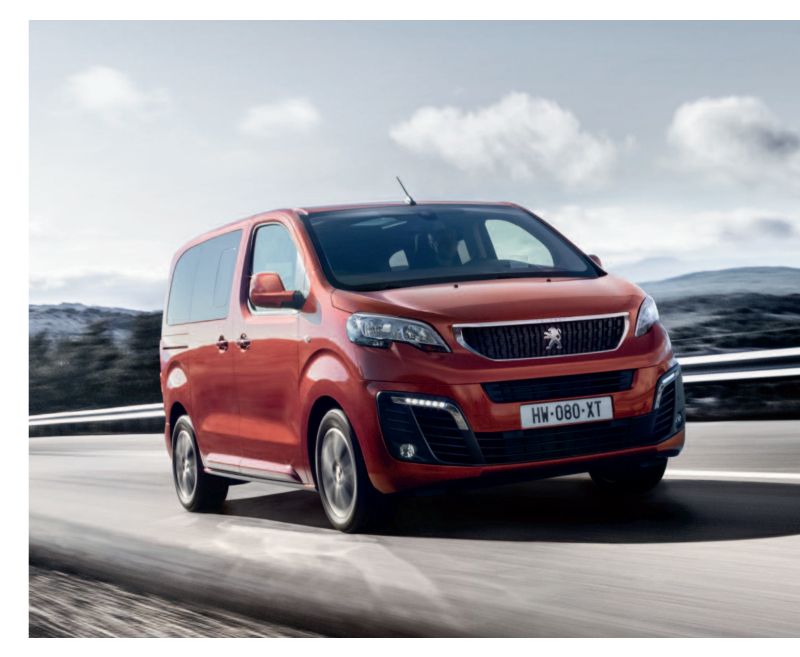
NEW PEUGEOT TRAVELLER