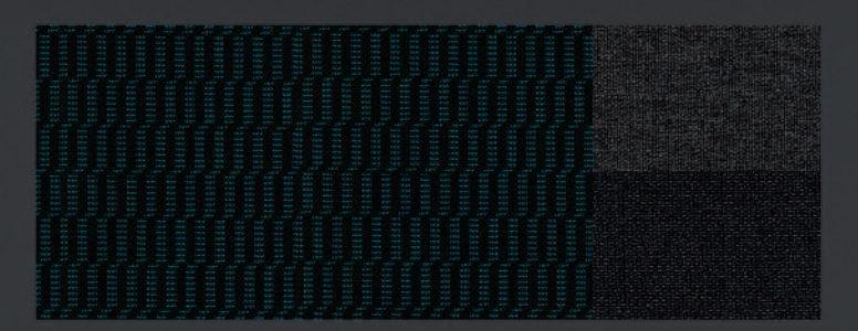
Grey and dark blue "Ocean" cloth trim, on Active Level