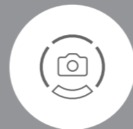
02. REAR-VIEW CAMERA