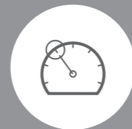
01. CRUISE & PARK PACK