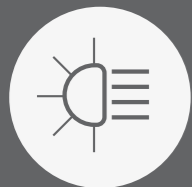
01. LIGHT & SIGHT PACK