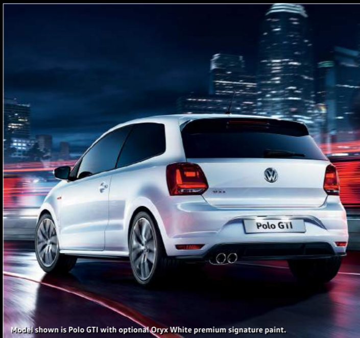
Model shown is Polo GTI with optional Oryx White premium signature paint.

XDS electronic differential lock for improved traction and handling