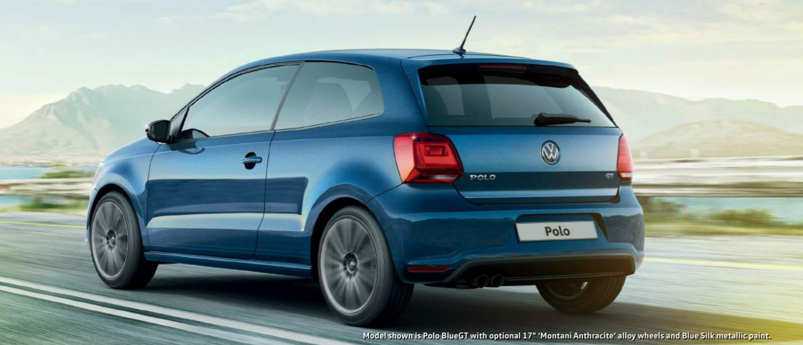
Model shown is Polo BlueGT with optional 17" 'Montani Anthracite' alloy wheels and Blue Silk metallic paint.