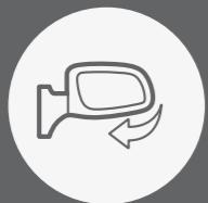
02. ELECTRICALLY FOLDABLE DOOR MIRRORS