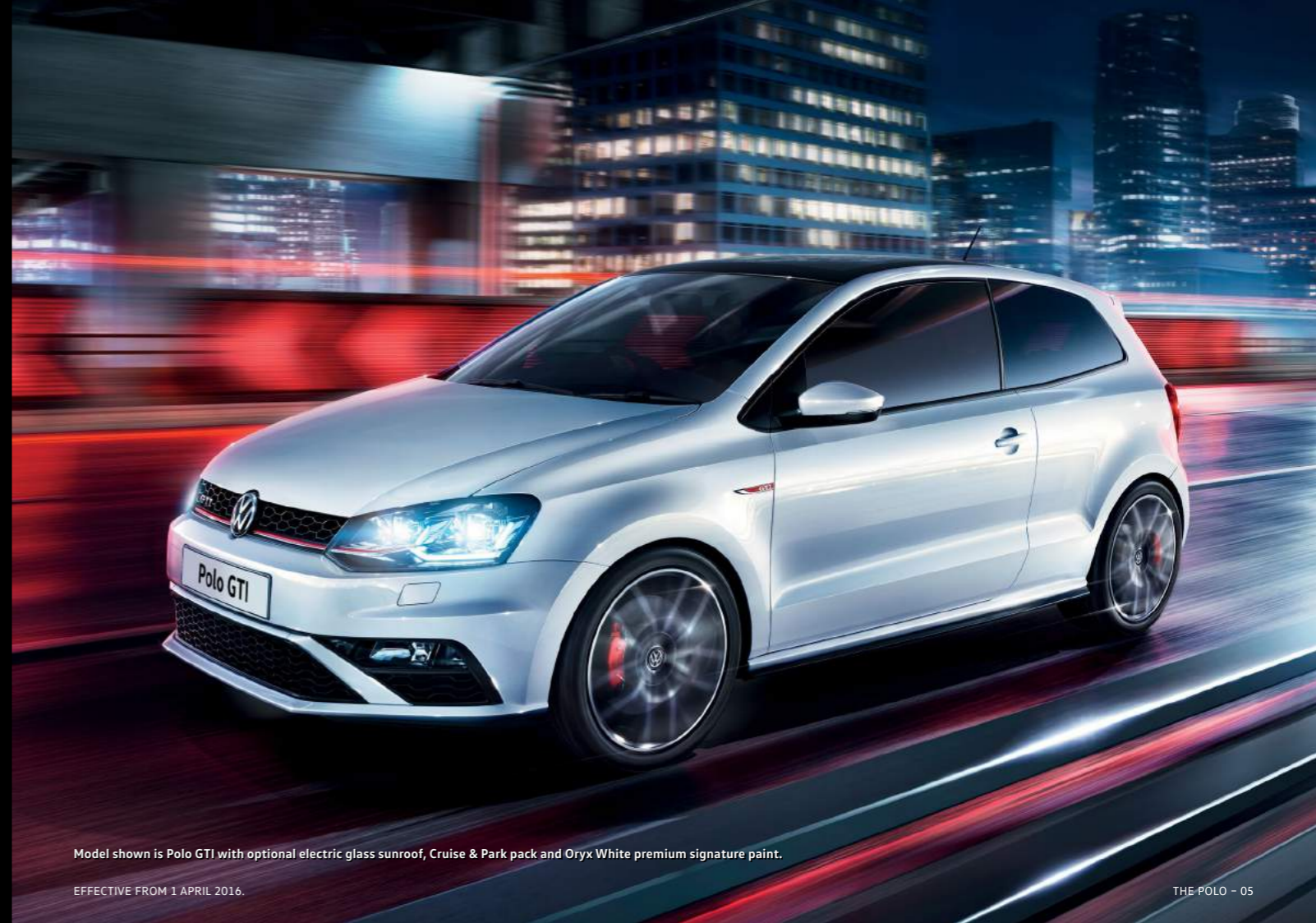
Model shown is Polo GTI with optional electric glass sunroof, Cruise & Park pack and Oryx White premium signature paint.

Exclusions and terms apply. For pricing and further details, please consult your authorised Volkswagen retailer or visit www.volkswagen.co.uk