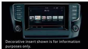
Decorative insert shown is for information purposes only.