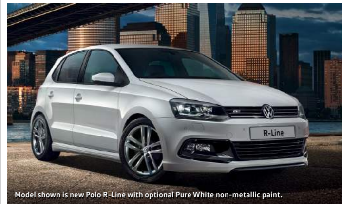
Model shown is new Polo R-Line with optional Pure White non-metallic paint.