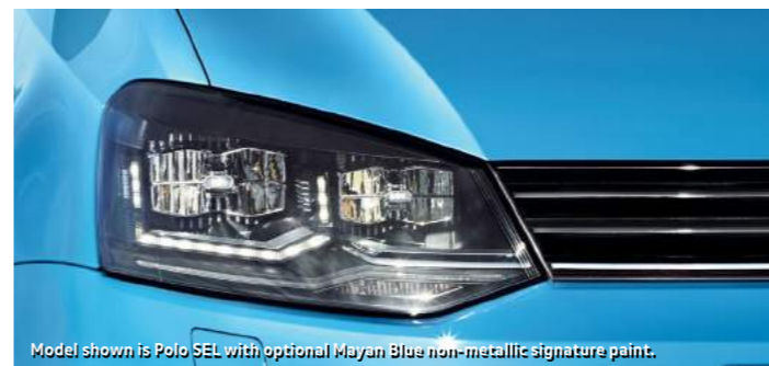
Model shown is Polo SEL with optional Mayan Blue non-metallic signature paint.

The specifications listed are for information purposes only as our products are continually updated and changes may be made to the specifications at any time. If you require any specific feature, please consult your authorised Volkswagen retailer who is regularly updated with any change in specification. Specifications are subject to change without notice. Model shown features optional Pure White non-metallic paint.