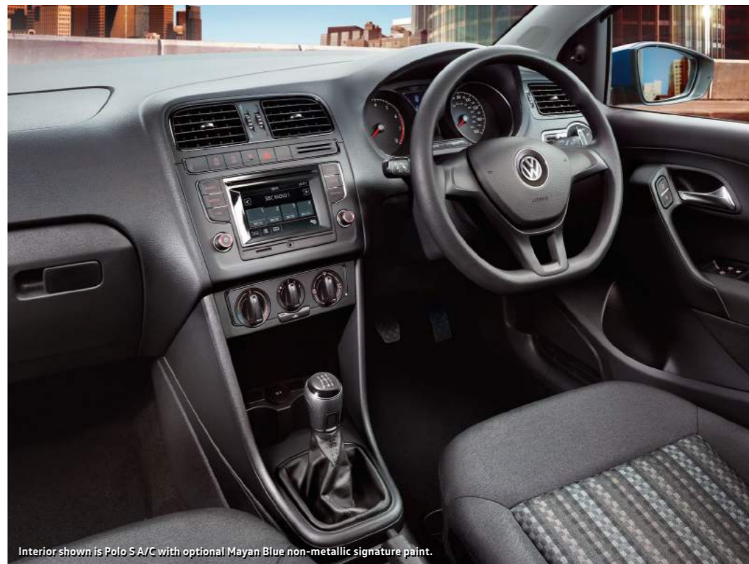
Interior shown is Polo S A/C with optional Mayan Blue non-metallic signature paint.