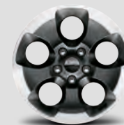
18" Alloy wheel Standard on Rubicon