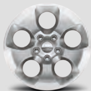
18" Alloy wheel Standard on Sahara