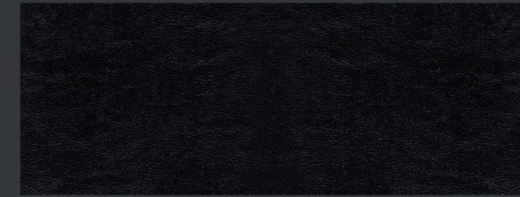
Not available in the UK