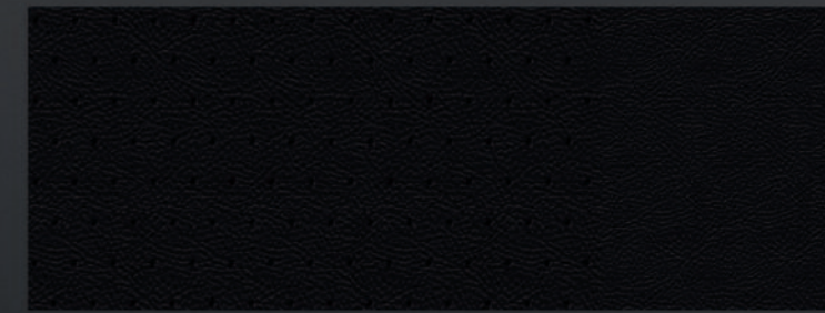
Black "Claudia" full leather