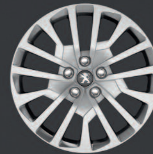
17 inch 'Miami' wheel trims