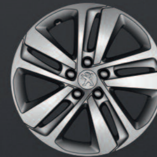
17 inch 'Phoenix' alloy wheels