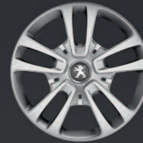
16 inch 'San Francisco' wheel trims