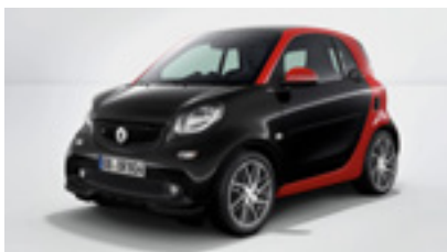
smart fortwo coupé