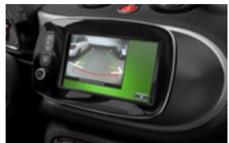
Rear view camera