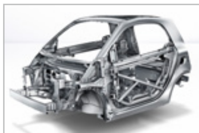
tridion safety cell