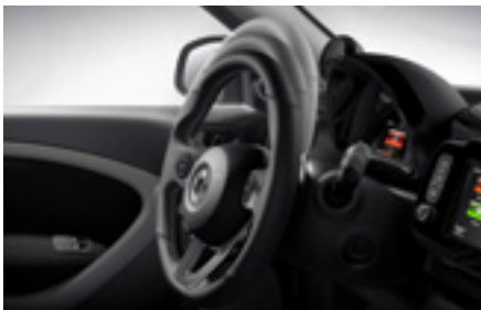
All contents of the Comfort package and BRABUS dashboard instrument with cockpit clock and rev counter with 'BRABUS' lettering