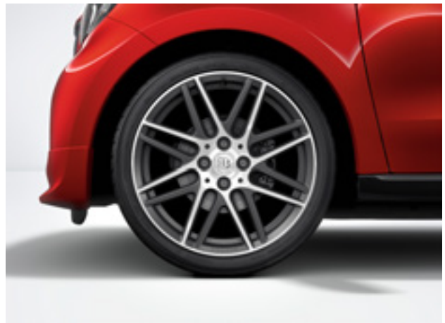
17-inch BRABUS Monoblock IX alloy wheels (R81) painted in matt grey with a high-sheen finish, with front tyres 185/45 R17, rear tyres 205/40 R17