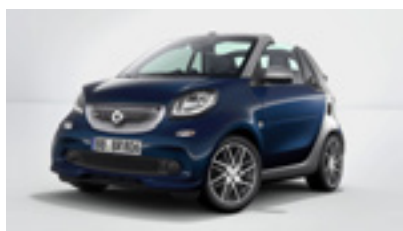
smart fortwo cabrio 1