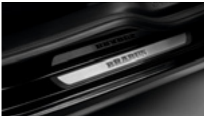
Door sill [A453 680 8904]