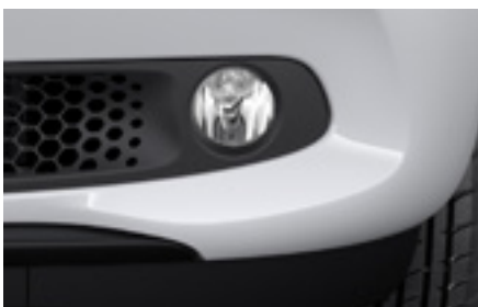
Fog lamps with cornering function