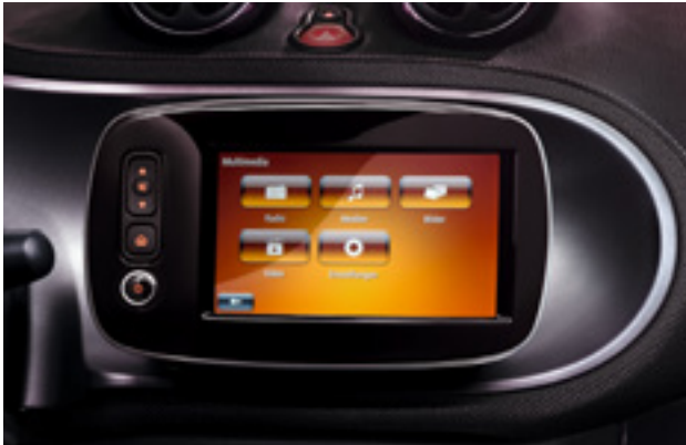
Digital radio 1 [C04]

Interior, functions and electrics, safety and assistance systems.