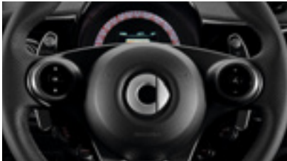
BRABUS gearshift paddles, matt black. Twinmatic only [A453 540 6512 9K34]