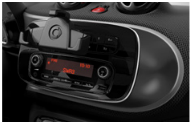
Smartphone cradle [C67]