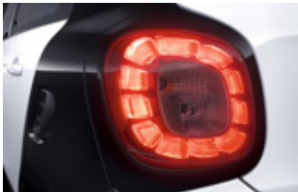
Headlamps with LED light guide and LED tail lights: H4 halogen headlamps with Welcome-Function and fibre optic daytime running lamps and tail lights in semi-LED technology as well as direction indicators integrated into the front bumper below headlamps; front fog lamps