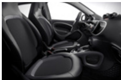
Dashboard and door centre panel in fabric