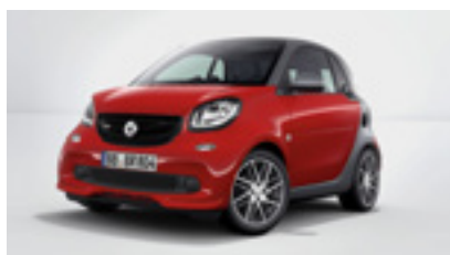
smart fortwo coupé