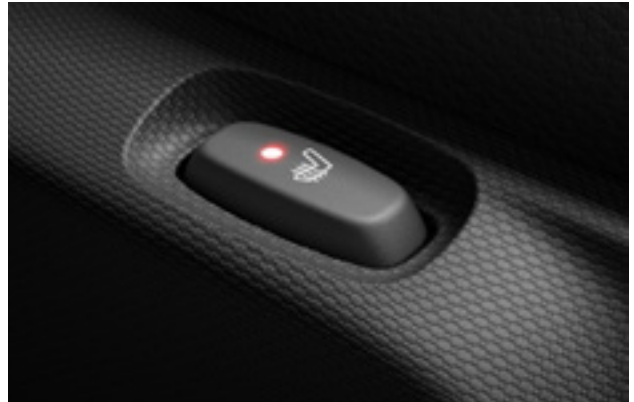
Heated seats [873]