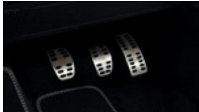
BRABUS pedals [A453 290 4300]