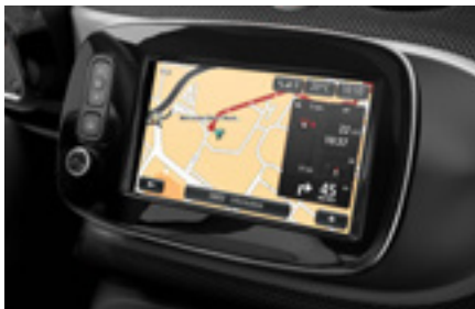
All contents of the Premium equipment line