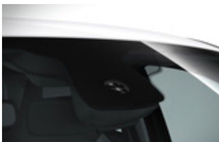
Rain/light sensor: rain sensor controls the windscreen wipers, adapting wipe intervals to amount of rainfall. The accompanying light sensor automatically activates driving lights