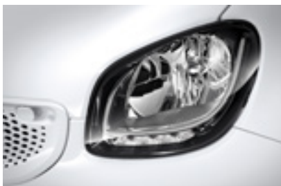
LED daytime running lamps