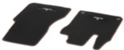
Velour mats, orange seams [A453 680 8104 3E40]