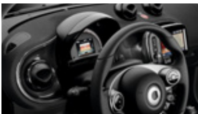
Interior trim parts in carbon fibre look, set of 2 [A453 680 9404]