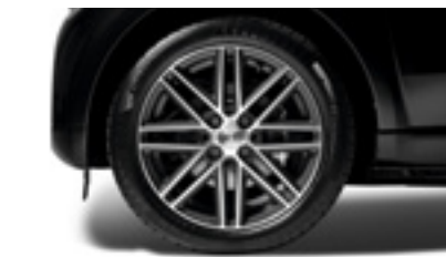
Monoblock 8 alloy wheel in high-sheen matt anthracite [A453 401 1001 C57B]