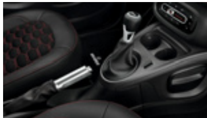
Hand-brake handle [A453 420 0800]