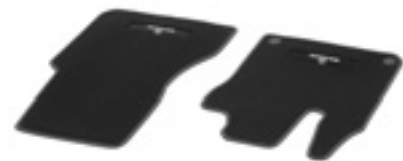
Velour mats, silver-coloured seams [A453 680 8104 1B55]