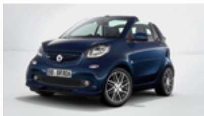
smart fortwo cabrio