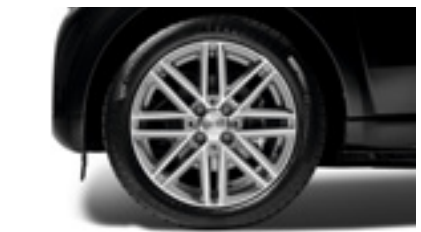
Monoblock 8 alloy wheel in high-sheen silver [A453 401 1001 C56B]