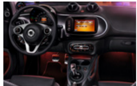
Ambient lighting: when driving at night, ambient lighting emphasises the stylish interior. Fibre optic cables in the door trim, centre console and footwell provide indirect, soft light