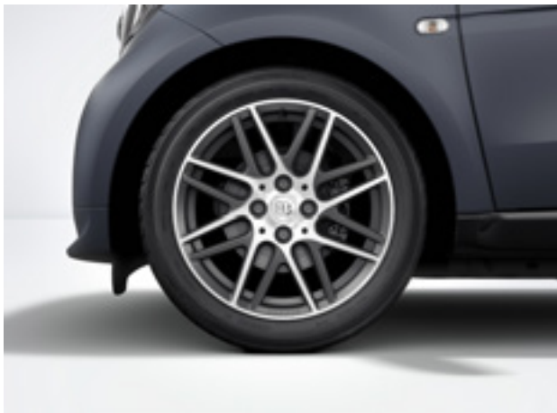
16/17-inch BRABUS Monoblock IX alloy wheels (R80) painted in matt grey with a high-sheen finish, with front tyres 185/50 R16, rear tyres 205/40 R17