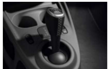
6-speed automatic transmission