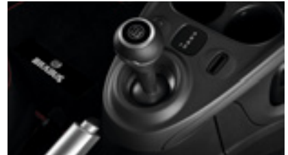
DCT gearshift lever [A453 277 0100]