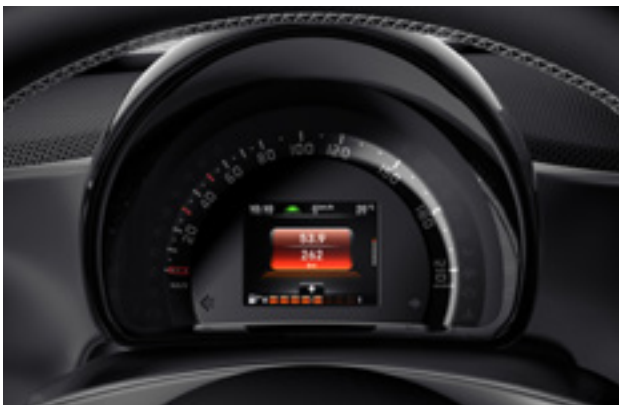
Lane Keeping Assist with acoustic and visual warning [238]