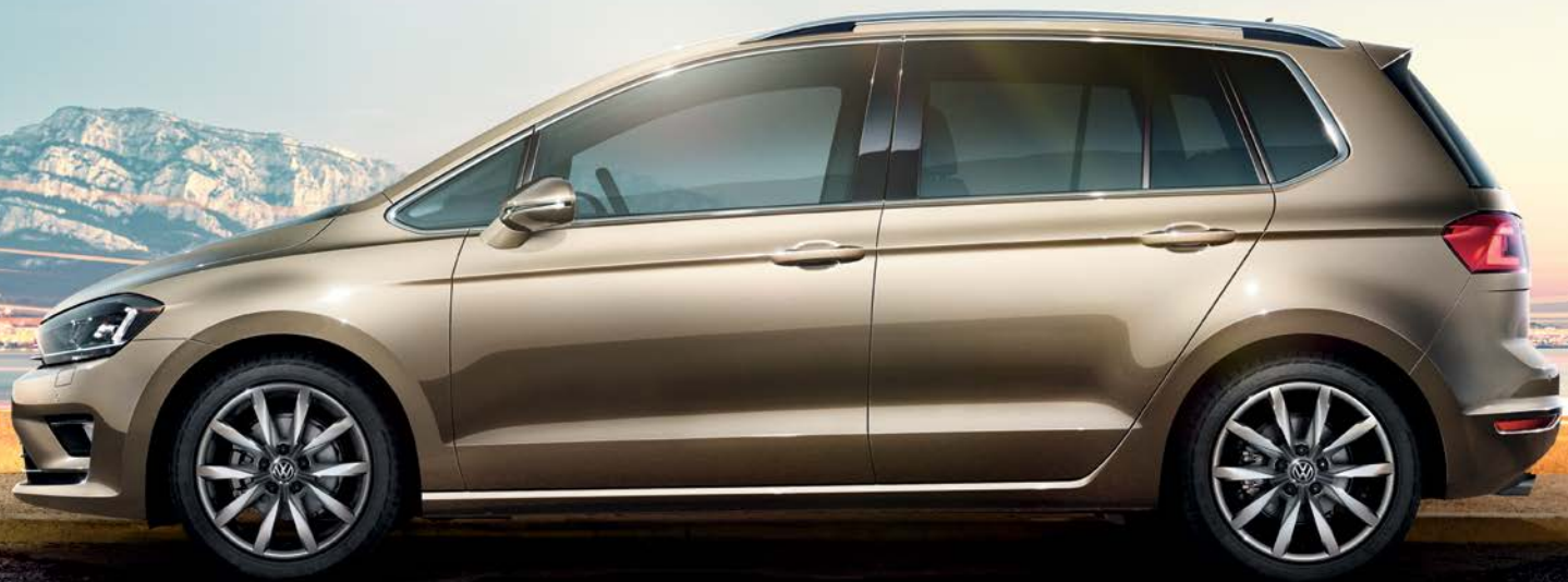
Model shown is Golf SV GT with optional Bi-xenon headlights and metallic paint.