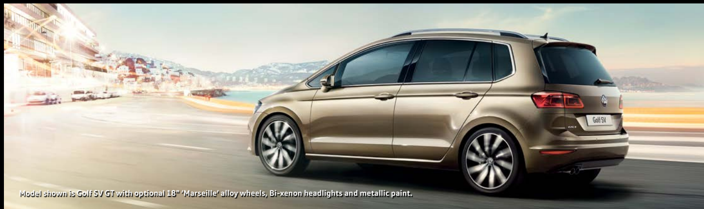
Model shown is Golf SV GT with optional 18" 'Marseille' alloy wheels, Bi-xenon headlights and metallic paint.