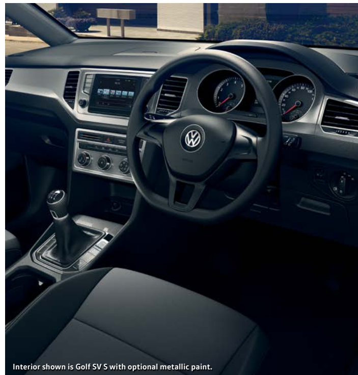
Interior shown is Golf SV 5 with optional metallic paint.

The specifications listed are for information purposes only as our products are continually updated and changes may be made to the specifications at any time. If you require any specific feature, please consult your authorised Volkswagen retailer who is regularly updated with any change in specification. Specifications are subject to change without notice.