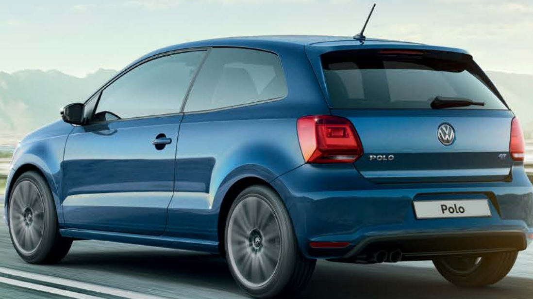
Model shown is Polo BlueGT with optional 17" 'Montani Anthracite' alloy wheels and Blue Silk metallic paint.