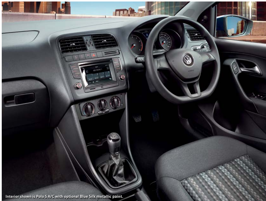
Interior shown is Polo S A/C with optional Blue Silk metallic paint.

* Please note 3-door models are only available from stock and are not available to factory order. The specifications listed are for information purposes only as our products are continually updated and changes may be made to the specifications at any time. If you require any specific feature, please consult your authorised Volkswagen retailer who is regularly updated with any change in specification. Specifications are subject to change without notice.