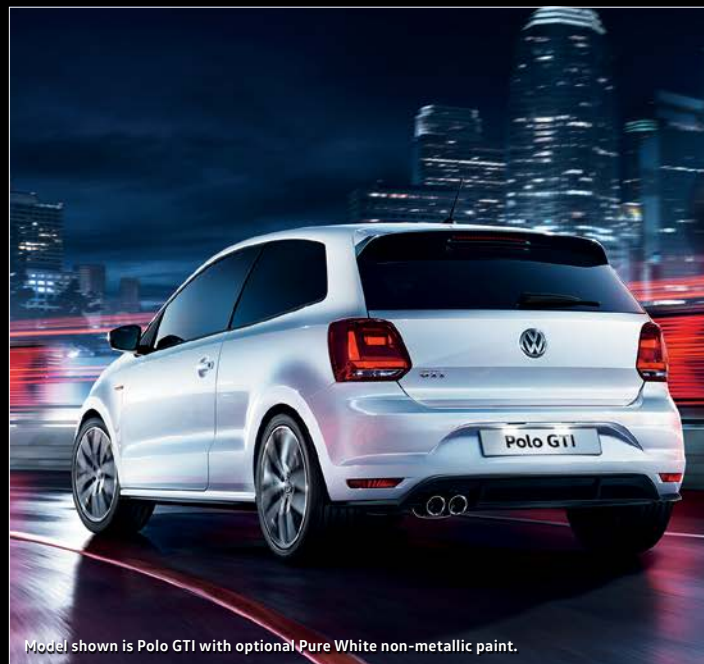
Model shown is Polo GTI with optional Pure White non-metallic paint.

* Please note these models are only available from stock and are not available to factory order.