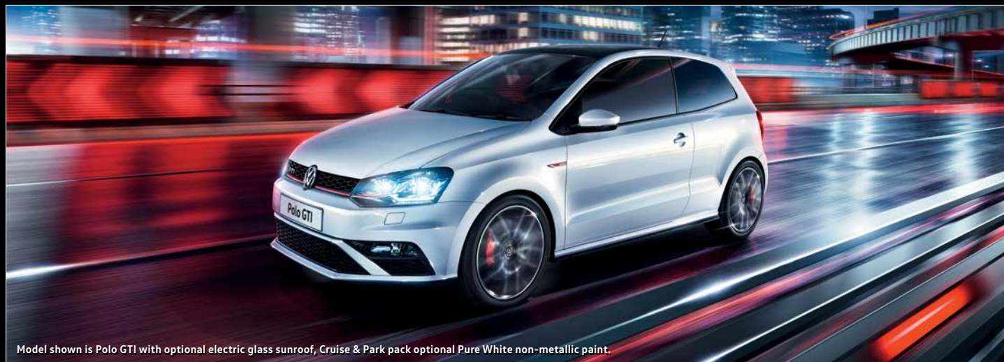
Model shown is Polo GTI with optional electric glass sunroof, Cruise & Park pack optional Pure White non-metallic paint.

* Fuel consumption and CO 2 emissions are standard EU test figures for comparative purposes, and may not reflect 'real world' driving results. For full details, please see Environmental Information on page 26. CO 2 emissions shown refer to standard specification only. † For full details of 'First year rate' VED (Vehicle Excise Duty), delivery to retailer, number plates and vehicle first registration fee included in the recommended 'On the road' retail price, please see page 26. ‡ Please note these models are only available from stock and are not available to factory order.