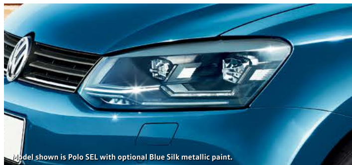
Model shown is Polo SEL with optional Blue Silk metallic paint.

* Please note 3-door models are only available from stock and are not available to factory order.