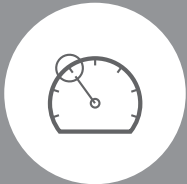
01. CRUISE & PARK PACK

Prices are the manufacturer's Recommended Retail Prices (RRP), inclusive of any discount if applicable and 20% VAT, and are charged in addition to recommended 'On the road' retail price paid for the vehicle.