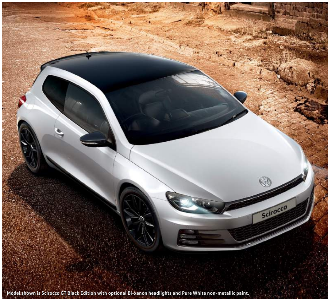
Model shown is Scirocco GT Black Edition with optional Bi-xenon headlights and Pure White non-metallic paint.