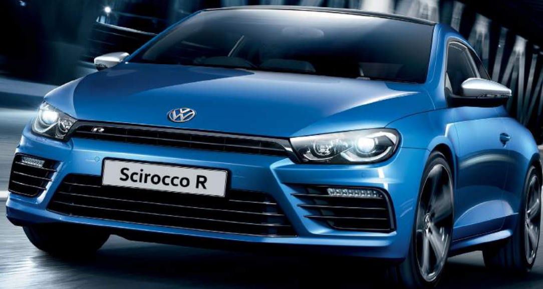
Model shown is Scirocco R with optional panoramic sunroof and metallic signature paint.