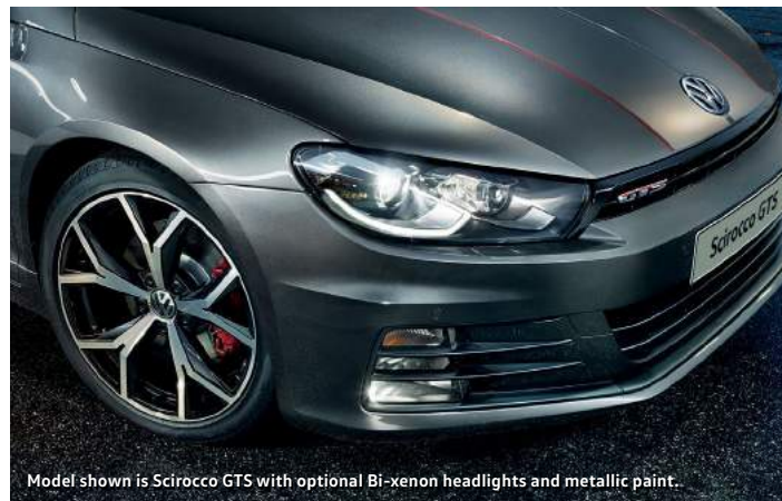
Model shown is Scirocco GTS with optional Bi-xenon headlights and metallic paint.