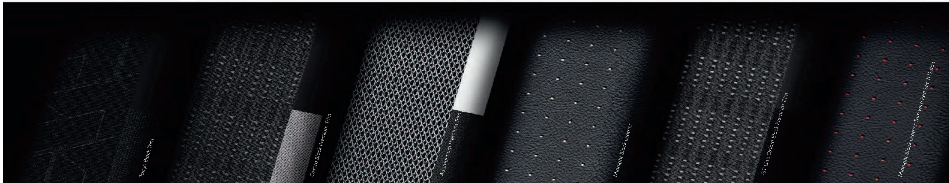
Tokyo Black Trim

Interior trims, standard or optional according to version / colour. Please refer to price and specification guide on peugeot.co.uk for full and up to date details.