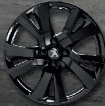
17" 'Eridan' Black Alloy Wheel

Alloy wheels, standard or optional according to version / engine. Please refer to price and specification guide on peugeot.co.uk for full and up to date details.