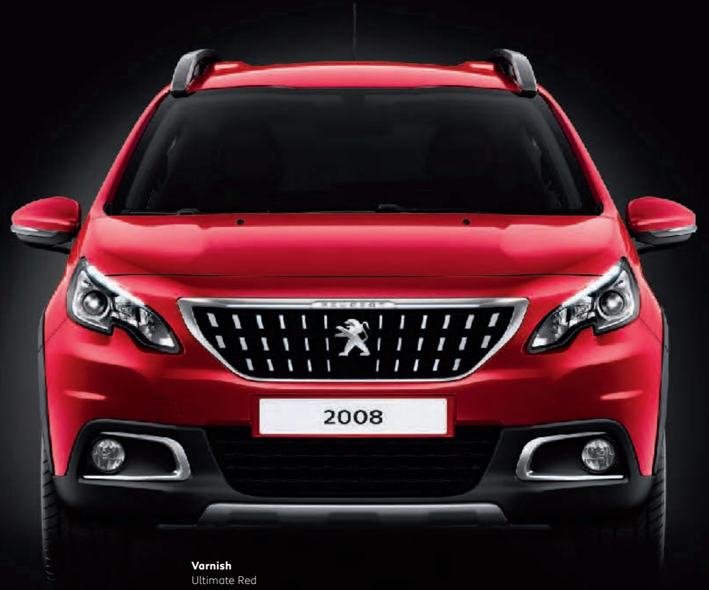
Varnish Ultimate Red

*Colours available according to version.