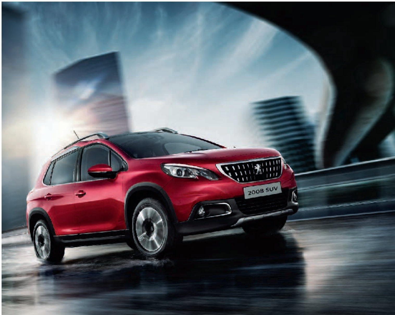
PEUGEOT 2008 SUV