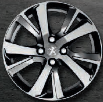
17" 'Eridan' Anthra Alloy Wheel