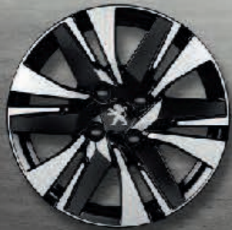
16" 'Aquila' Alloy Wheel