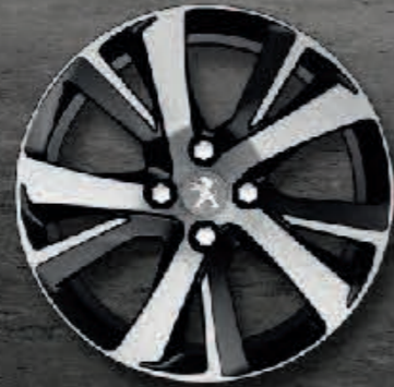
17" 'Eridan' Brilliant Black Alloy Wheel