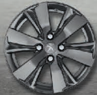
16" 'Hydre' Alloy Wheel