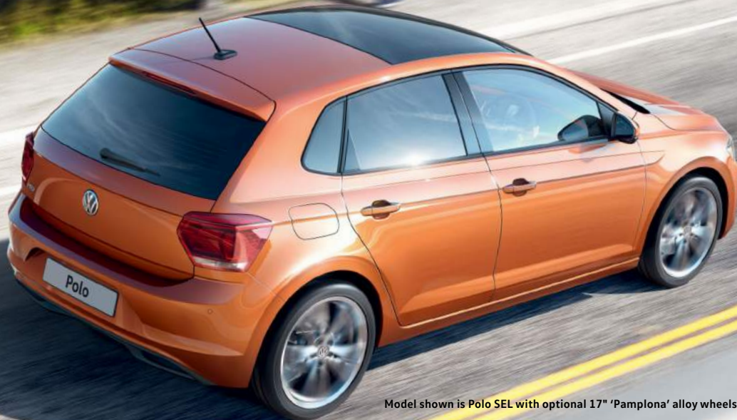
Model shown is Polo SEL with optional 17" 'Pamplona' alloy wheels, panoramic sunroof and metallic paint.