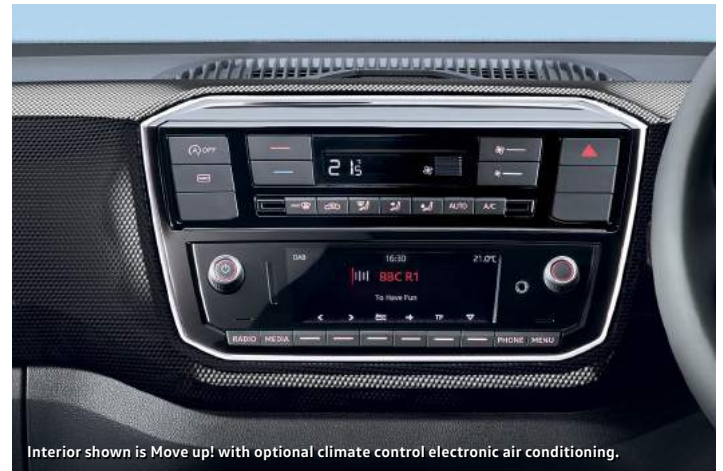
Interior shown is Move up! with optional climate control electronic air conditioning.