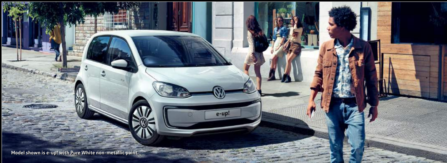
Model shown is e-up! with Pure White non-metallic paint.

6 The ABI insurance group is the recommended insurance rating set by the Association of British Insurers. Please note that insurance group ratings are purely advisory. They are used by insurers (ABI members and Lloyd's syndicates) as one of the factors in calculating premiums. Insurers are not required to follow the advisory group ratings and they may depart from them if they so wish.