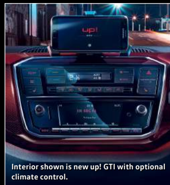
Interior shown is new up! GTI with optional climate control.

The specifications listed are for information purposes only as our products are continually updated and changes may be made to the specifications at any time. If you require any specific feature, please consult your authorised Volkswagen retailer who is regularly updated with any change in specification. Specifications are subject to change without notice. Models shown features optional Pure White non-metallic paint.