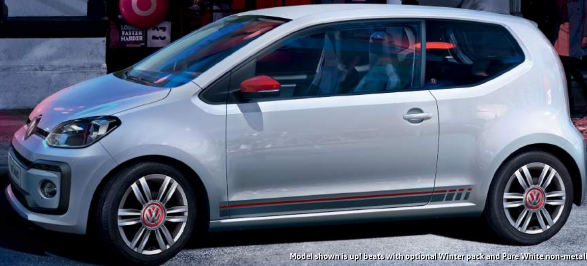
Model shown is up! beats with optional Winter pack and Pure White non-metallic paint.