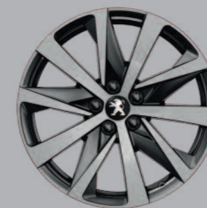
18" 'HIRONE' diamond-cut two tone with tinted varnish