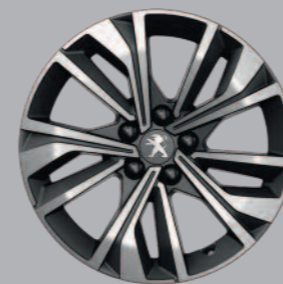
17" 'MERION' diamond-cut two tone