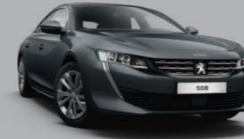
Hurricane Grey (1)