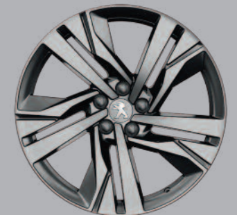
19" 'AUGUSTA' diamond-cut two tone