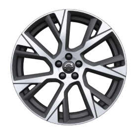
21" 7 Open Spoke (#800133)