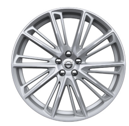
21" 10 Open Spoke Turbine (#800131)