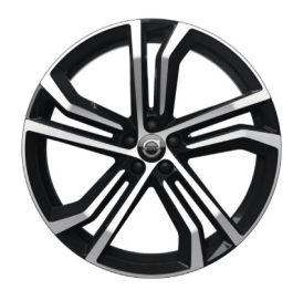
21" 5 Double Spoke (#1136)