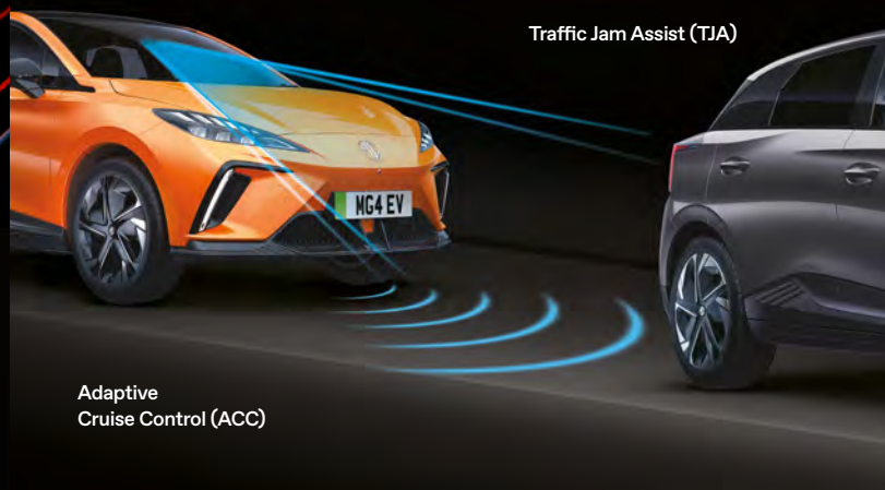
Traffic Jam Assist (TJA)

The MG Pilot suite of high-tech driver assistance technology gives you added confidence on the road. A selection of warning and alert features assists the driver, maintaining safety and simplifying everyday driving.