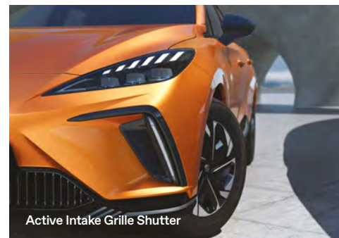
Active Intake Grille Shutter