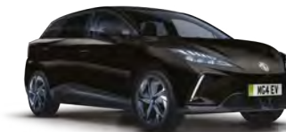
BLACK PEARL METALLIC*