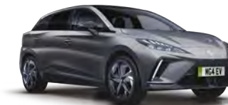
CAMDEN GREY METALLIC*