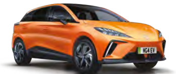
VOLCANO ORANGE PREMIUM**