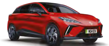
DYNAMIC RED TRI-COAT*

*Metallic, tri-coat and premium paint optional at extra cost. **Trophy Long Range only.