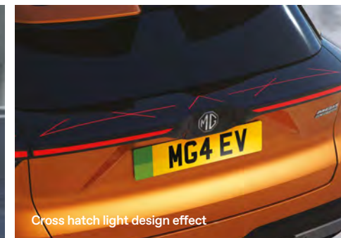
Cross hatch light design effect