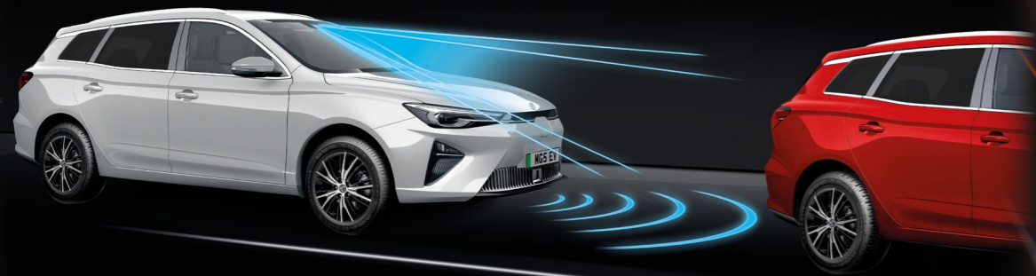
Adaptive Cruise Control (ACC)