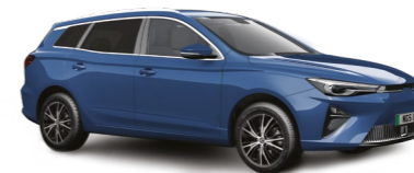
PICCADILLY BLUE METALLIC PAINT*