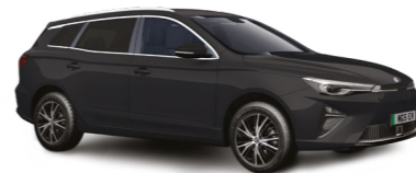
BLACK PEARL METALLIC PAINT*