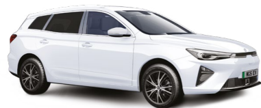
ARCTIC WHITE STANDARD PAINT