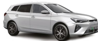
COSMIC SILVER METALLIC PAINT*