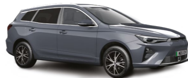
HAMPSTEAD GREY METALLIC PAINT*