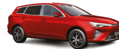
DYNAMIC RED TRI-COAT PAINT*

*Tri-coat and metallic paint optional at extra cost.