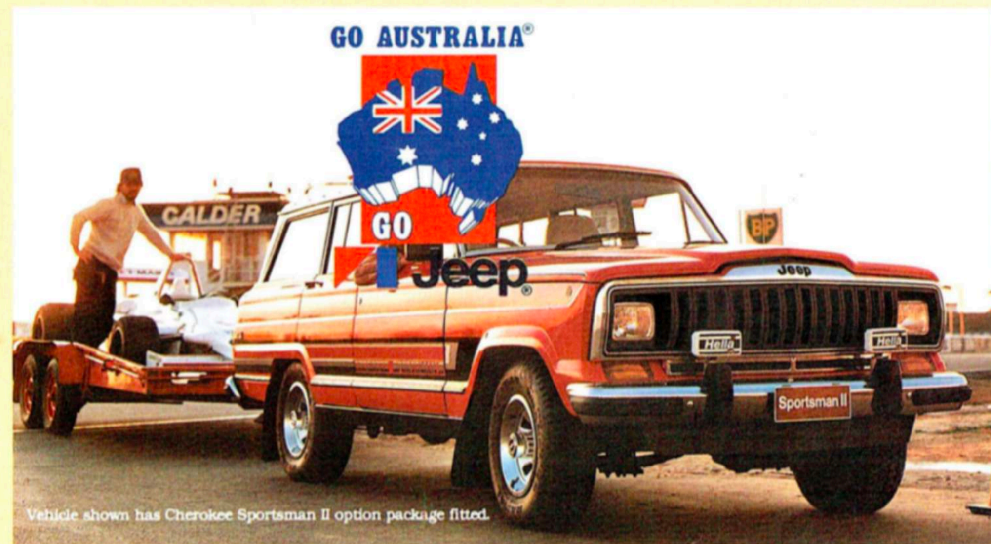
Vehicle shown has Cherokee Sportsman II option package fitted.

The Cherokee Sportsman II, it's a real eye-catcher!