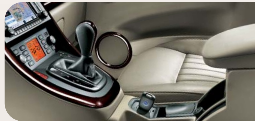
Centrally placed ergonomic console.

There is a choice of transmissions to precisely match your driving style. Petrol engines can be specified with 5-speed manual or a sequential automatic. Diesel engines get a 6-speed manual or sequential automatic, which is the sole choice on the powerful 2.4 20v MultiJet.