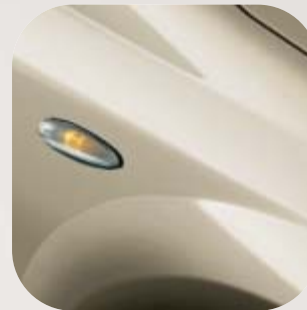
272 Spiritual Ivory Metallic