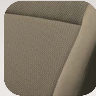
215 Beige Velour