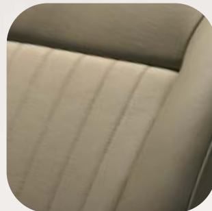
409 Beige Leather