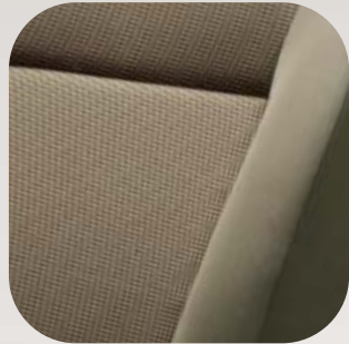
150 Beige Cloth