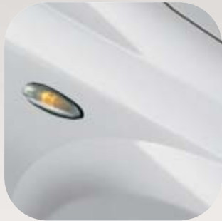
249 Ambient White Solid