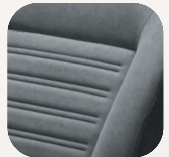
619 Dark Grey Castiglio™