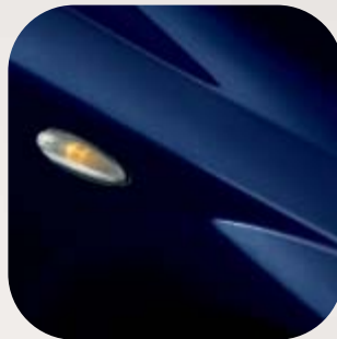
266 Jazz Blue Metallic