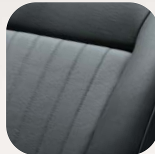
432 Dark Grey Leather