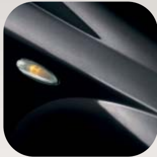
601 Darkwave Black Solid