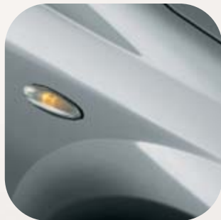
698 Lounge Grey Metallic