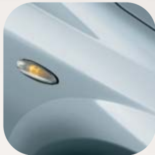
260 Dub Azure Metallic