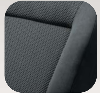
218 Dark Grey Velour