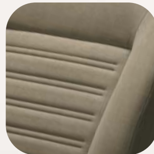
618 Beige Castiglio™