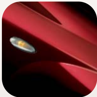
293 Flamenco Red Metallic