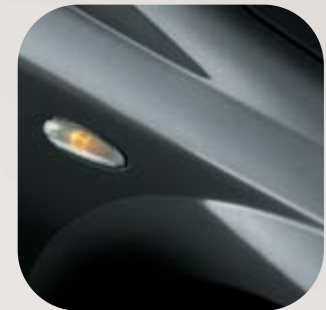
284 Techno Grey Metallic