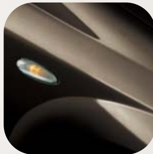
742 Chillout Brown Metallic