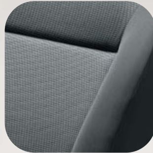
156 Dark Grey Cloth