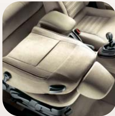
Fold-down front passenger seat.