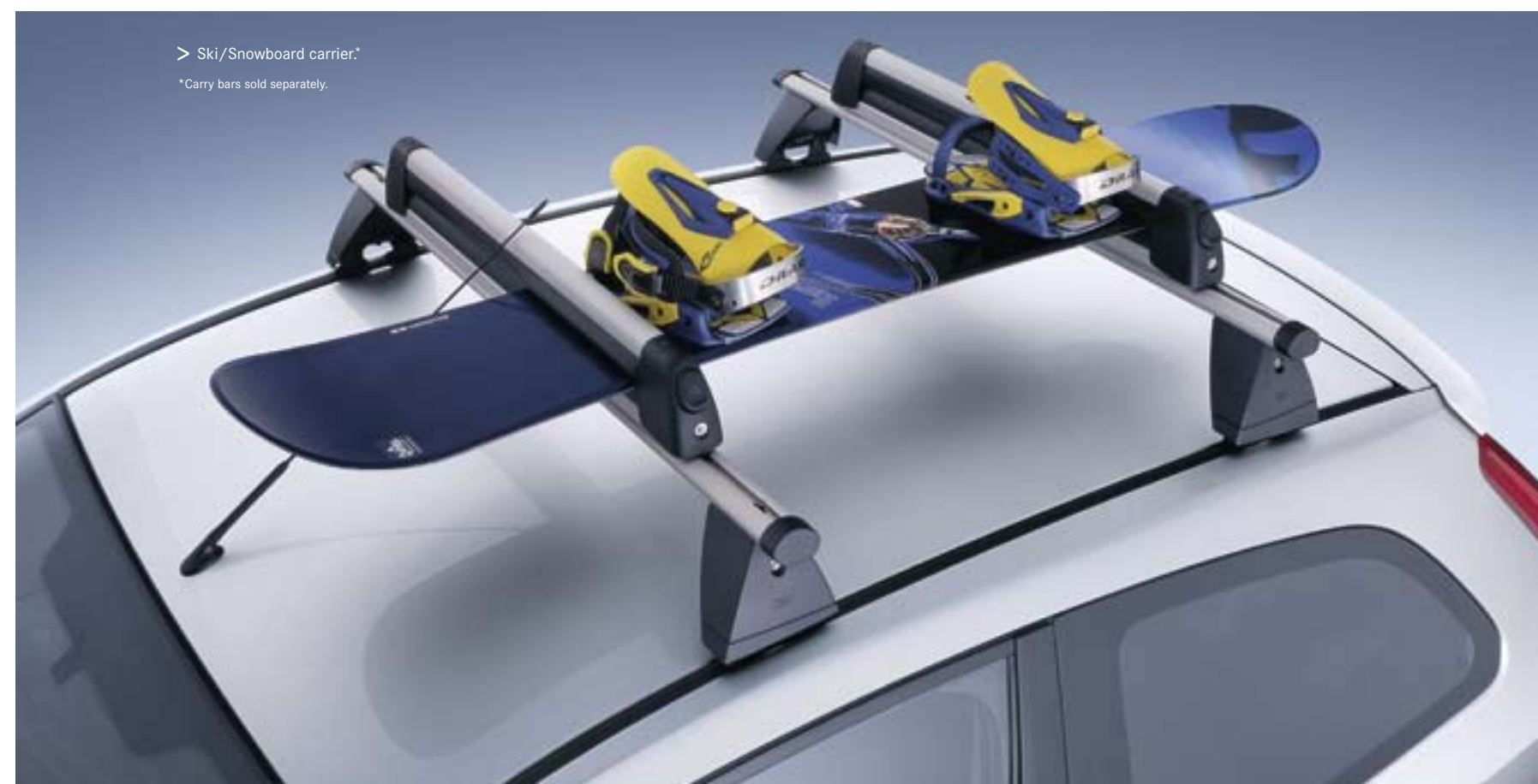
> Ski/Snowboard carrier.*