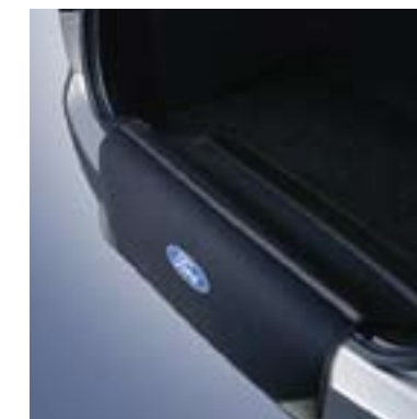
> Boot Scuff Guard. Designed to help protect your Fiesta's rear bumper and boot lip from scratches and scuffs when loading and unloading. Folds away neatly when not in use.