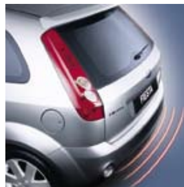
> Reverse Sensing System. The reverse sensing system uses warning tones to help make reversing and parking easier.