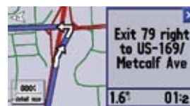
Full Map With Directional Prompts