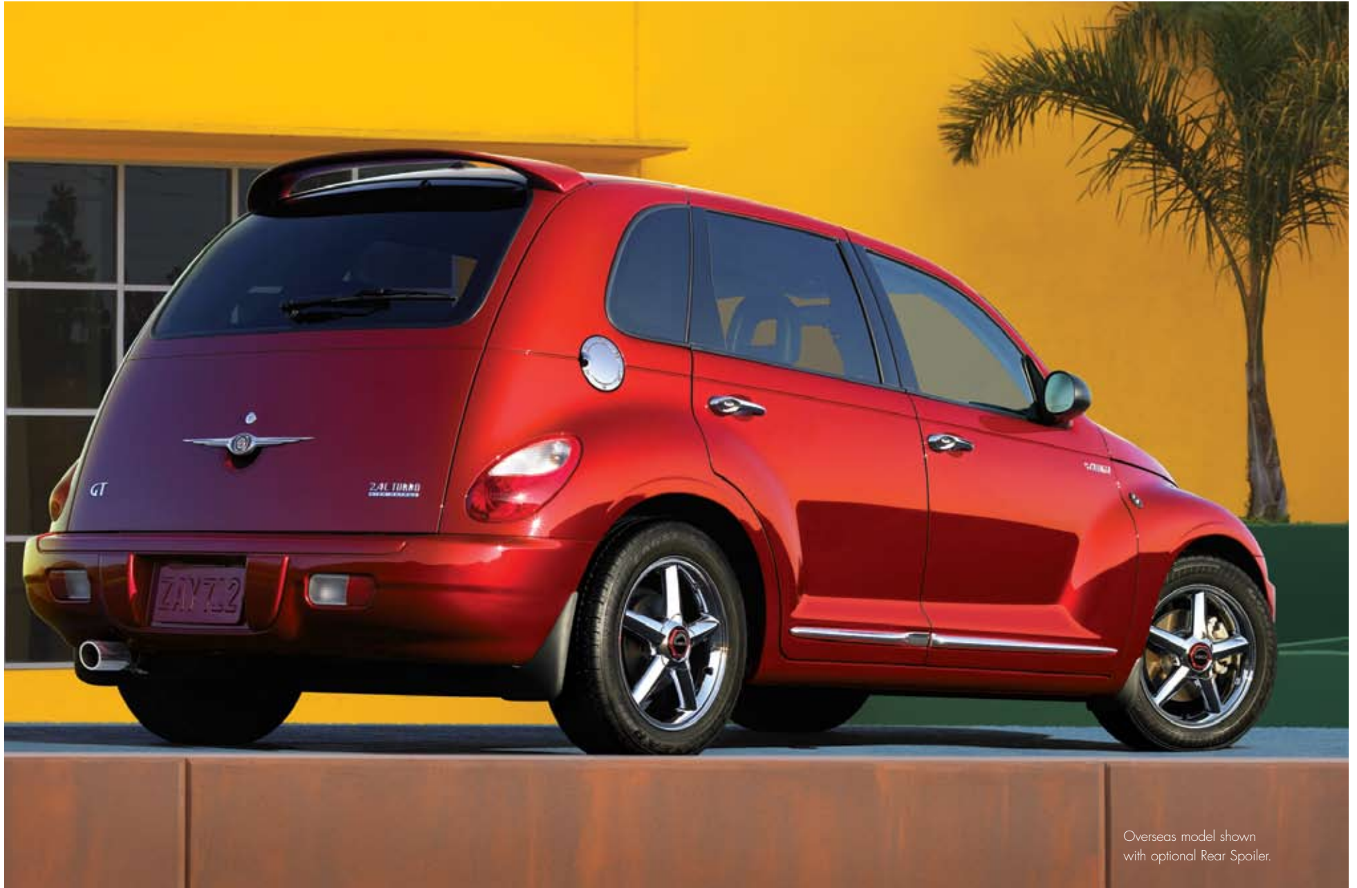
Overseas model shown with optional Rear Spoiler.