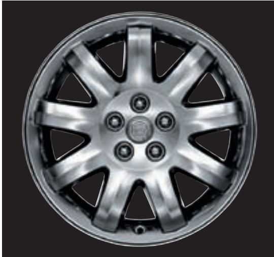
A 16-inch Chrome-Clad Wheel