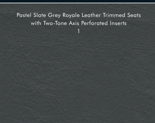
Pastel Slate Grey Royale Leather Trimmed Seats with Two-Tone Axis Perforated Inserts 1