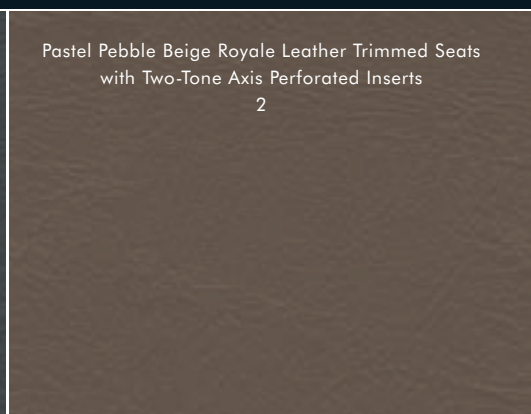
Pastel Pebble Beige Royale Leather Trimmed Seats with Two-Tone Axis Perforated Inserts 2