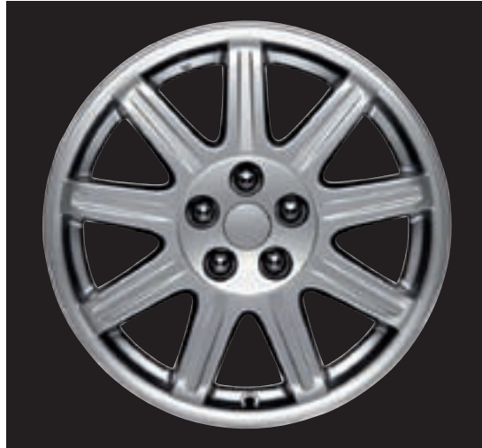
B 16-inch Silver-Painted Cast-Aluminium Wheel