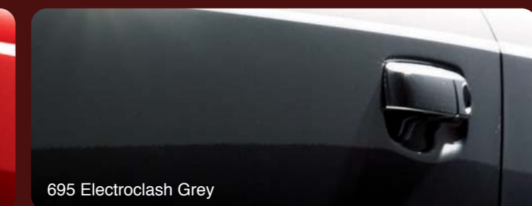
695 Electroclash Grey