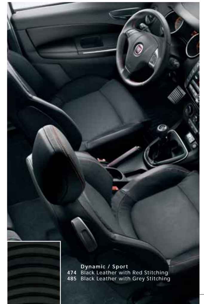
Dynamic / Sport 474 Black Leather with Red Stitching 485 Black Leather with Grey Stitching