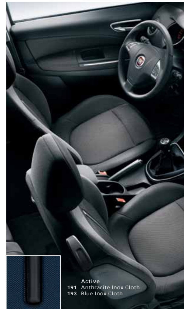
Active 191 Anthracite Inox Cloth 193 Blue Inox Cloth