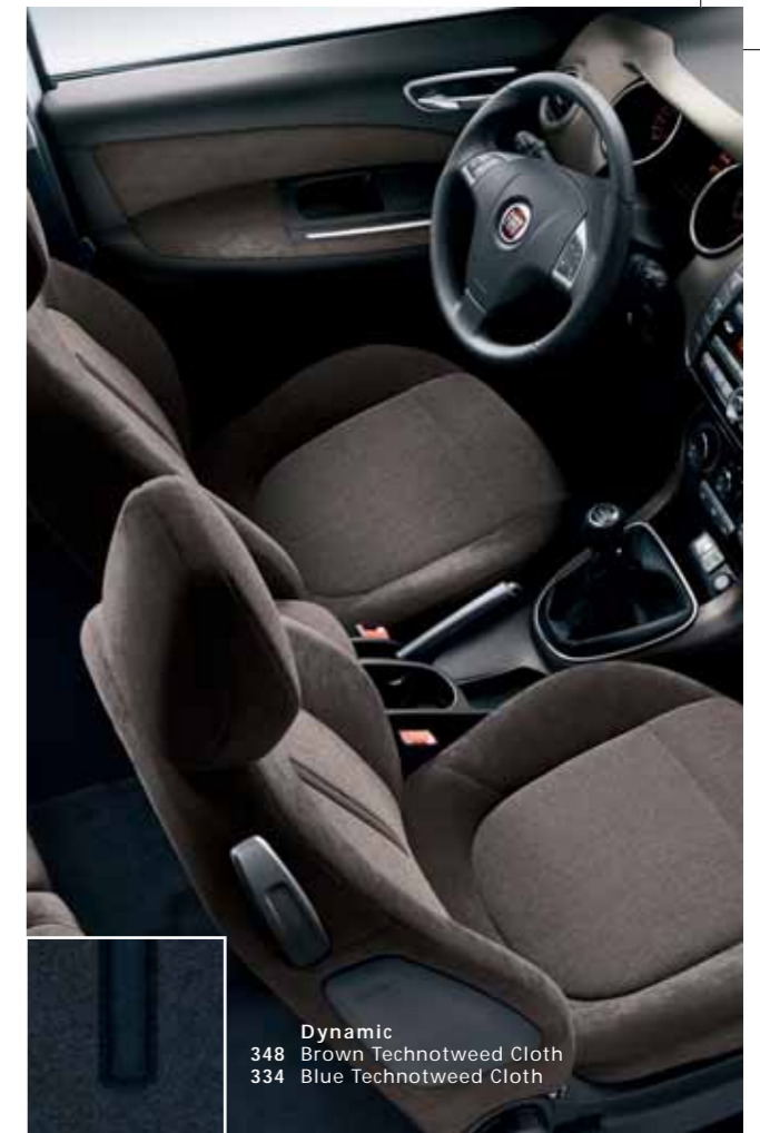
Dynamic 348 Brown Technotweed Cloth 334 Blue Technotweed Cloth