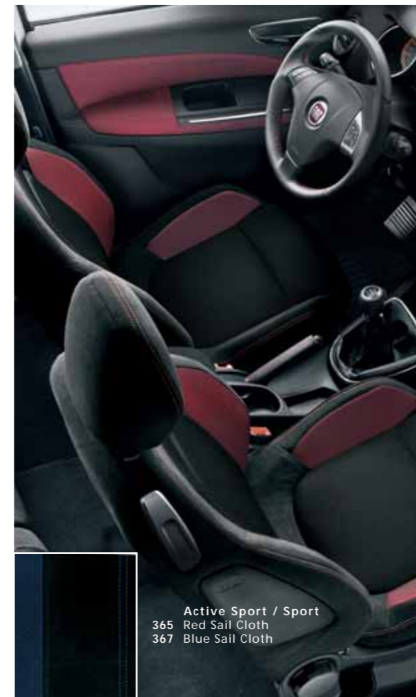
Active Sport / Sport 365 Red Sail Cloth 367 Blue Sail Cloth