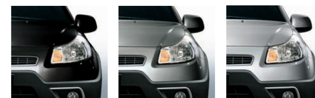
975 Hard Rock Black 976 West Coast Grey 977 Techstep Grey