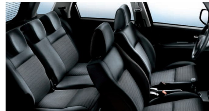
121 Striped Grey Cloth