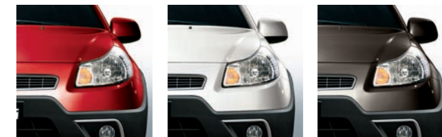
982 Space Rock Red 983 Castlewalk White 865 Epic Grey

Tough on the outside and tough on the inside, the Sedici is thoroughly equipped with an extensive range of safety features to protect you and your family. Seat belt pretensioners, ABS with EBD, Isofix child seat anchors on rear seats and multiple airbags as standard, ensure that Sedici delivers peak protection.