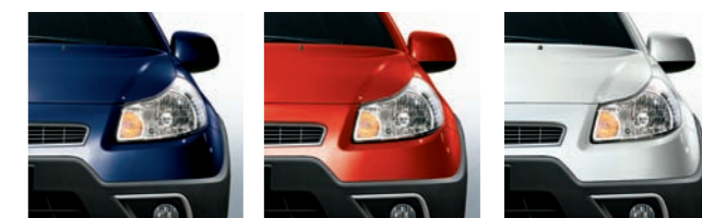
979 Stomp Blue 985 Bambuco Red 211 White Water Pearl