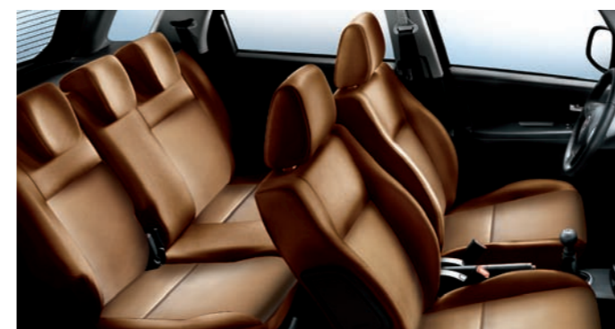
495 Brown Leather