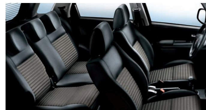
150 Perforated Brown Cloth