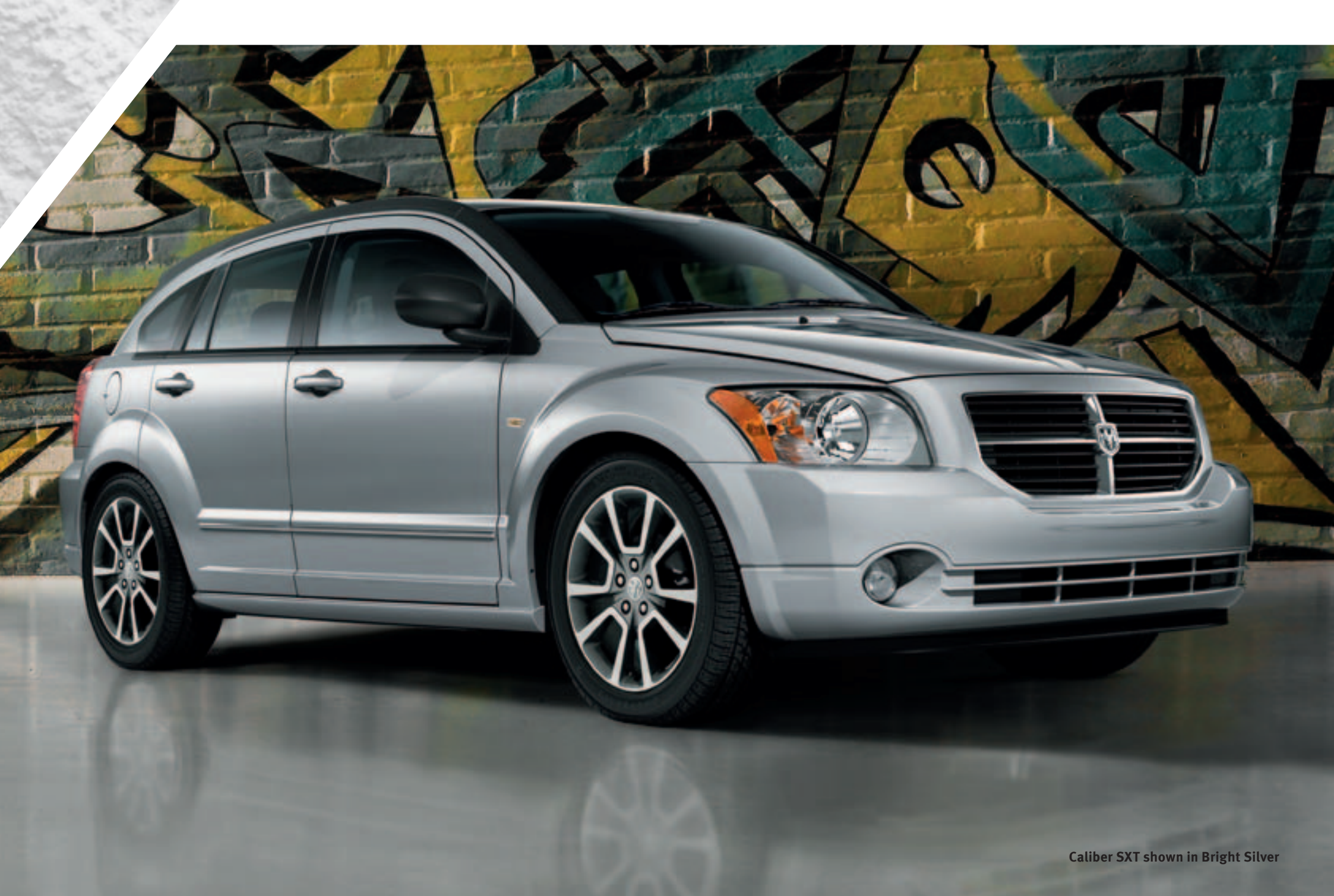
Caliber SXT shown in Bright Silver