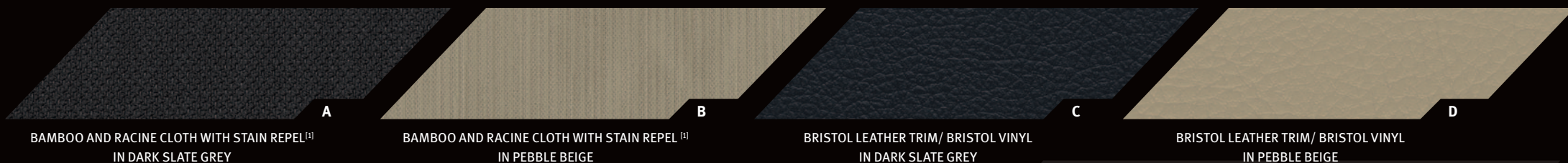
BAMBOO AND RACINE CLOTH WITH STAIN REPEL [1] IN DARK SLATE GREY