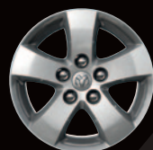
17-inch alloy wheels