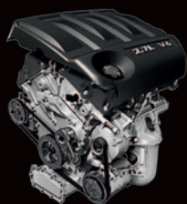
2.7L V6 Petrol