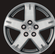
19-inch machined alloy wheels

Note: Due to the printing process, the colours shown may vary slightly from actual hues.