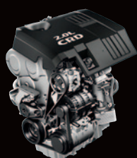
2.0L CRD Turbo Diesel