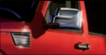
CHROME MIRROR COVERS