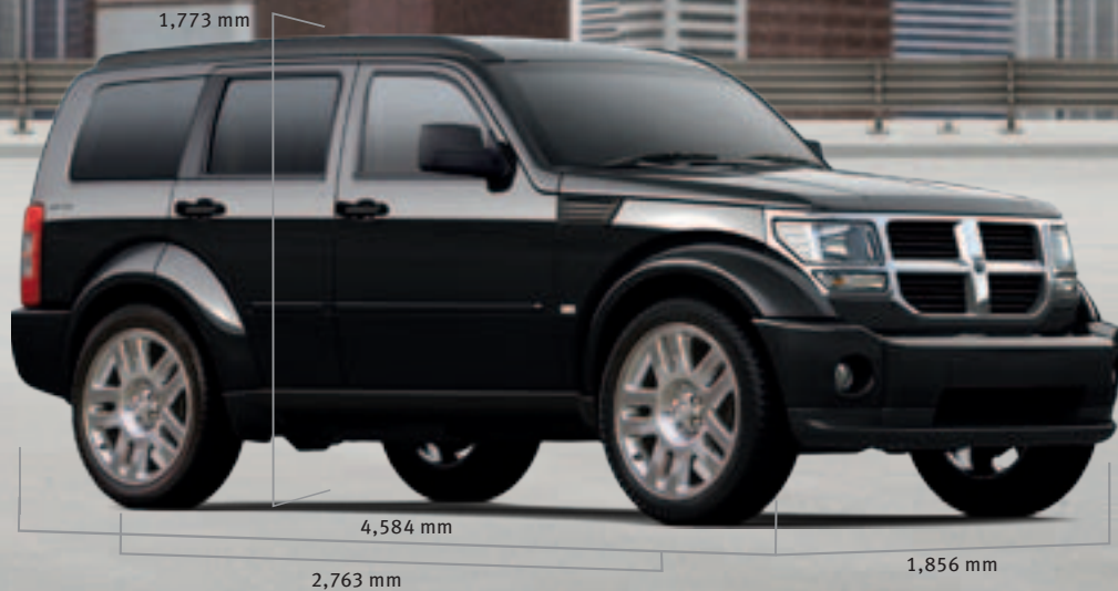
NITRO SX IN BRILLIANT BLACK