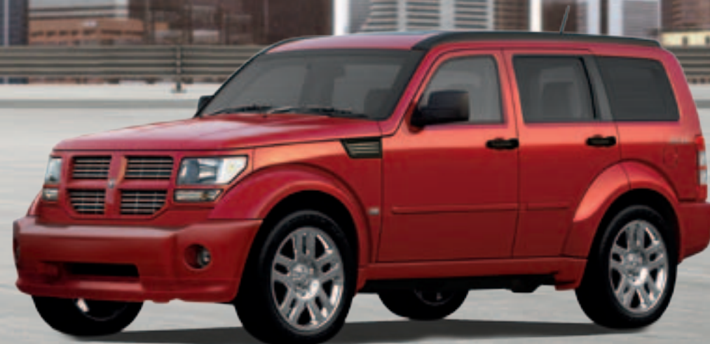
NITRO SXT IN INFERNO RED