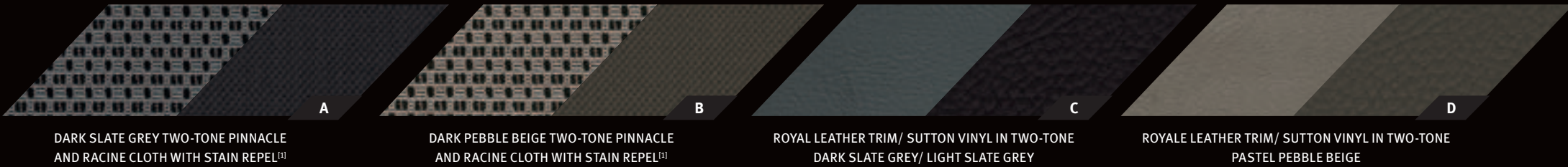
A DARK SLATE GREY TWO-TONE PINNACLE AND RACINE CLOTH WITH STAIN REPEL [1]