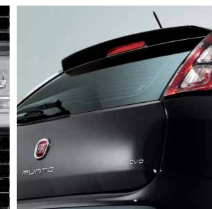
■ Rear spoiler.