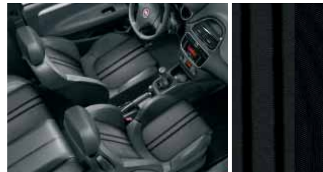
Black leather 408/471/472/473