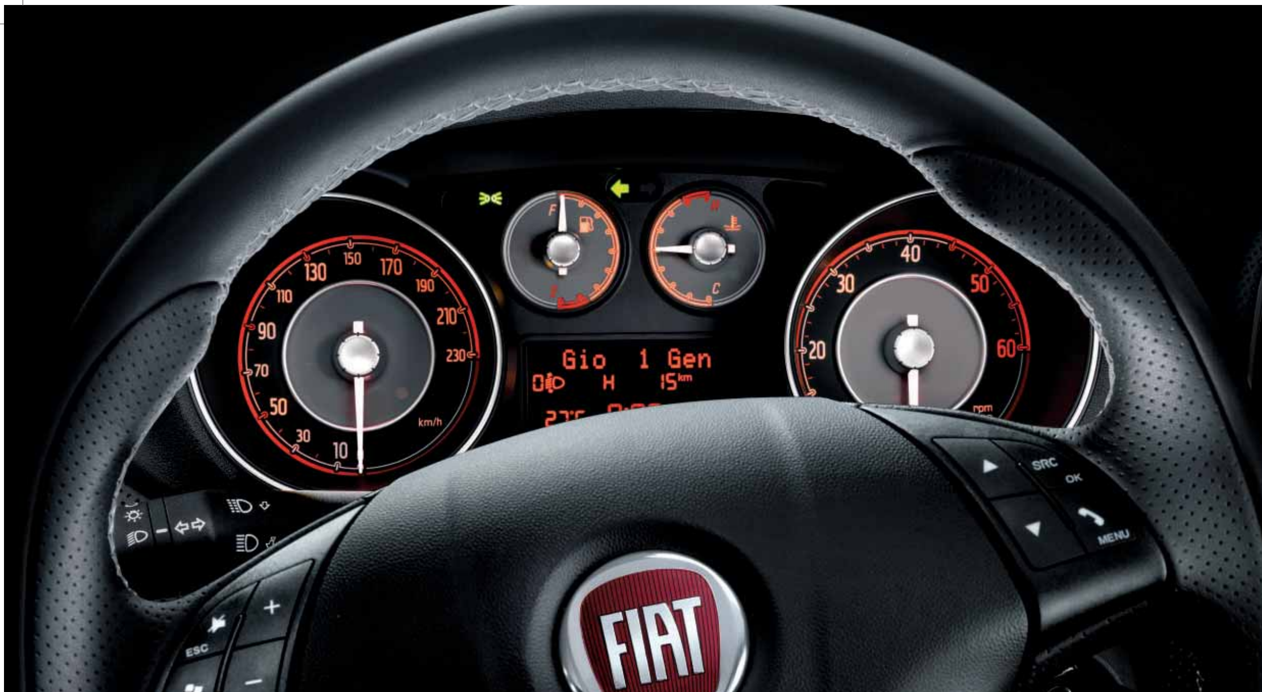
■ New instrument panel for the Sport Line.