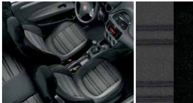
Grey Dynamic 260