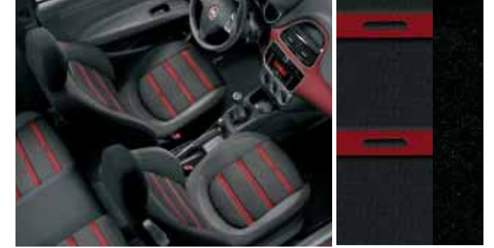
Red/Black GP 527