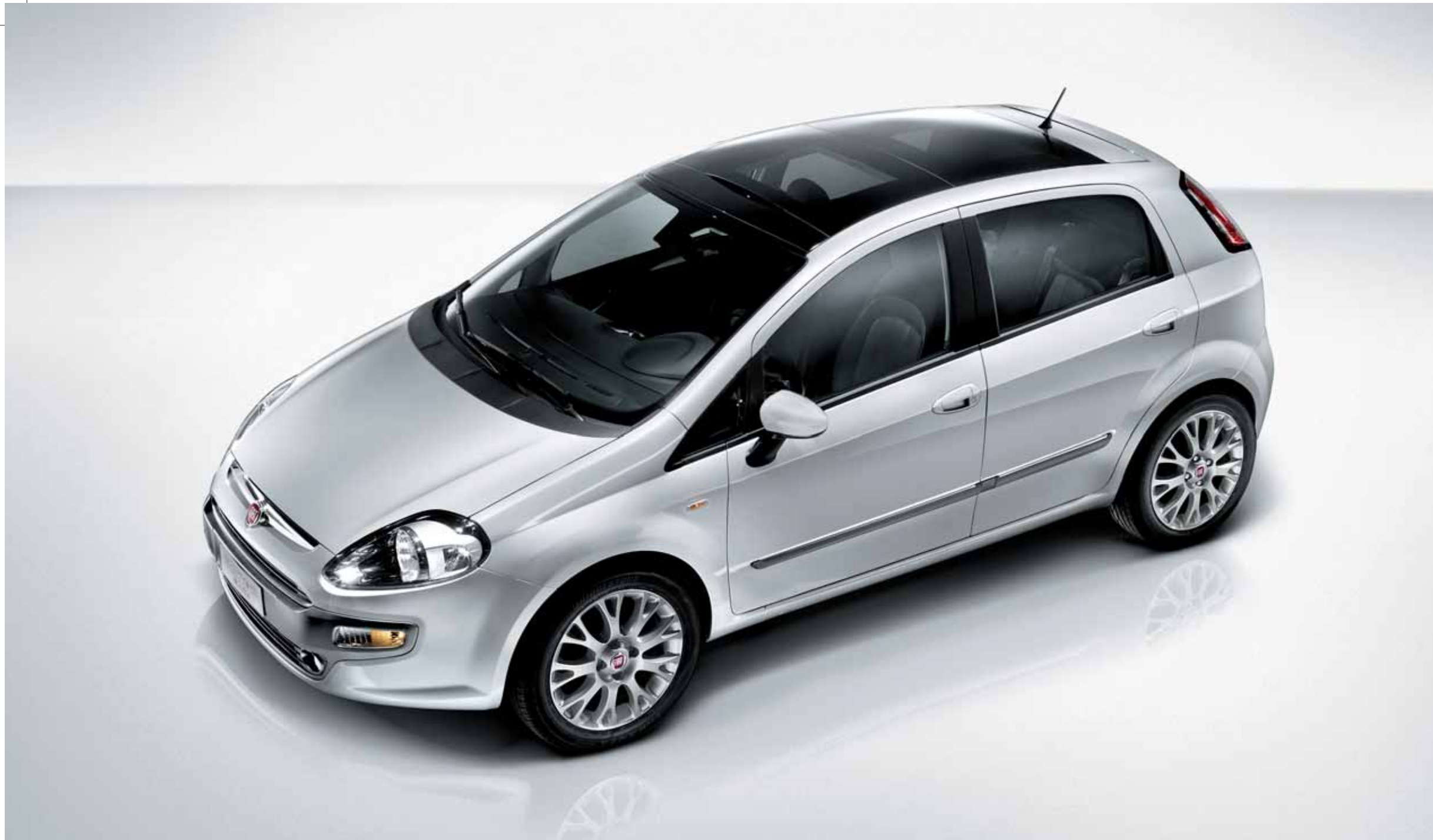
■ Optional metallic finish front bumper insert in Carbon Metal.