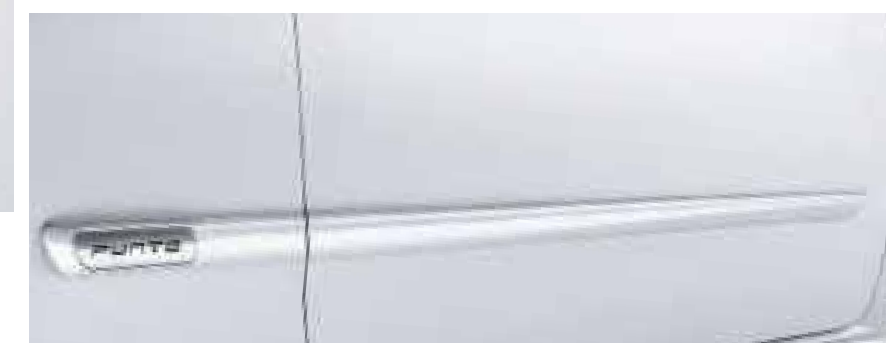
■ Optional body coloured protective side moulding.