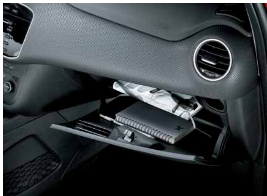
■ Storage compartment.

Inside, the Punto Evo Dynamic greets you with attractive features made of functional and elegant materials. The dash is black, whilst the central fascia comes in a choice of three different colours (grey, bordeaux or blue) to match the seat fabric. Amongst the new features that come as standard, you'll find the driver's knee protection airbag plus 40/60 split folding rear seats.