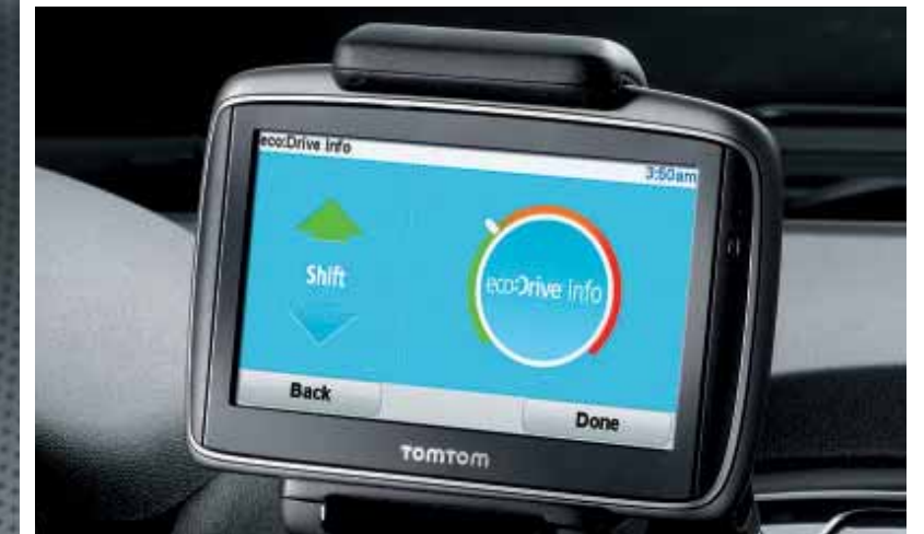
■ eco:Drive system.