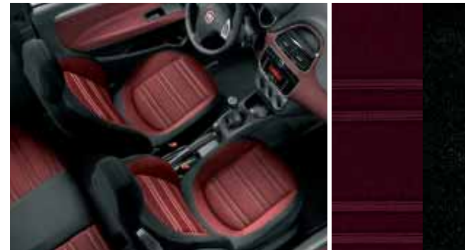
Bordeaux Dynamic 210