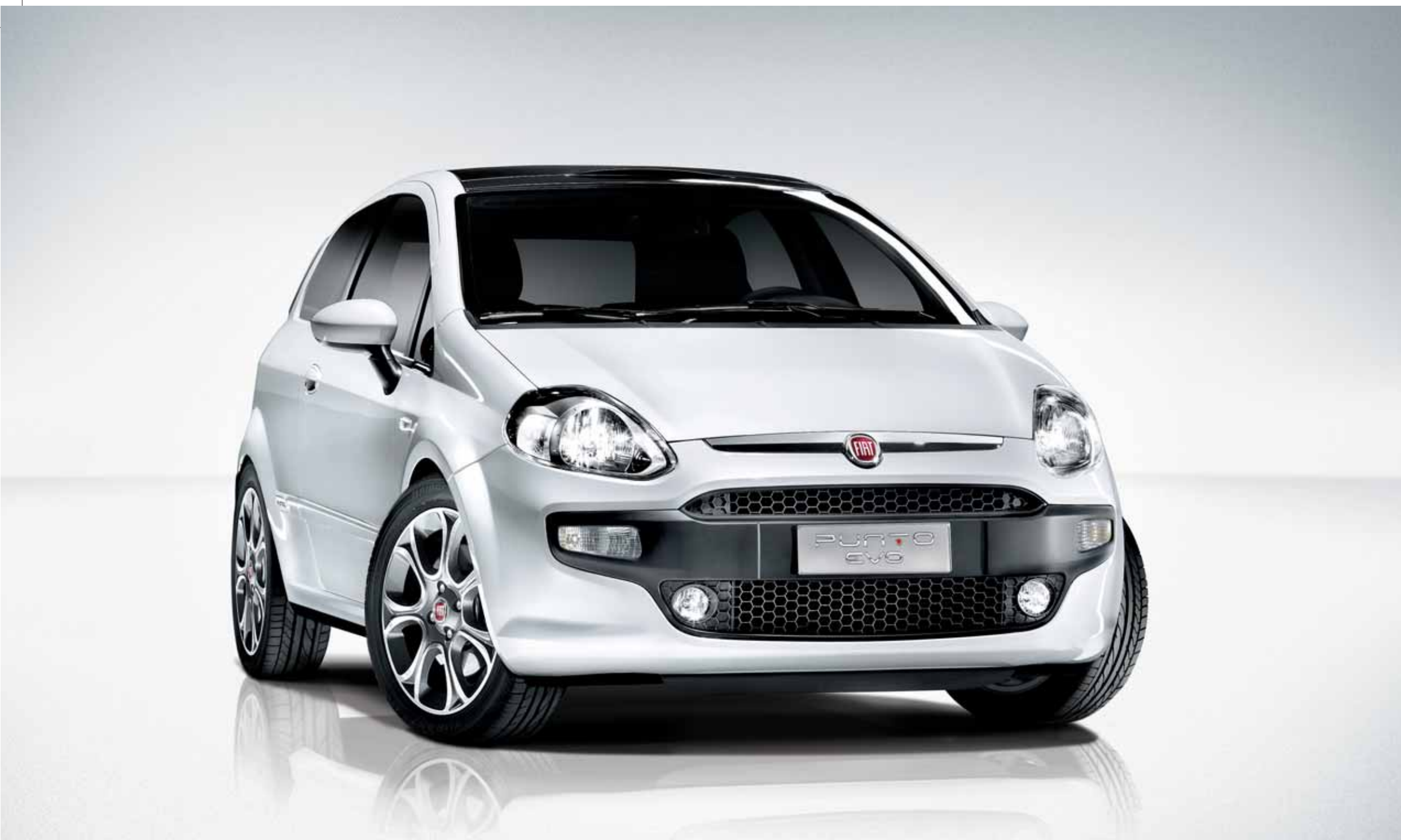
■ GP interior.