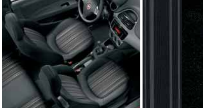
Grey Active 182