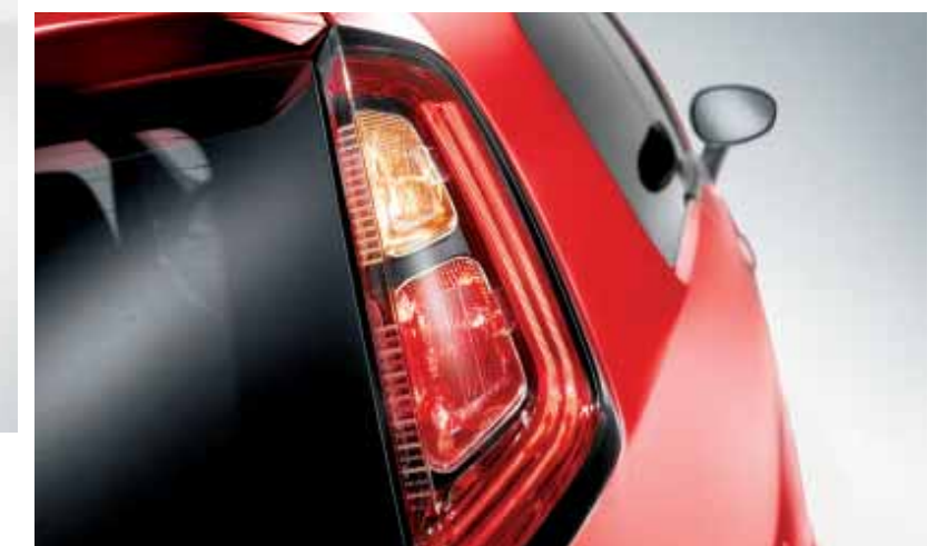
■ New rear light set with 'L' shaped rear lights.