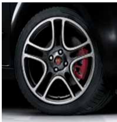
■ Optional 17" alloy wheels.