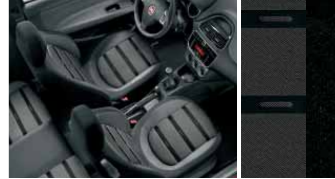
Black/Grey GP 519