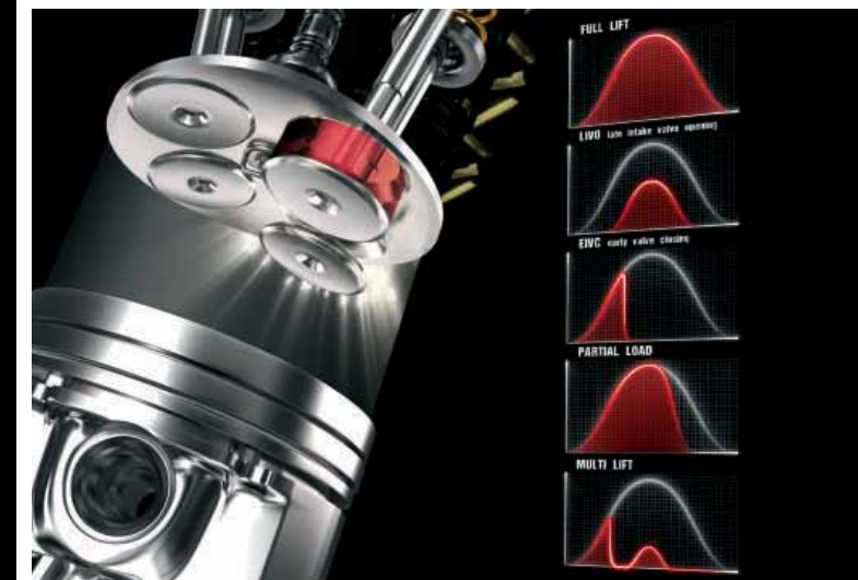
■ New intake valve management system.