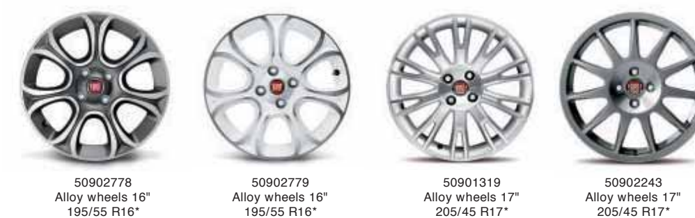
50902778 Alloy wheels 16" 195/55 R16*