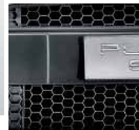
■ Sports grille.