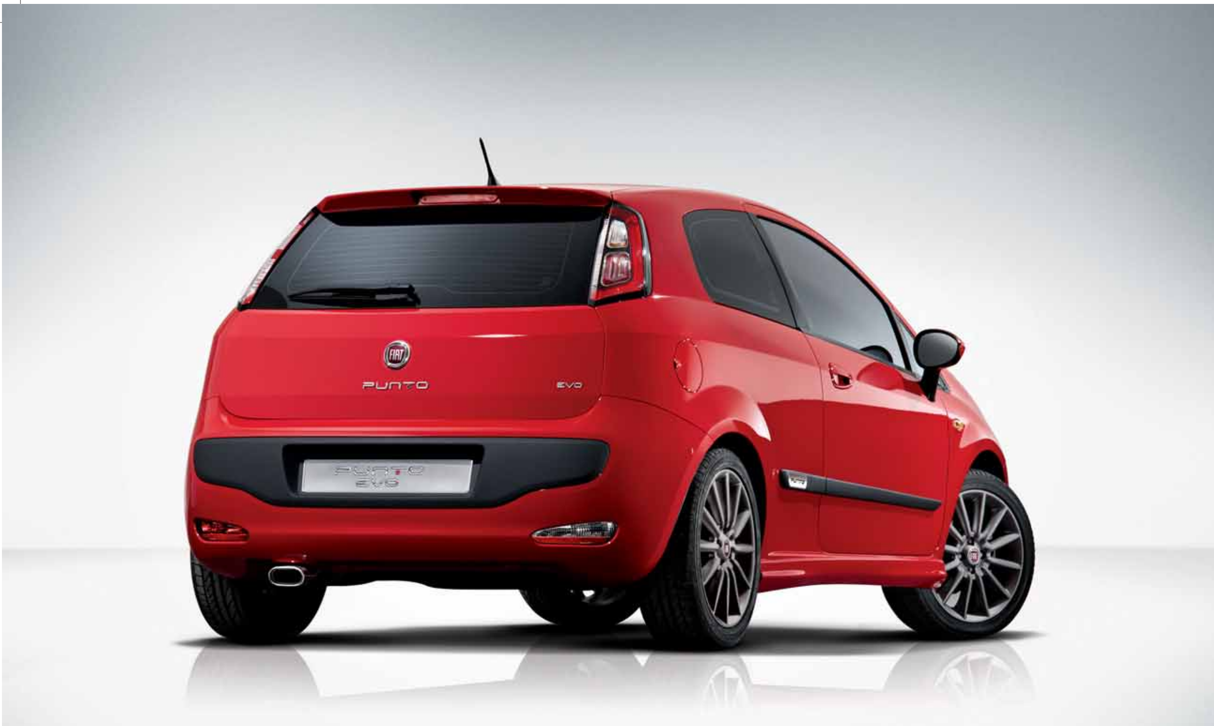
■ New headlamps with DRL (Daytime Running Light).