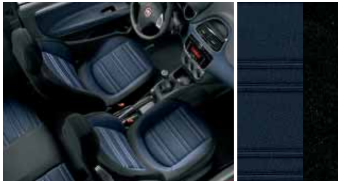
Blue Dynamic 234