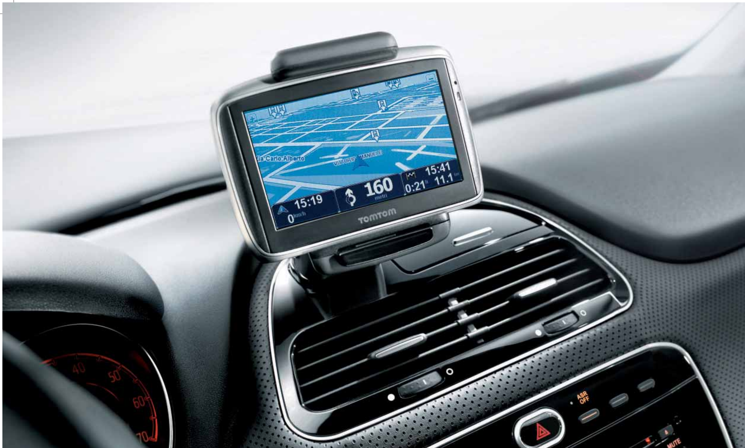
■ Portable Blue&Me - TomTom pre-disposition.