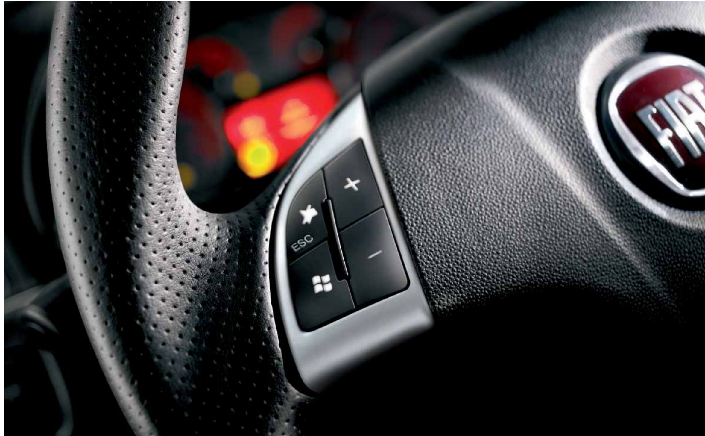
■ Steering wheel controls for communication and infotainment.

Blue&Me - TomTom allows you to safely use all of the car's infotainment and communication equipment without ever taking your hands off the wheel, or eyes off the road. How? Simple: with a tap of the finger or using voice commands you can call up the telephone keypad screen, the navigation screen or the music player, all integrated via Bluetooth® connectivity and the USB interface for flawless networking across the systems.