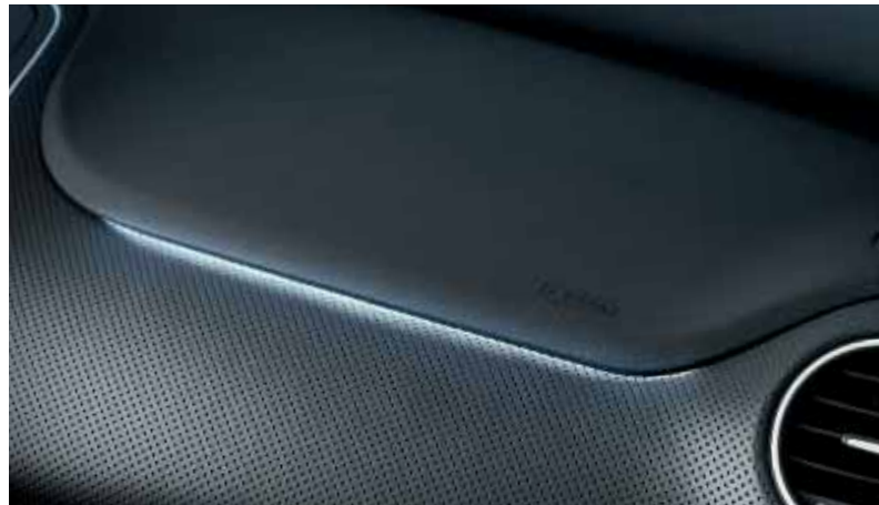
■ Ambient lighting: gently illuminates the interiors from the passenger's side dashboard.