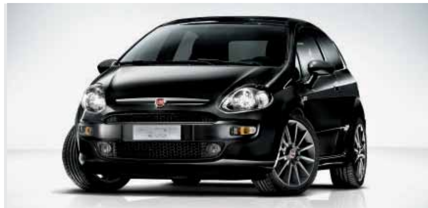
■ Punto Evo Sporting 3 door.