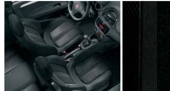
Black Sporting 649