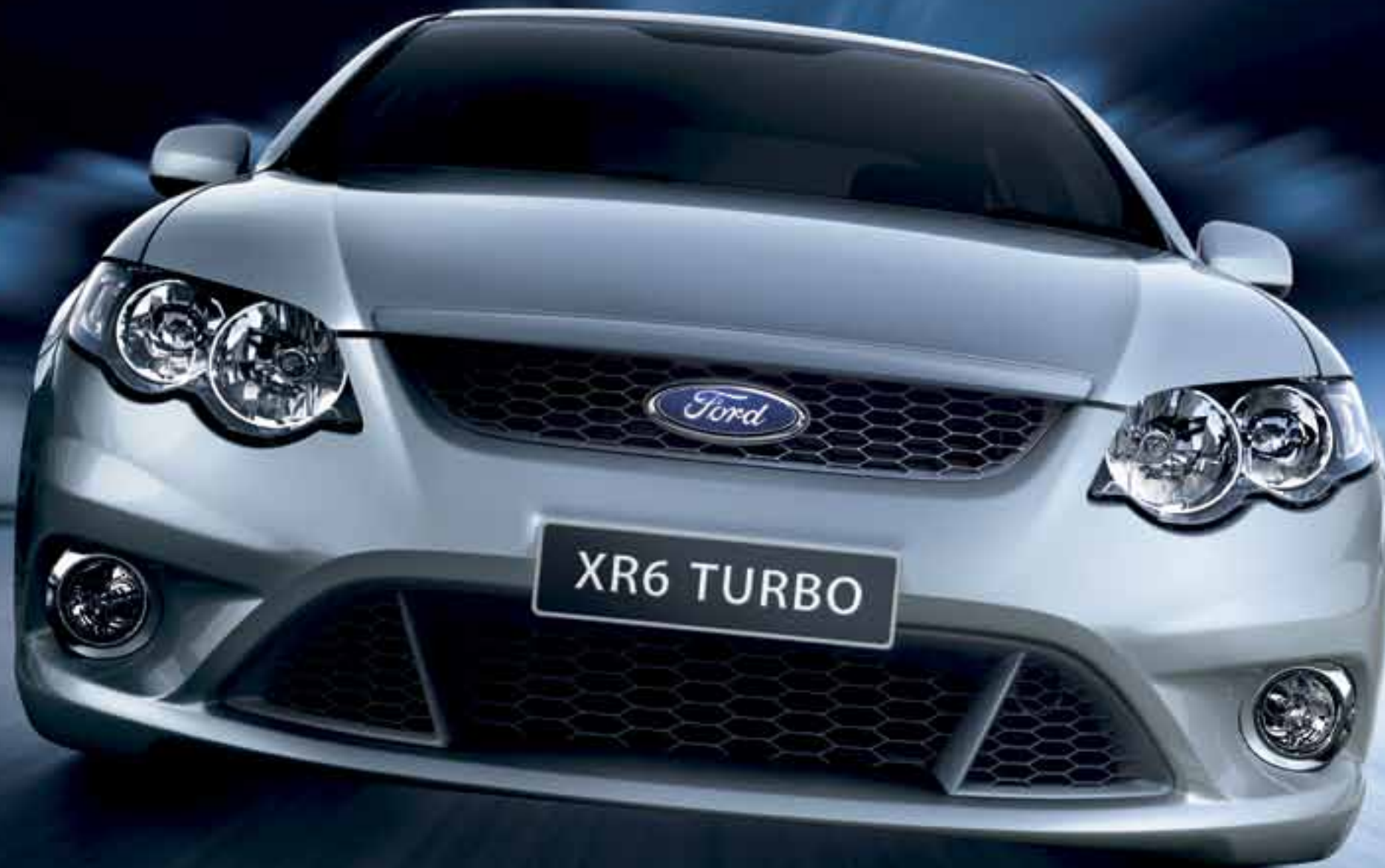
Falcon XR6 Turbo shown in Lightning Strike.

The range of sophisticated transmissions, with a low first gear ratio and higher top gear ratio deliver a truly spirited driving experience. The greater dynamic range means livelier, energetic performance as well as more relaxed cruising and ultra-smooth gear shifts.