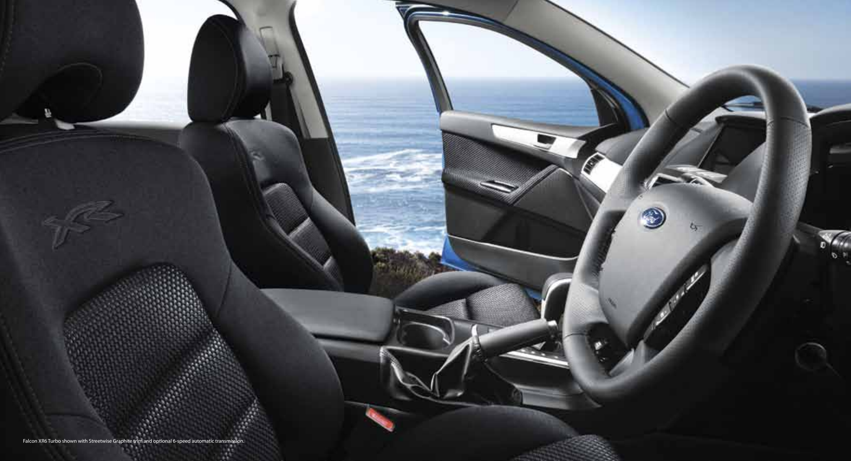
Falcon XR6 Turbo shown with Streetwise Graphite trim and optional 6-speed automatic transmission.