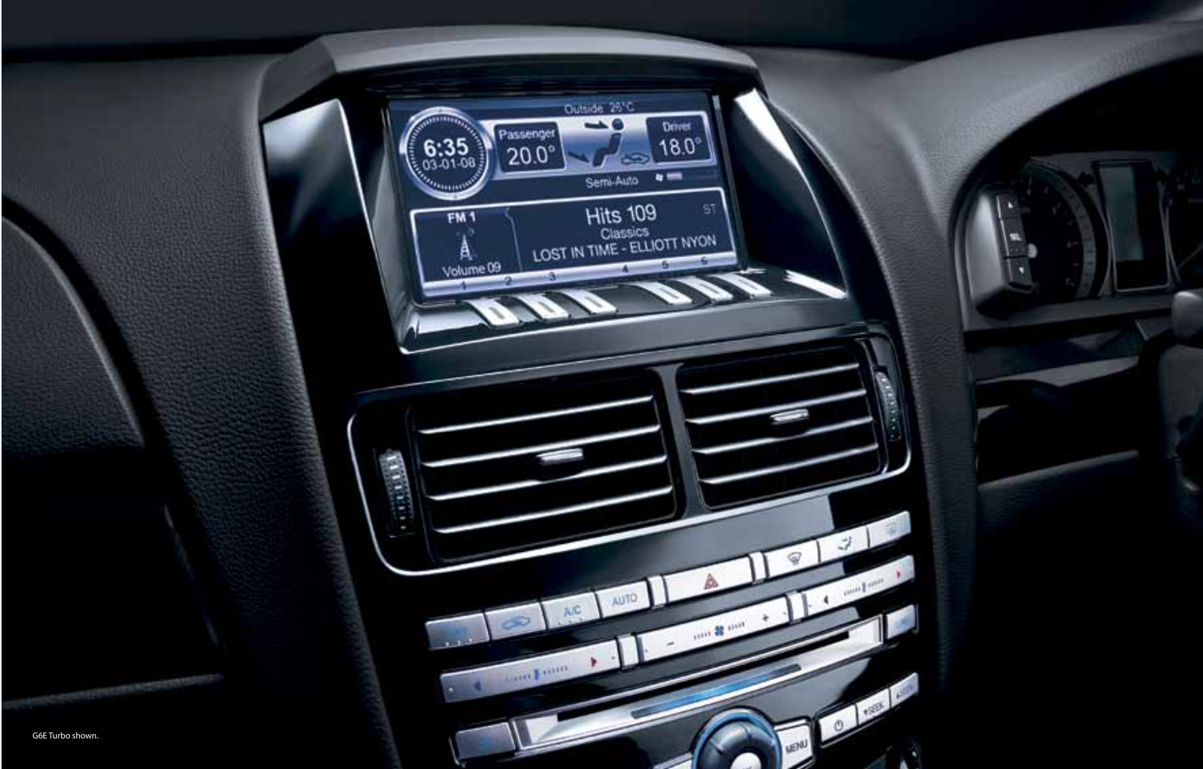
G6E Turbo shown.

The easy-to-read Multi-function Display allows you to check everything at a glance, from speed and journey distance to vehicle warnings and more.