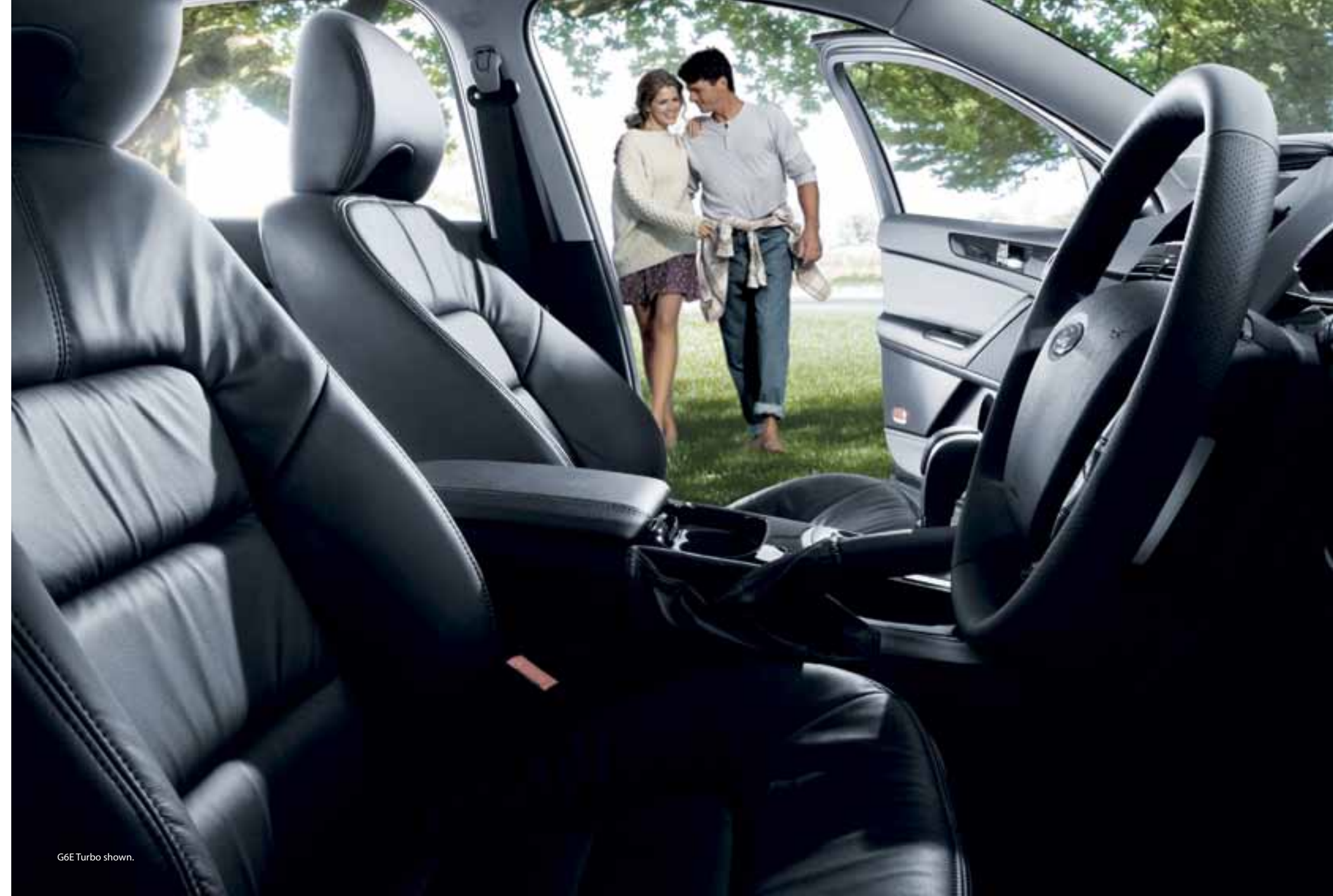
G6E Turbo shown.

This brochure is designed to provide you with a general introduction to the Ford Products (including available optional equipment) referred to, and should be read in conjunction with the latest specification sheet. Because of changes in conditions and circumstances Ford* reserves the right, subject to all applicable laws, at any time, at its discretion, and without notice, to discontinue or change the features, designs, materials, colours and other specifications and the prices of their products, and to either permanently or temporarily withdraw any such products from the market without incurring any liability to any prospective purchaser or purchasers. The latest specification sheet should be referred to for information on the availability, ordering and use of optional equipment. Always consult an authorised Ford Dealer for the latest information with respect to features, specifications, prices, optional equipment and availability before deciding to place an order. *FORD MOTOR COMPANY OF AUSTRALIA LIMITED. (A.B.N. 30 004 116 223) Registered Office: 1735 Sydney Road, Campbellfield, Victoria 3061, Australia. Printed July, 2010. FFALC0001_eb