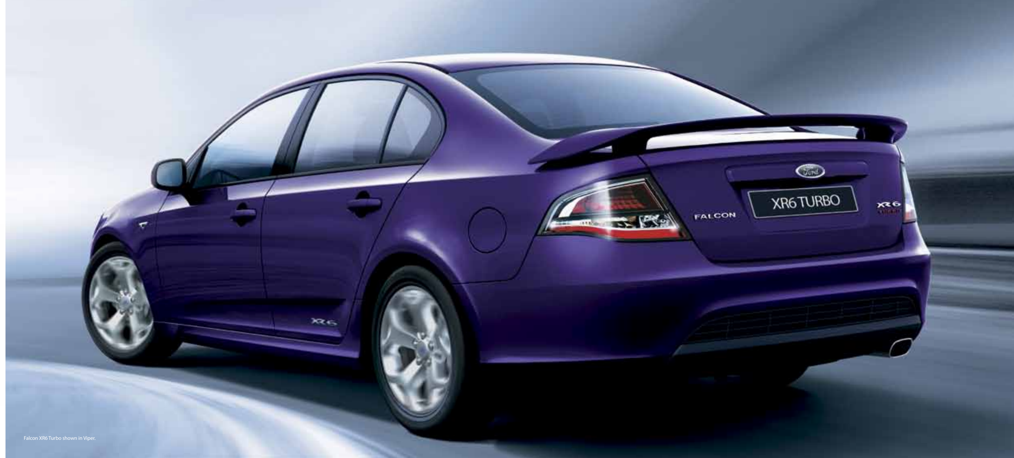
Falcon XR6 Turbo shown in Viper.