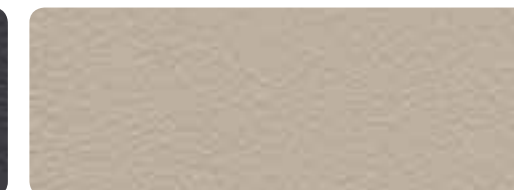
Cashmere Leather seat inserts