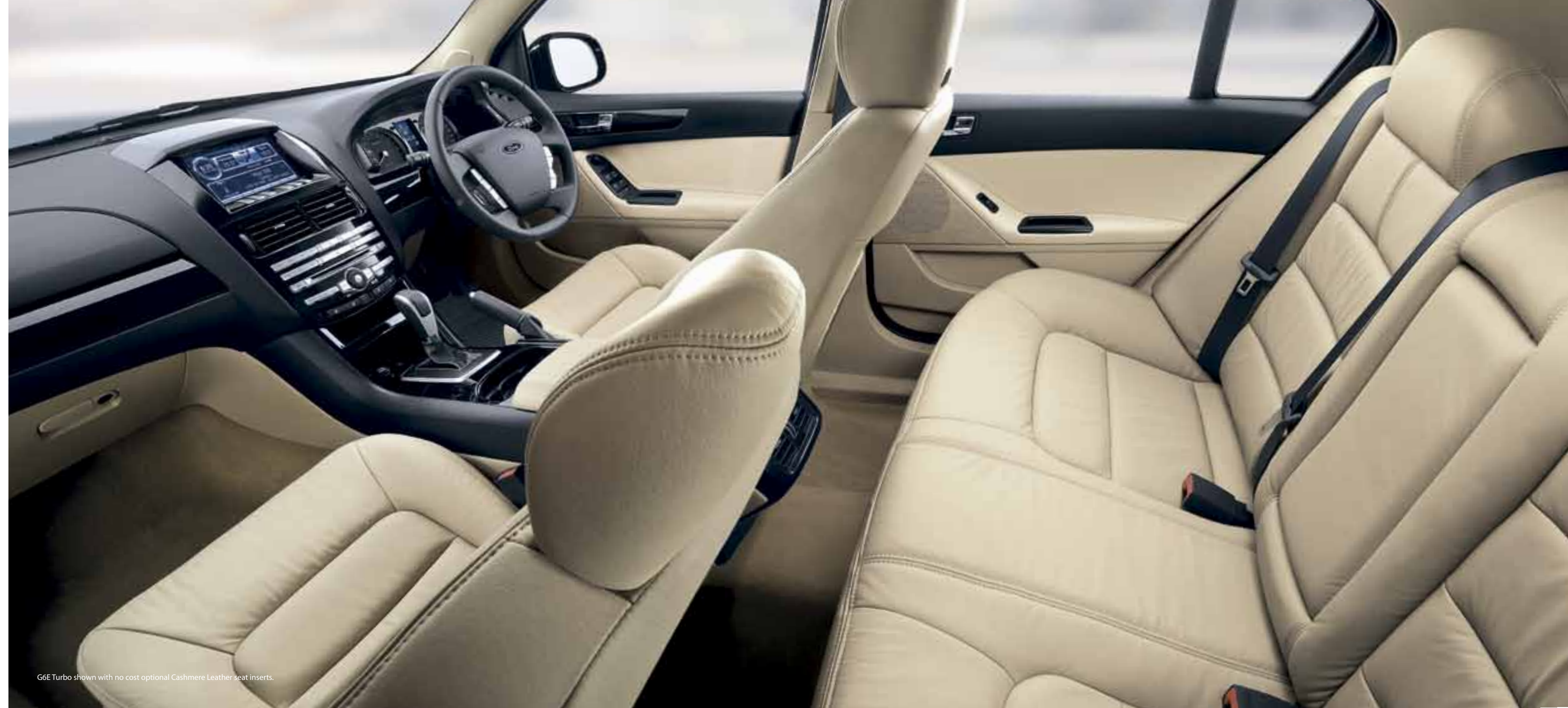
G6E Turbo shown with no cost optional Cashmere Leather seat inserts.