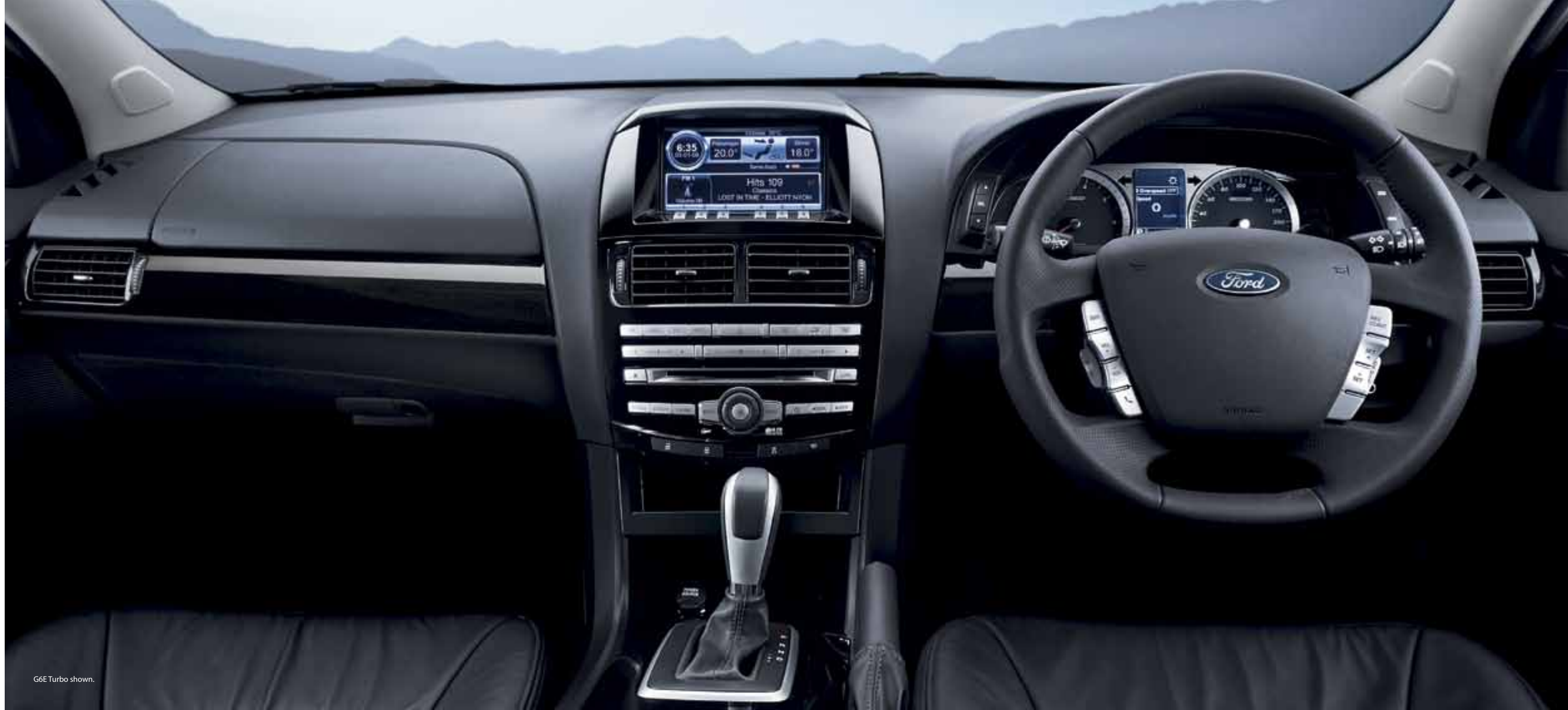
G6E Turbo shown.

When you can set the interior temperature to suit, the family travels in complete comfort regardless of what mother nature has in store.