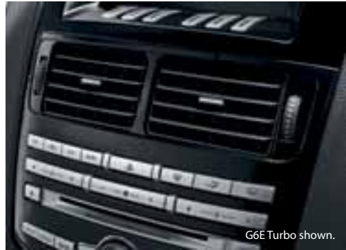
G6E Turbo shown.

Adjustable interior lighting means you can keep an eye on the little ones while they're snoozing without disturbing a moment's rest.