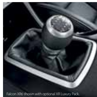
Falcon XR6 shown with optional XR Luxury Pack.