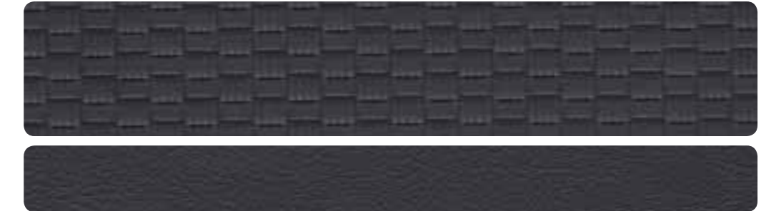
Nudo Shadow Leather seat inserts