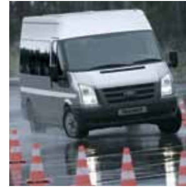
Dynamic Stability Control (DSC) gives you a greater ability to steer your way out of trouble.