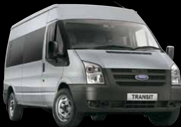
Moondust Silver #