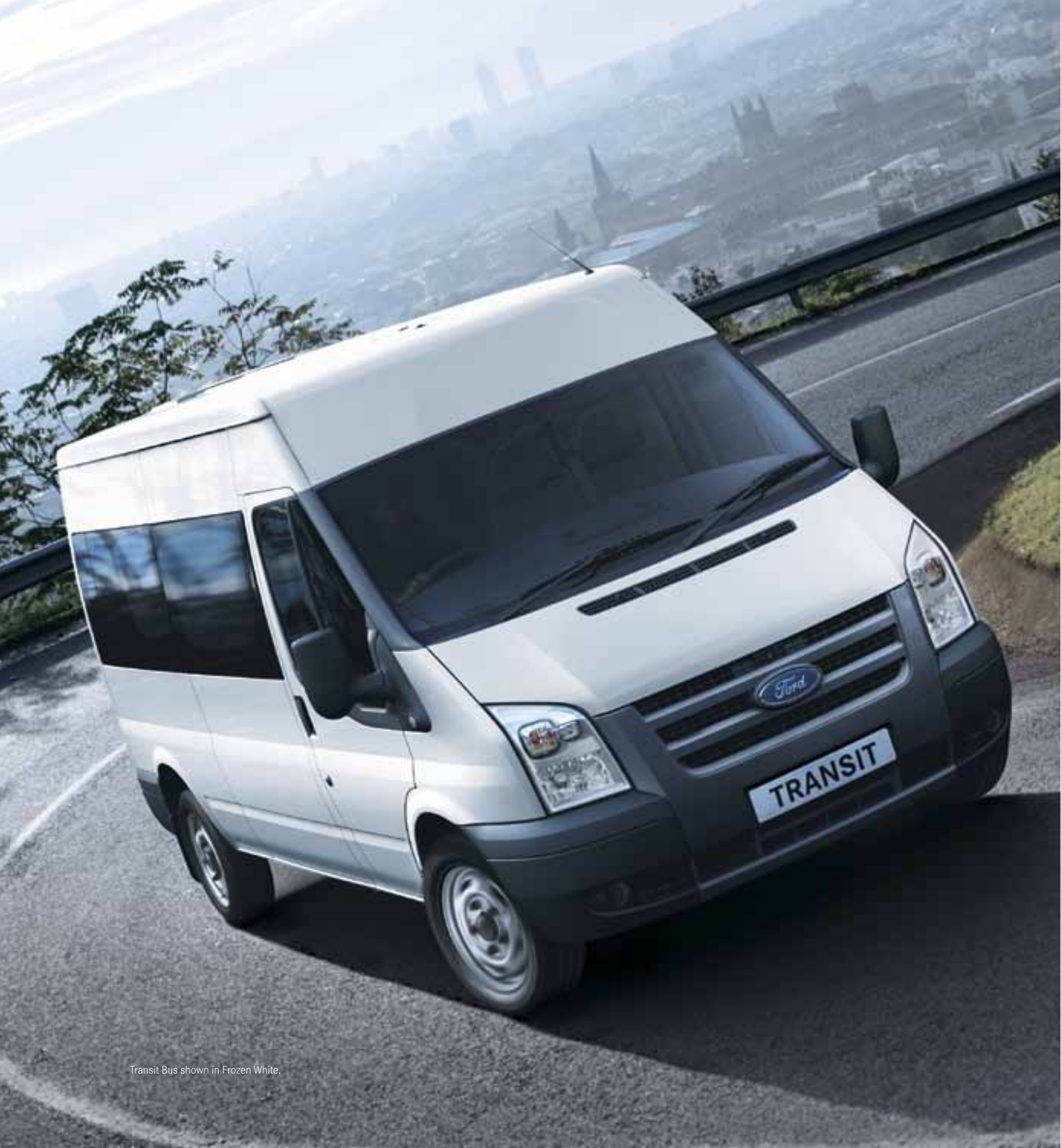
Transit Bus shown in Frozen White.