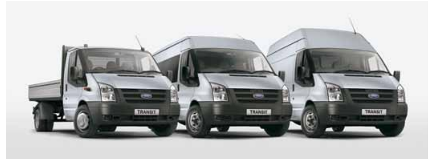
The Ford Transit line-up makes choosing the right van, cab chassis or bus for your business simple. The Transit range definitely means business with bold exterior styling, diesel power, advanced safety and superior comfort. Left to right: Transit Cab Chassis shown with aftermarket tray, Transit Bus, and Transit Van LWB shown with high roof and accessory full partition.