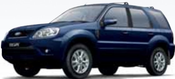
West Pacific Blue