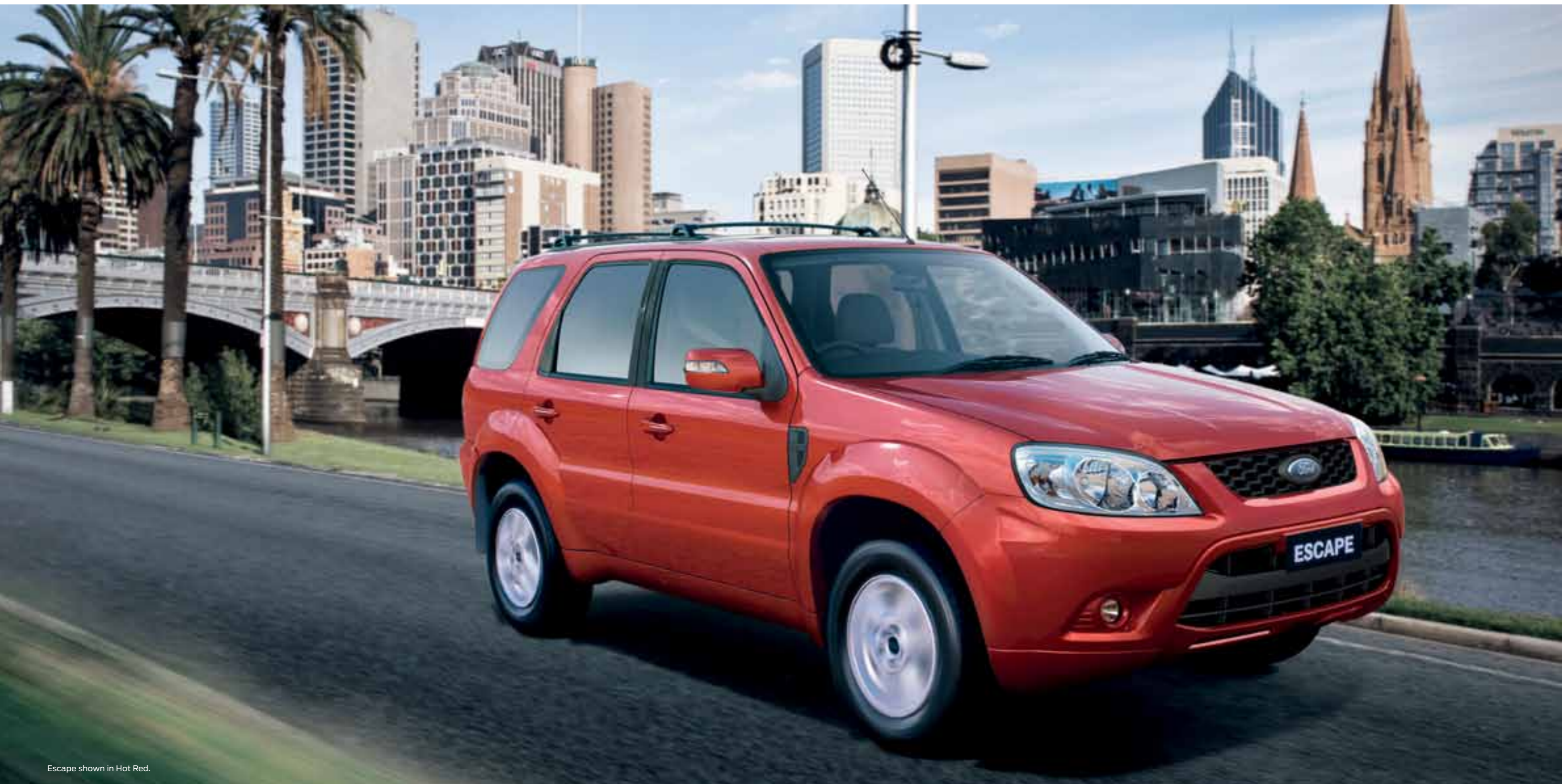
Escape shown in Hot Red.

With genuine 4WD capabilities and sedan like handling, the Ford Escape is equally at home in the city or off the beaten track.