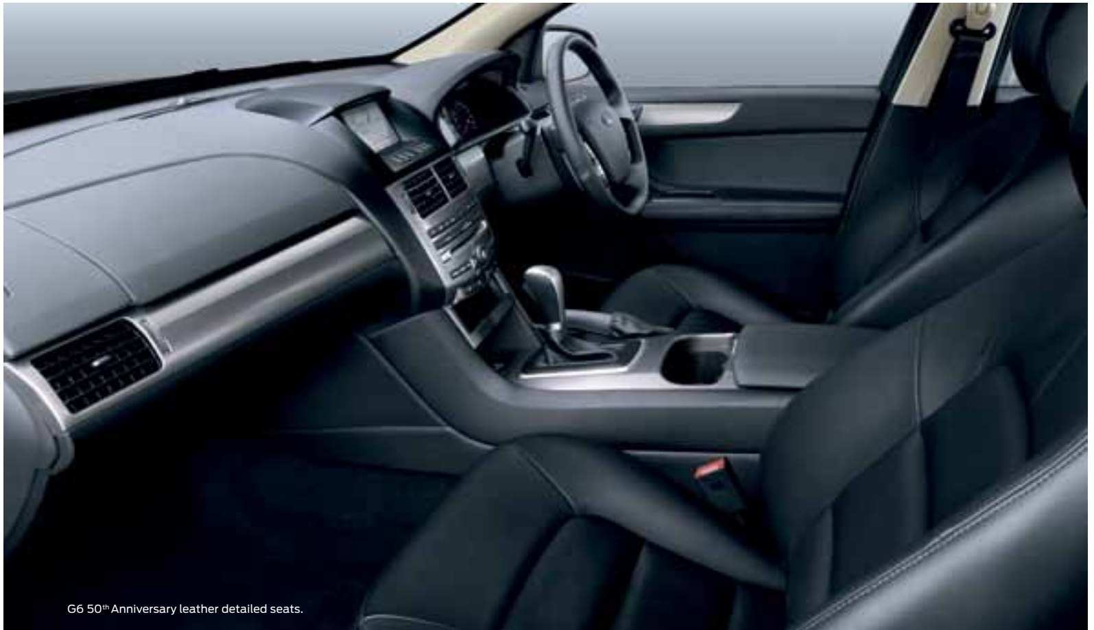
G6 50 th Anniversary leather detailed seats.