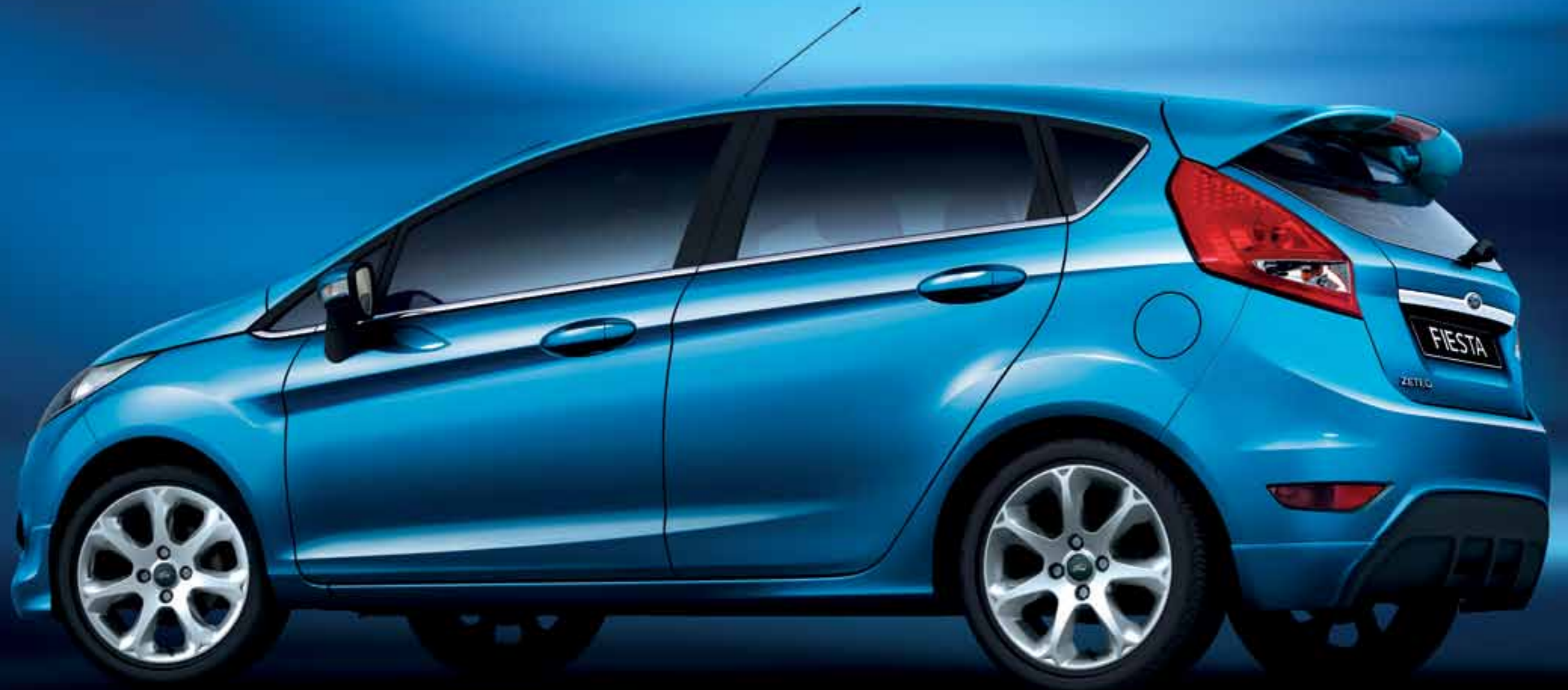
WS Fiesta Zetec 5 door shown in Vision.