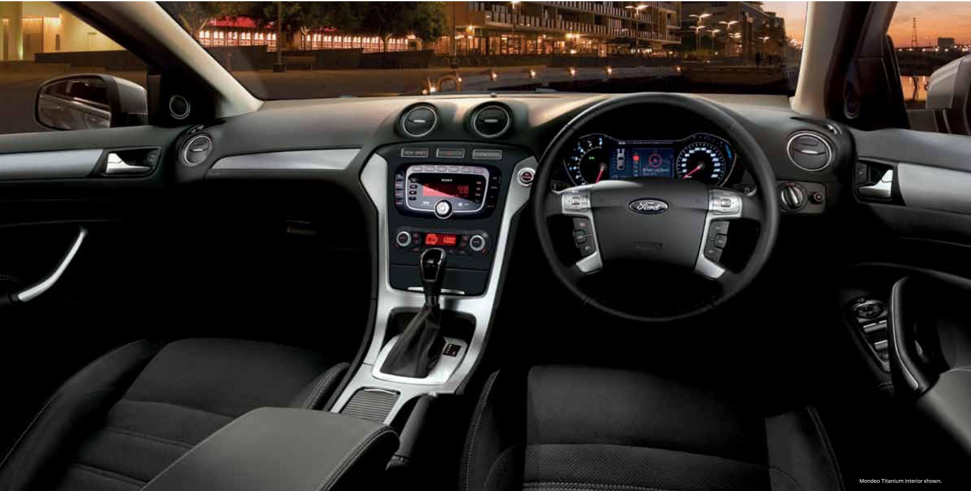
Mondeo Titanium interior shown.

A car that can detect when you're drowsy^ and that allows you to make phone calls without lifting your hands off the steering wheel are just some of the features that ensures your experience behind the wheel of the Mondeo is everything the exterior design promises.