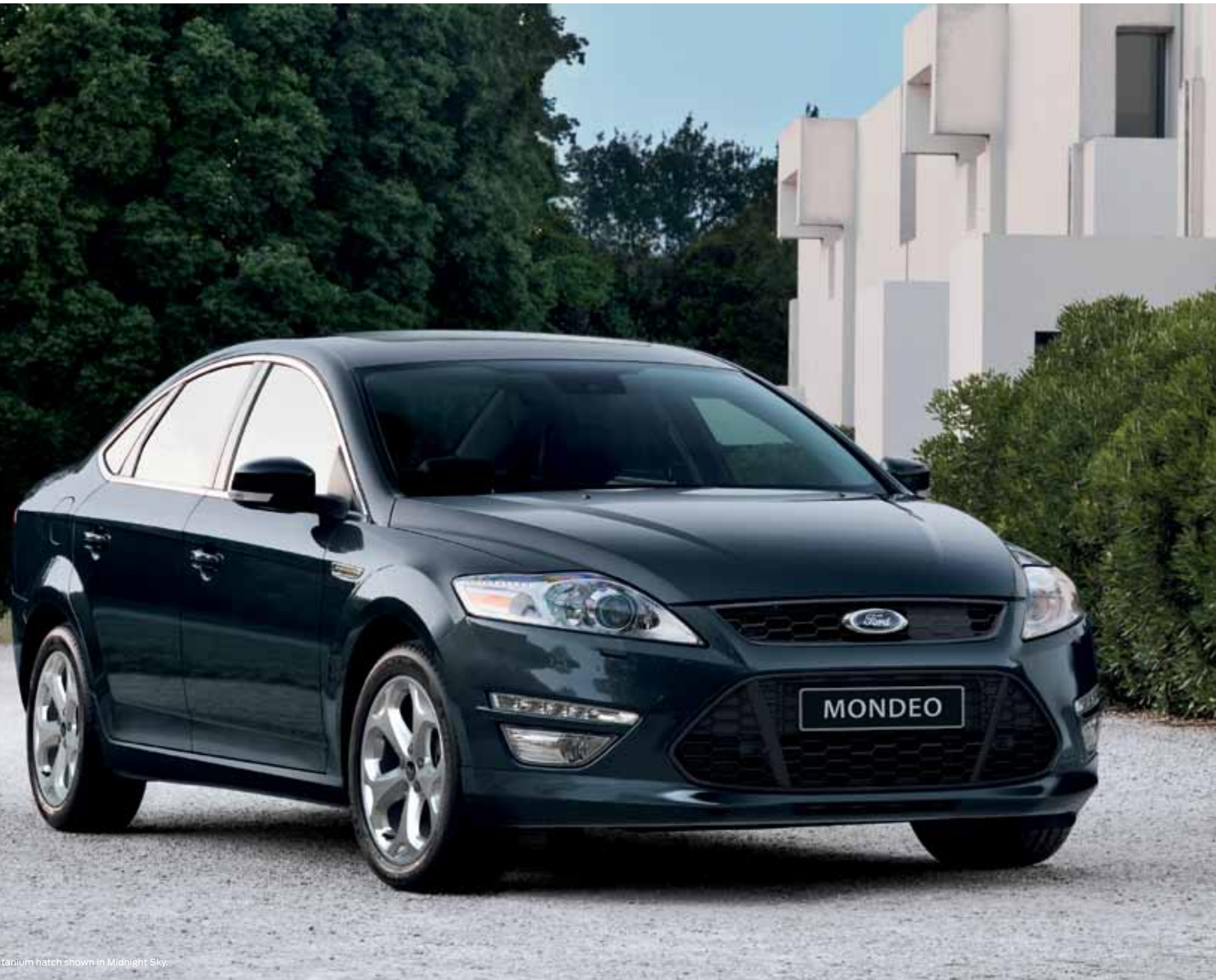
Mondeo Titanium hatch shown in Midnight Sky.

A great car is just the beginning. We support you with a wide range of services that aim to make you one of the most satisfied vehicle owners in Australia.