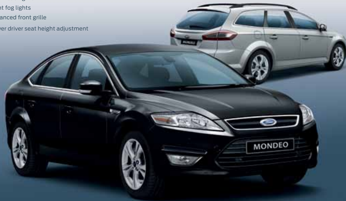
Sedan shown in Panther Black, wagon shown in Moondust Silver.