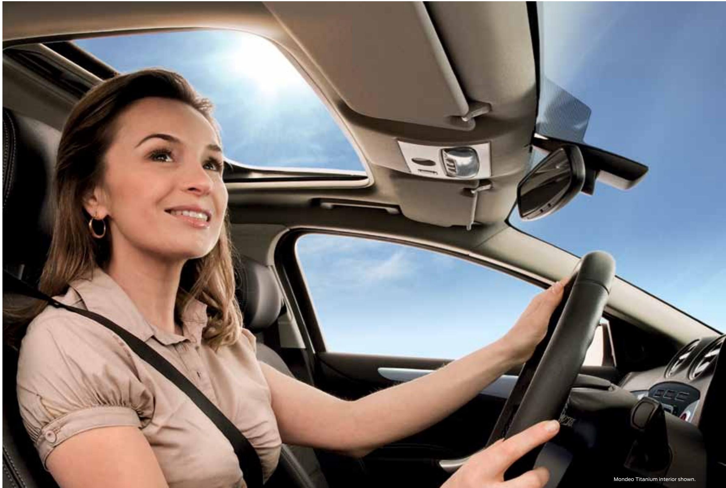
Mondeo Titanium interior shown.

Individual 'zones' allow different temperature to be set for driver and passenger, ensuring the ultimate in personal comfort.