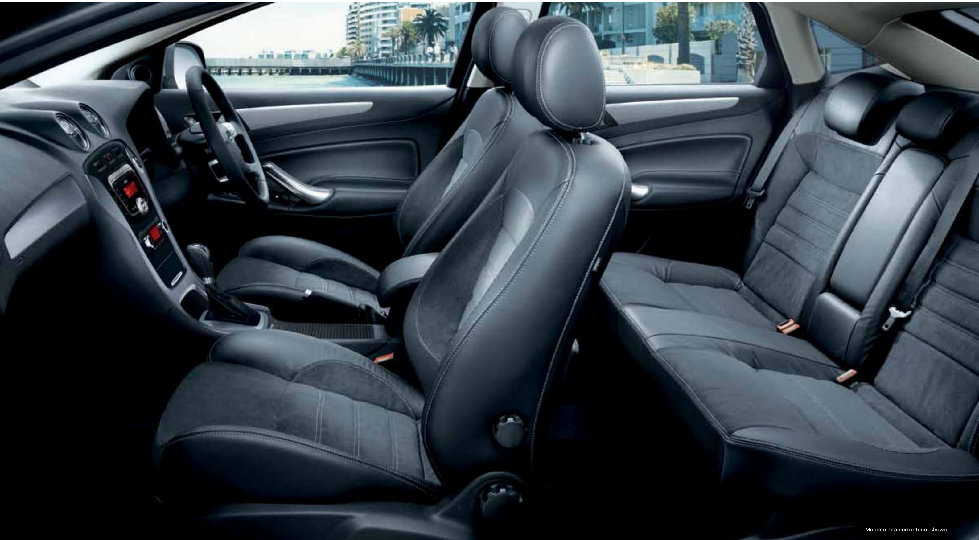
Mondeo Titanium interior shown.

Featuring Alcantara leather-trim seats, the Mondeo Titanium allows both driver and passengers to sit back and experience first class comfort and luxury.