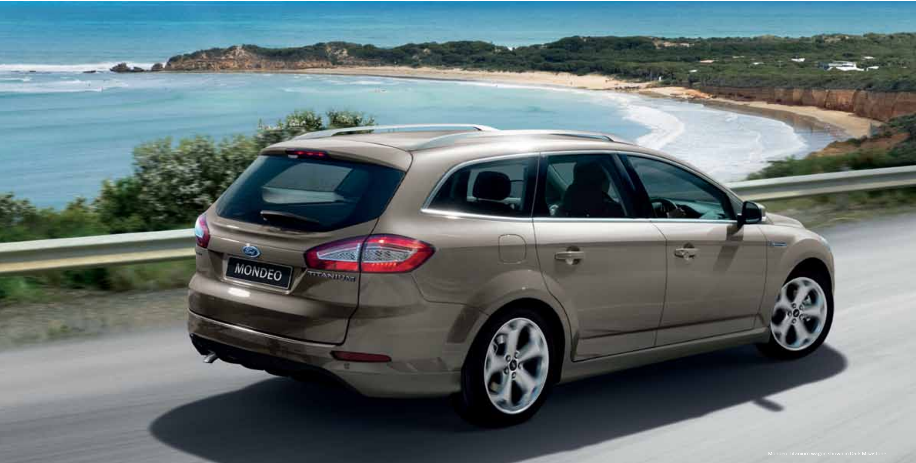
Mondeo Titanium wagon shown in Dark Mikastone.

For those who pack more into life you'll be pleased to know the Mondeo range gives you a vehicle that gives you the flexibility to pack more of whatever you need.