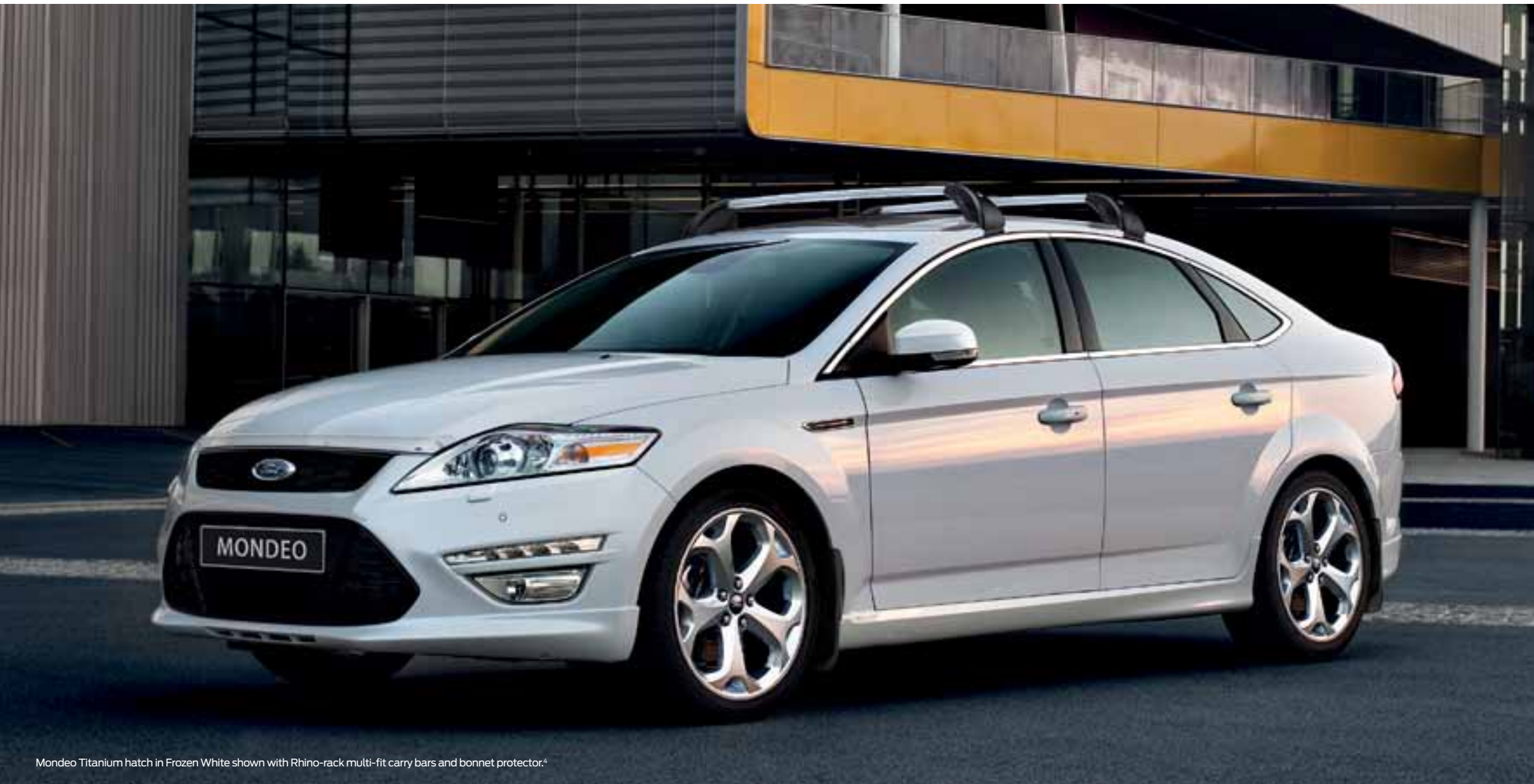
Mondeo Titanium hatch in Frozen White shown with Rhino-rack multi-fit carry bars and bonnet protector. 4

The Ford Vehicle Personalisation accessory range lets you personalise your Mondeo to perfectly suit your needs.