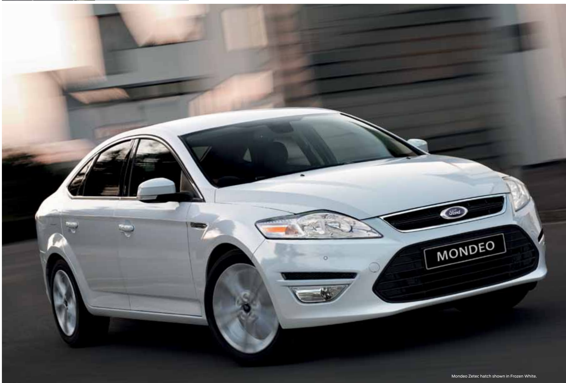
Mondeo Zetec hatch shown in Frozen White.

Front wipers that automatically turn on when it begins to rain. A sensor on the front windscreen detects if and how much rain is falling, and based on your speed, the wipers automatically function to give you maximum visibility.