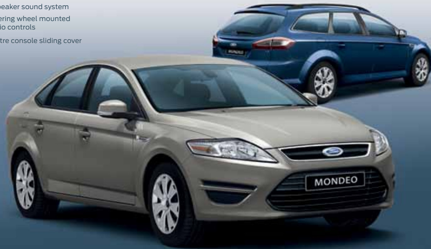
Sedan shown in Dark Mikastone, wagon shown in Ink Blue.