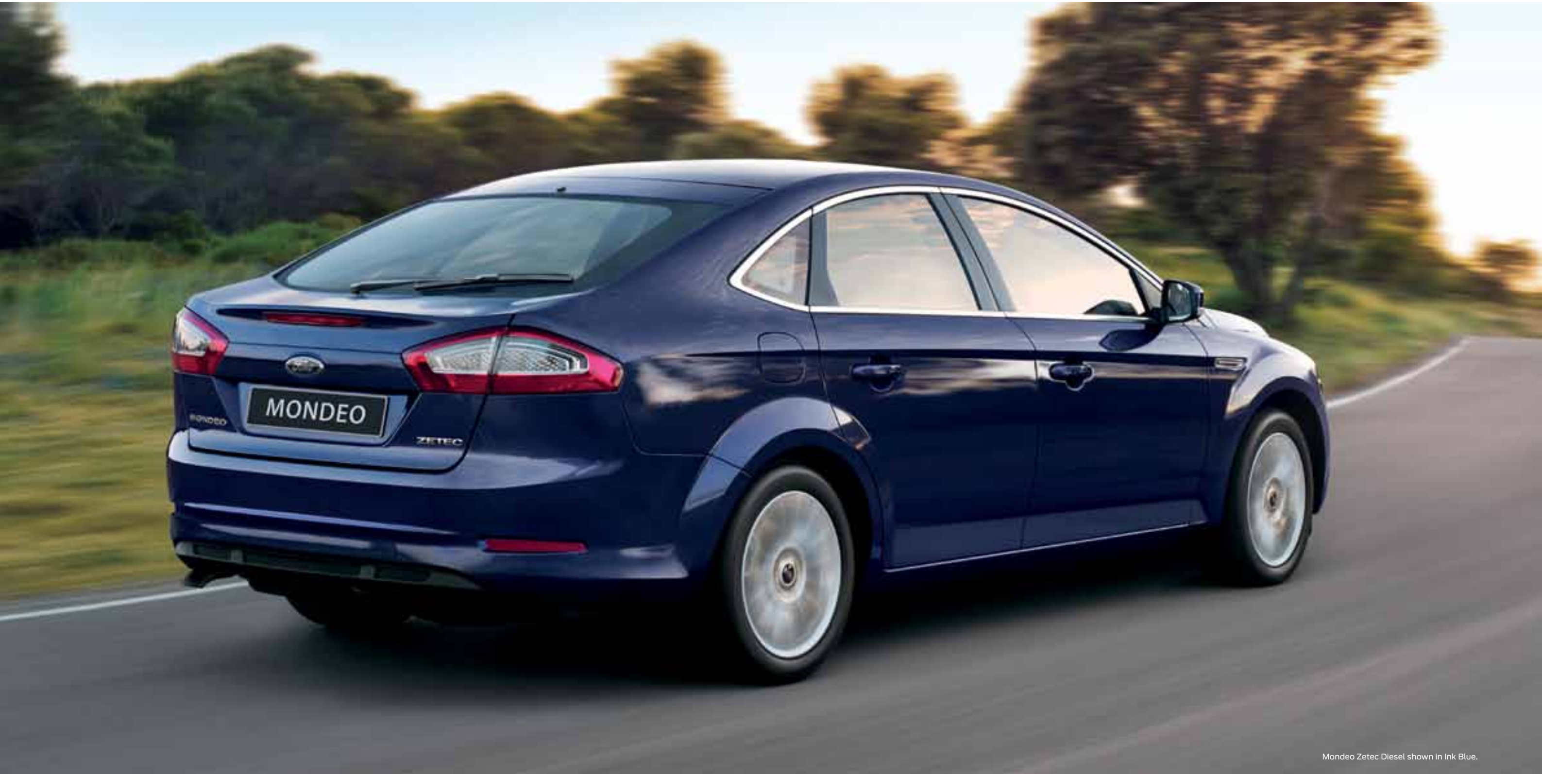
Mondeo Zetec Diesel shown in Ink Blue.

The Mondeo proves that a diesel can be as stylish and sporty as it is economical.