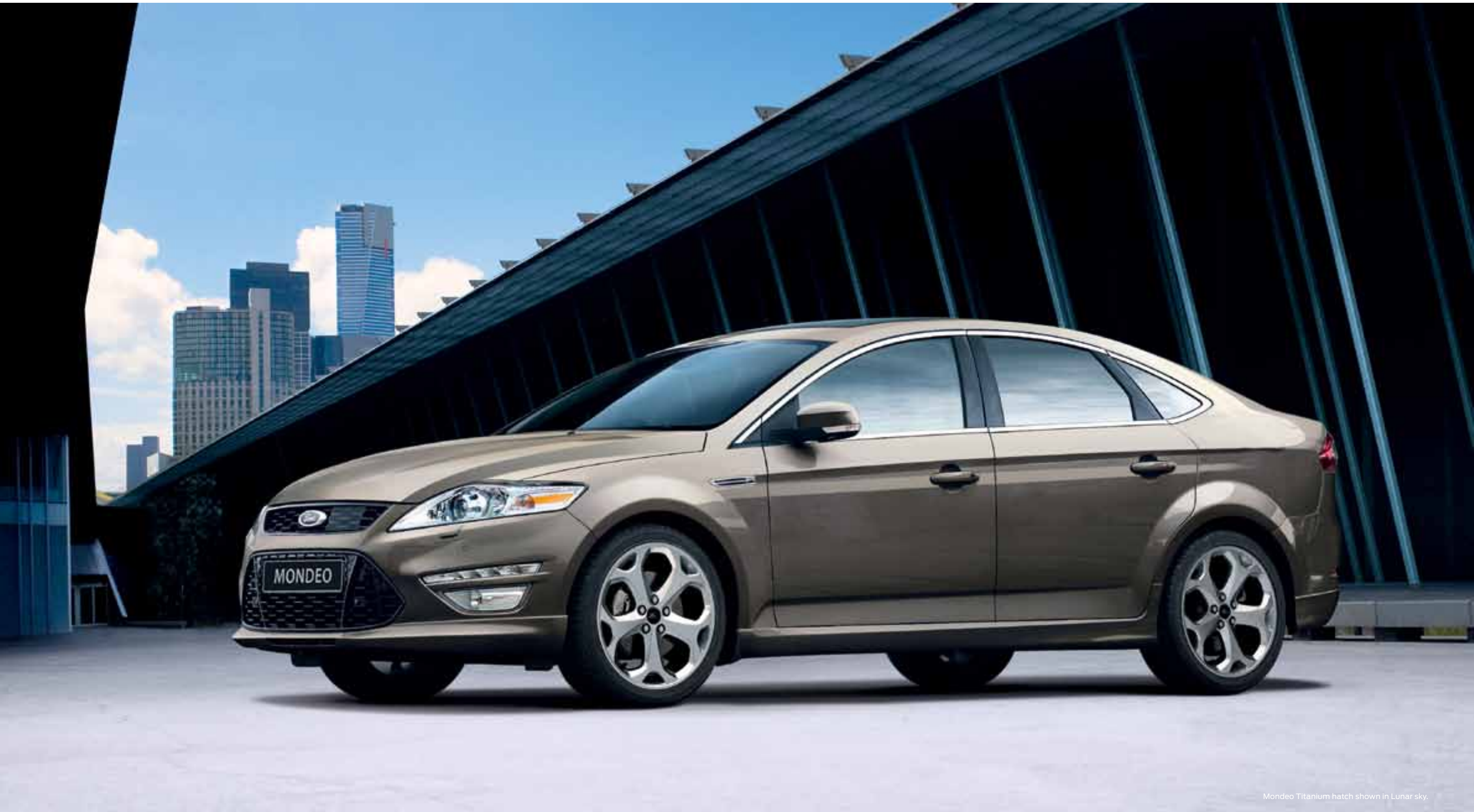
Mondeo Titanium hatch shown in Lunar sky.

Some designs are blessed with a unique talent to stand out from the pack. Introducing the new Ford Mondeo.