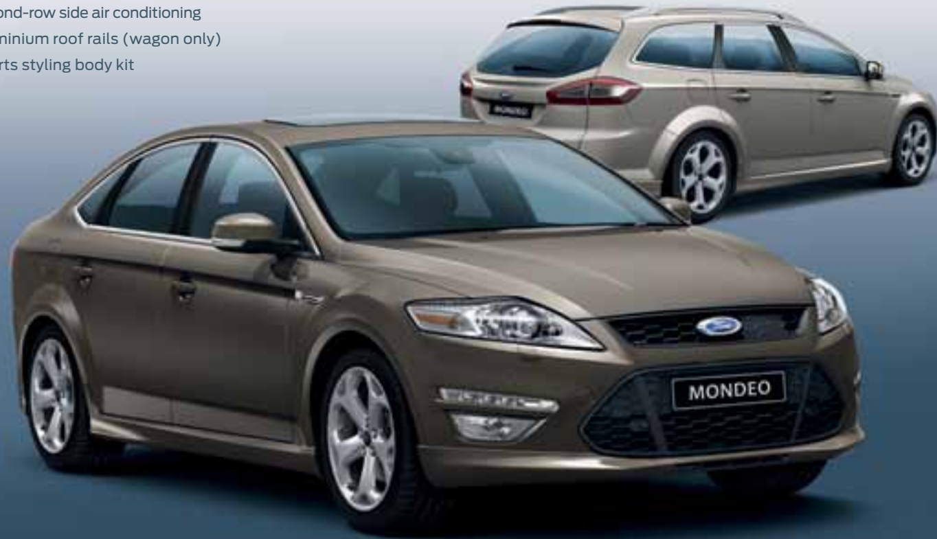
Sedan shown in Lunar Sky, wagon shown in Dark Mikastone.