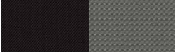
Dark Slate Grey