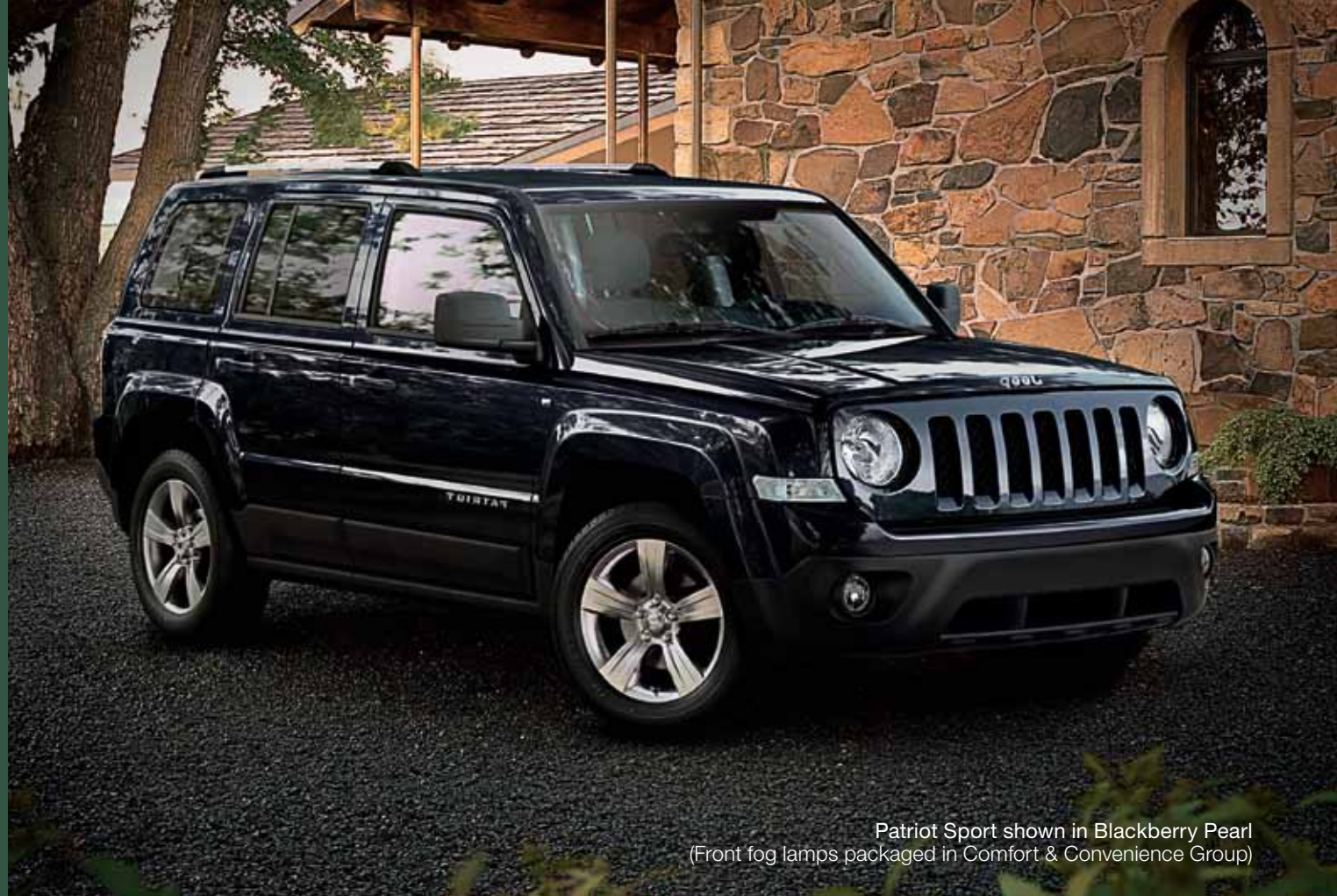
Patriot Sport shown in Blackberry Pearl (Front fog lamps packaged in Comfort & Convenience Group)

Inside the cabin, you can take your toys with you by lowering the 60/40 split-folding reclining rear seats to open up a roomy 1,357-litres of cargo volume.