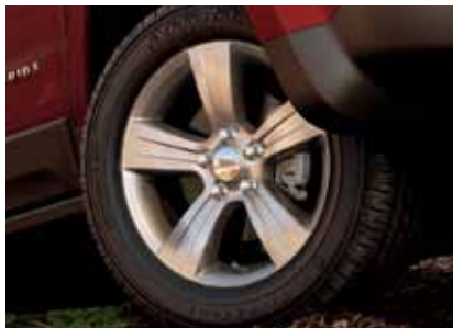
SPORT & LIMITED 17-inch aluminium wheels