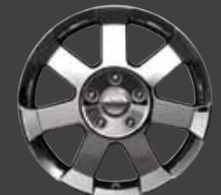
Chrome Cast-Aluminium Wheel 18-inch

07. SWING AWAY TYRE CARRIER. Moves the weight of the spare tyre from the body to the frame.