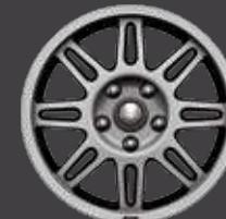
Black Pocketed Cast-Aluminium Wheel 17-inch