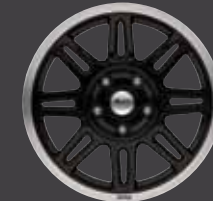
Black Painted Cast-Aluminium Wheel 17-inch