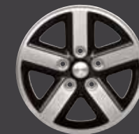
Black/Chrome Cast Aluminium Wheel 16-inch