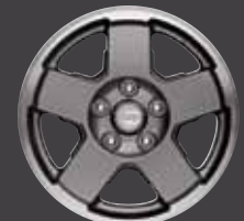
The Hulk Wheel 17-inch