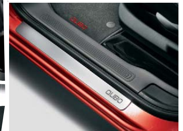
Tough, stylish aluminium kick plates feature the signature Qubo logo.