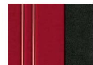
220 RED / BLACK AXELL