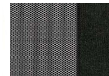
372 BLACK / GREY SAIL