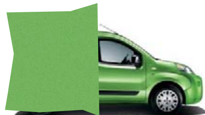
355 DISCO GREEN