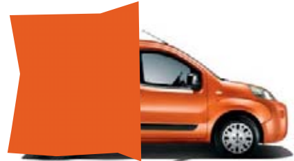
551 FUNKY ORANGE