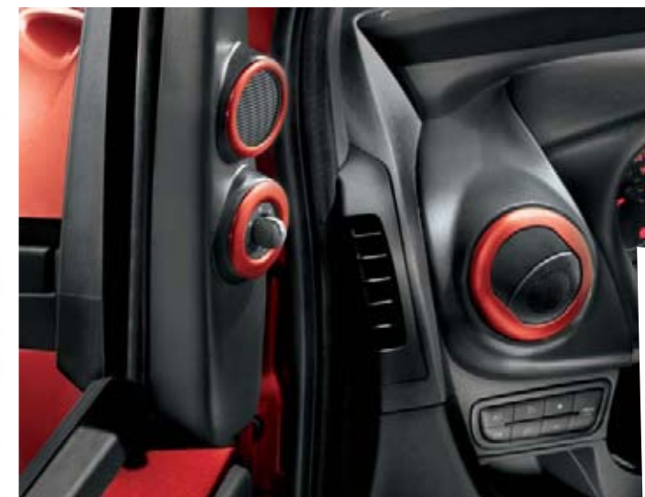
Anodised aluminium mouldings give the interior a hi-tech feel.

This doesn't stop with the interior; there's a choice of ten exterior colours, and naturally there is a selection of roof bars and racks to help accommodate your leisure pursuits too.