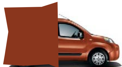
112 WONKY TECHNO ORANGE