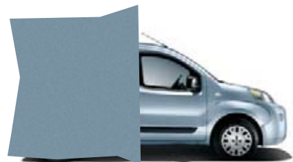
448 HILLBILLY AZURE