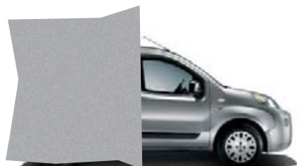
612 MINIMAL GREY