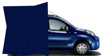
487 COOL JAZZ BLUE