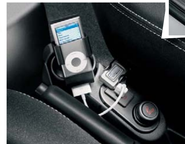
With support for your iPod® that ensures your player is always safe and at your fingertips.