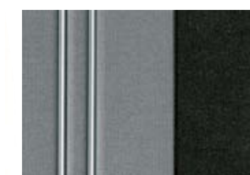
288 GREY / BLACK AXELL