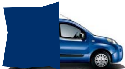
479 LINE BLUE