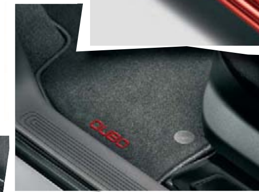
Velvet mats embroidered with the Qubo logo are a luxurious touch.