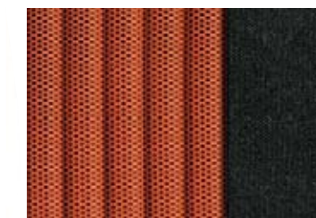
232 BLACK / ORANGE SAIL