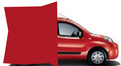
168 BREAKCORE RED