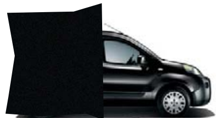
632 ROCKABILLY BLACK