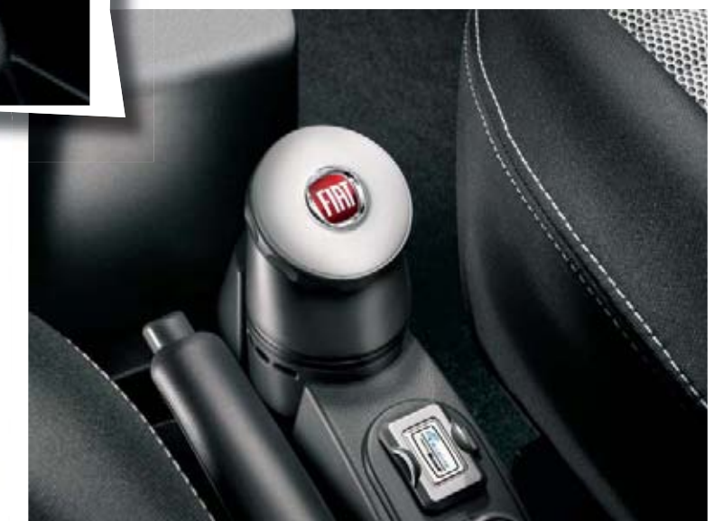
The fragrance dispenser offers a wide range of scents.