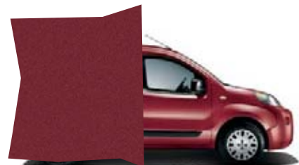
293 FLAMENCO RED