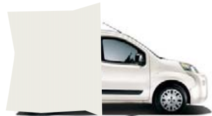
249 AMBIENT WHITE