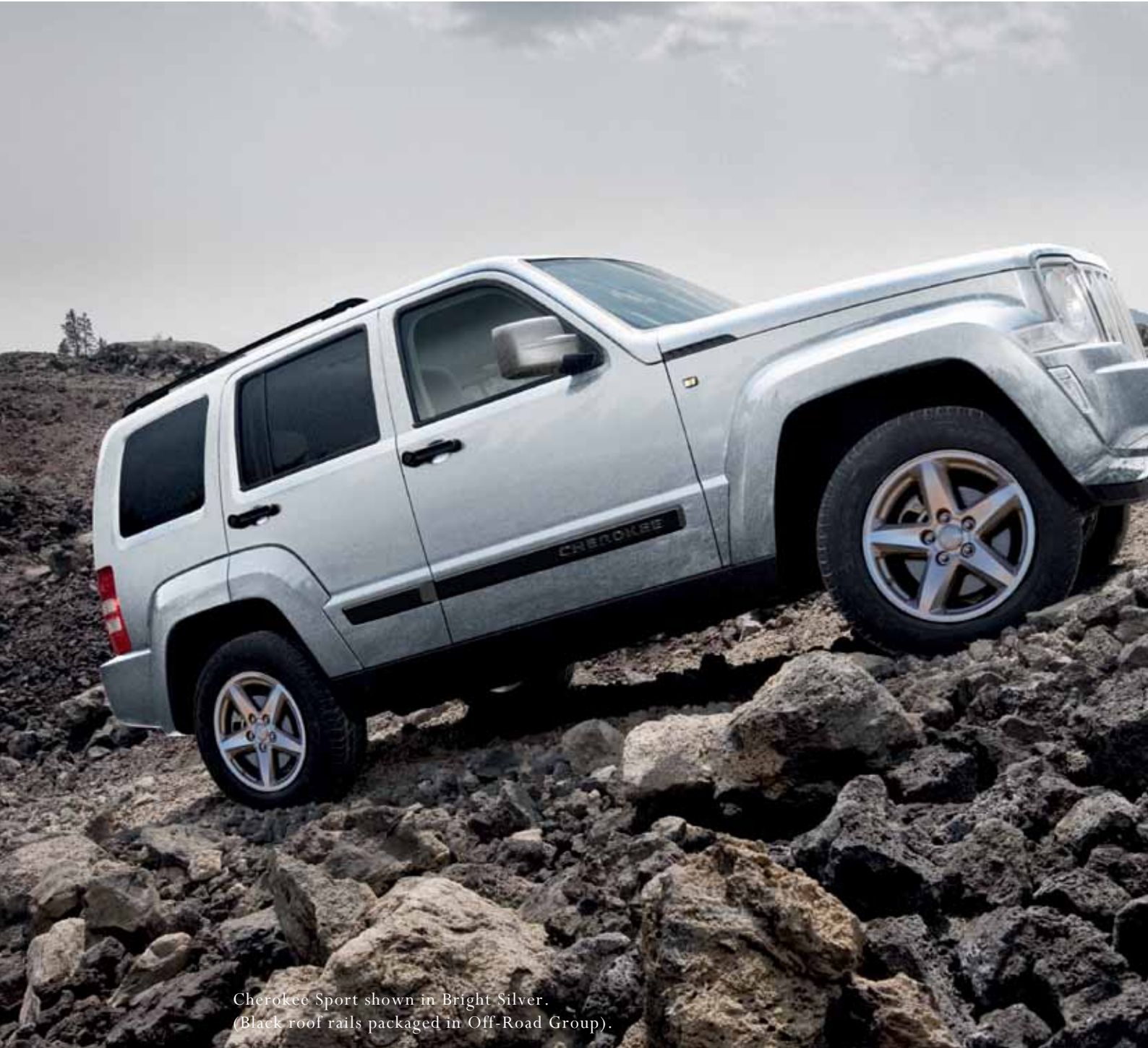
Cherokee Sport shown in Bright Silver. (Black roof rails packaged in Off-Road Group).