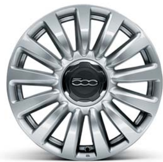
433 16" SILVER ALLOY WHEELS