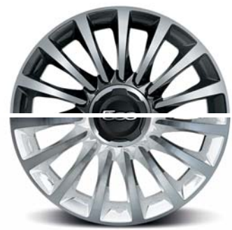
LINEACCESSORI 17" 225/45 R17 DIAMOND FINISHED WHITE ALLOY WHEELS