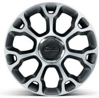
5EQ 17" TREKKING ALLOY WHEELS GLOSSY BLACK DIAMOND FINISHED AND M+S (MUD&SNOW) ALL-SEASON TYRES