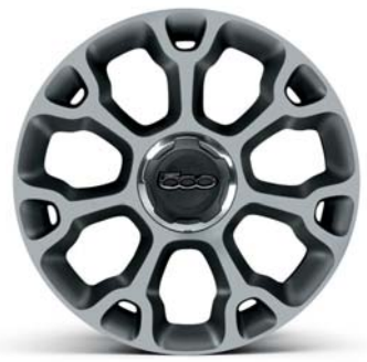
68Q 17" TREKKING ALLOY WHEELS MATT BLACK DIAMOND FINISHED AND M+S (MUD&SNOW) ALL-SEASON TYRES