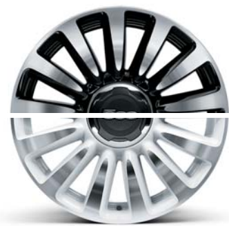
4WQ 16" ALLOY WHEELS BLACK DIAMOND FINISHED