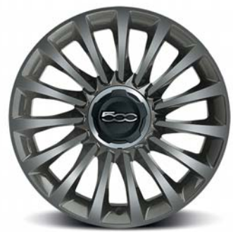
LINEACCESSORI 17" 225/45 R17 ECOREFLEX GREY ALLOY WHEELS