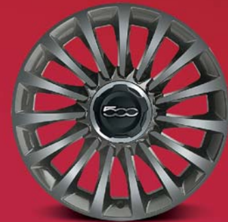
17" SILVER ALLOY WHEELS