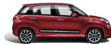
108 Opera Red (metallic)