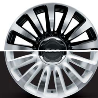
4WQ 16" ALLOY WHEELS WITH WHITE DIAMOND FINISH