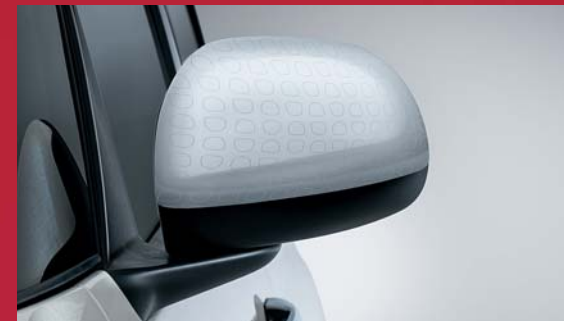
TECHNICS EFFECT WHITE MIRROR COVER