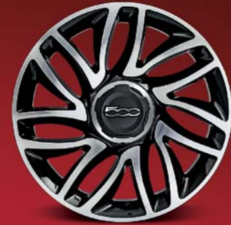
17" ALLOY WHEELS WITH BLACK DIAMOND FINISH