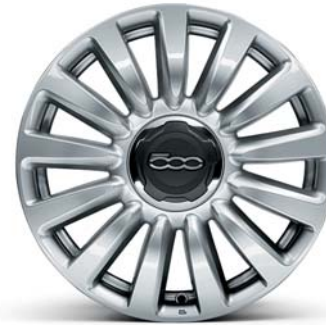
433 16" SILVER ALLOY WHEELS