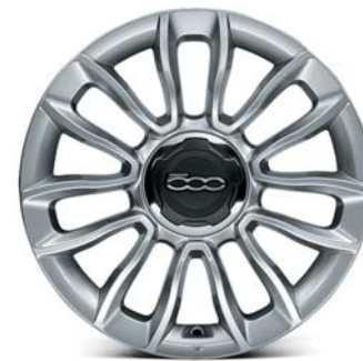
439 16" SILVER ALLOY WHEELS