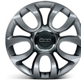
435 17" DARK GREY ALLOY WHEELS