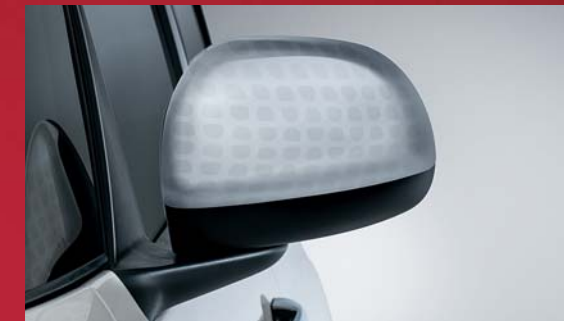
TECHNICS SILVER EFFECT ALUMINIUM MIRROR COVER