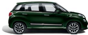
390 Beatbox green (metallic)