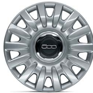
406 16" STEEL WHEELS WITH SILVER COVERS