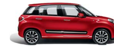
111 Pasodoble Red