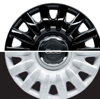
4XE 16" STEEL WHEELS WITH WHITE COVERS