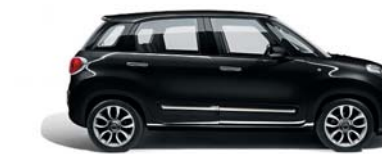
601 Darkwave Black