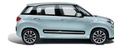
483 Bashment Blue