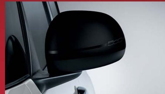
CERAMIC EFFECT BLACK MIRROR COVER