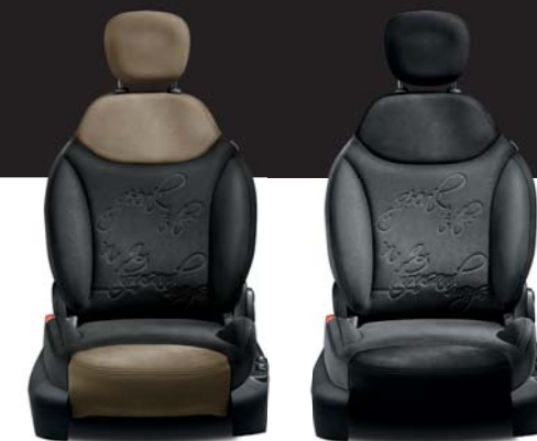
LOUNGE TRIM LEVEL (SUEDE DASHBOARD)