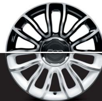
55E 16" ALLOY WHEELS WITH WHITE DIAMOND FINISH