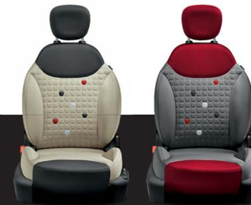
EASY TRIM LEVEL (SOFT TOUCH DASHBOARD)