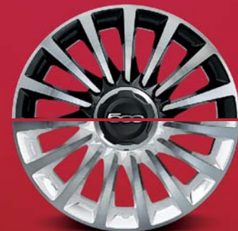
17" ALLOY WHEELS WITH WHITE DIAMOND FINISH