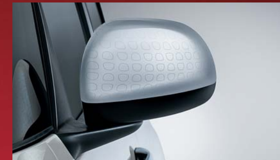
TECHNICS OUTLINE EFFECT ALUMINIUM MIRROR COVER