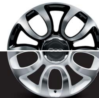
5FB 17" ALLOY WHEELS WITH WHITE DIAMOND FINISH