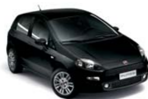
876 CROSSOVER BLACK* (metallic)