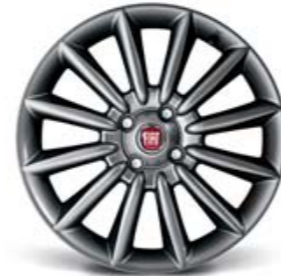
5A6 17" 12 Spoke Sportline Alloy Wheels Smoked Finish