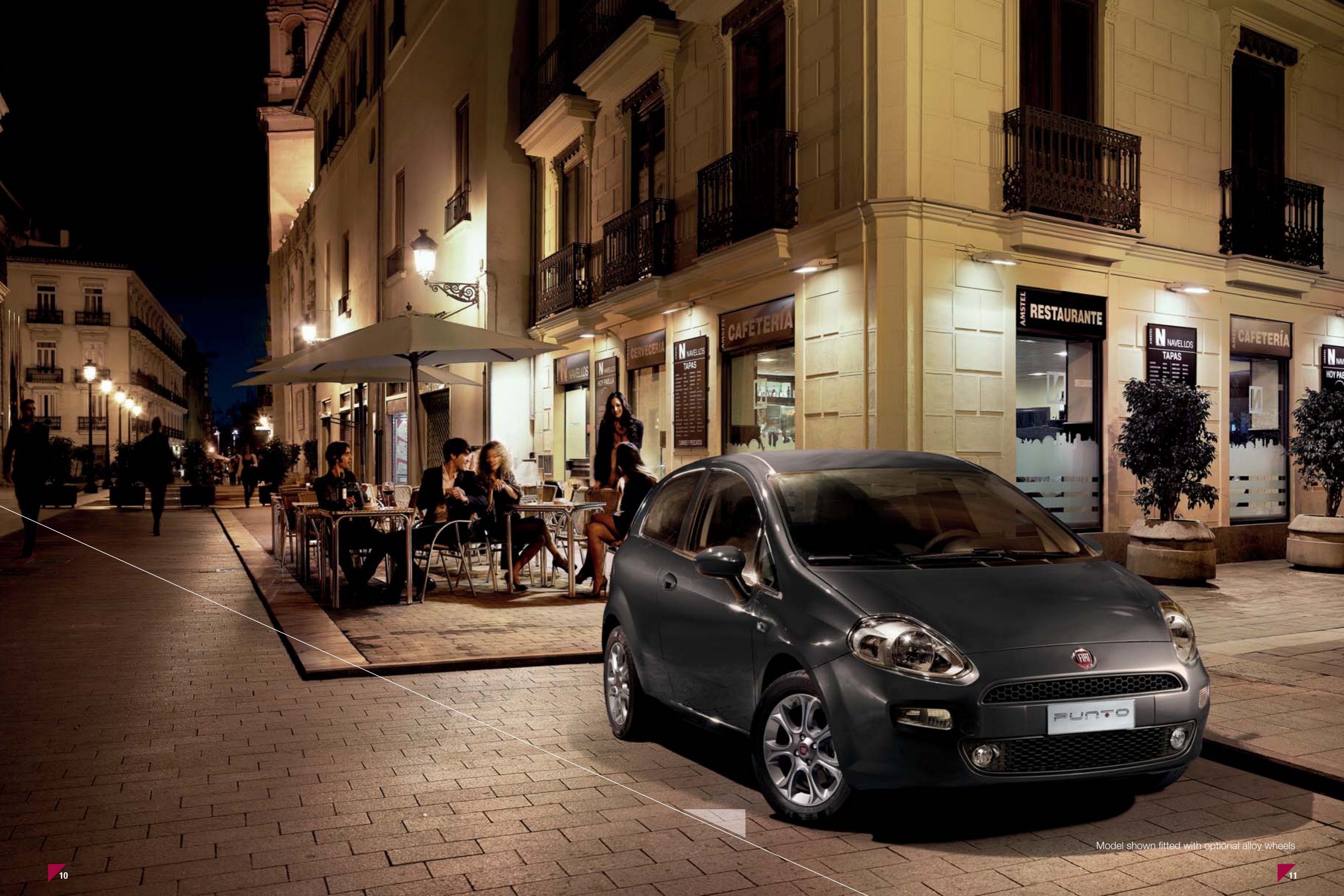
Model shown fitted with optional alloy wheels