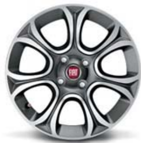
50902778 16" burnished alloy wheels with diamond finish (Lineaccessori)