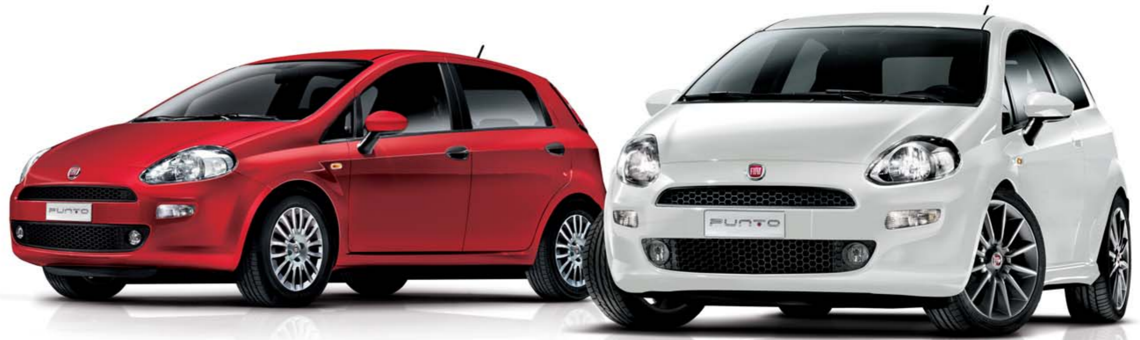
The Punto Pop and the Punto Easy for those who don't want to forgo style, functionality and elegance.*