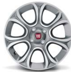
439 16" 7 Spoke 2-tone Sportline Alloy Wheels