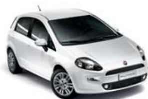
296 AMBIENT WHITE* (pastel)

Switch off boredom, start living in full colour. It's easy with the host of different colours available for the Punto range: choose the one that suits your personality, starting with the new Junglist Orange or Honky Tonk Blue.