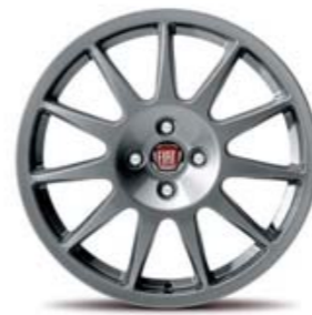
50902243 17" burnished alloy wheels (Lineaccessori)