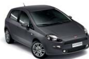
679 UNDERGROUND GREY* (metallic)