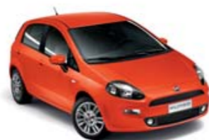
562 JUNGLIST ORANGE* (non-standard pastel)