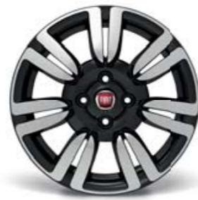
421 15" 'TwinAir' Multi-spoke 2-tone Alloy Wheels