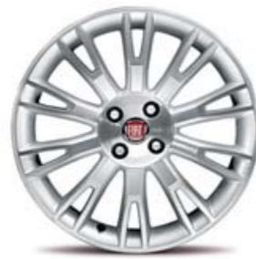
50901339 17" alloy wheels (Lineaccessori)