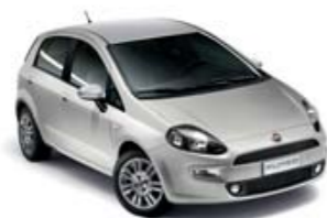
348 LYRICAL GREY* (metallic)