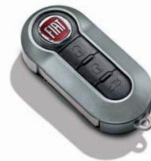
Matt titanium grey