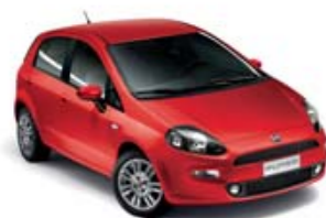
176 EXOTICA RED* (non-standard pastel)