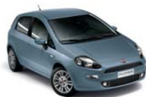
401 HONKY TONK BLUE (non-standard pastel)