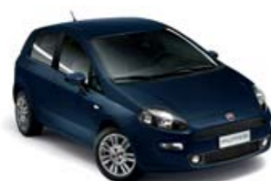
475 ROCK 'N' ROLL BLUE (pastel)