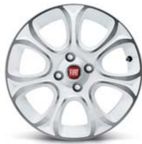
50902779 16" white alloy wheels with diamond finish (Lineaccessori)