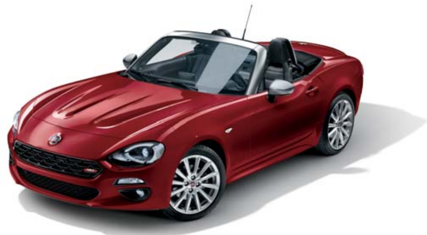
PASSIONE RED - SPECIAL PASTEL

EVERY DETAIL OF THE NEW FIAT 124 SPIDER HAS BEEN DESIGNED TO CREATE AN IMPACT. IN ITS ANNIVERSARY EDITION, THIS BRILLIANT ROADSTER COMES IN SPECIAL PASTEL RED COLOUR WITH 17" ALLOY WHEELS AND BLACK LEATHER SEATS WITH A DISTINCTIVE DESIGN.